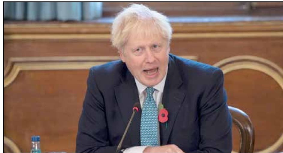
Backed into a corner? Johnson held a crisis lockdown meeting ahead of the decision

House believe we should have reached this decision earlier, but I believe it was right to try every possible option to get this virus under control at a local level, with strong local action and strong local leadership.