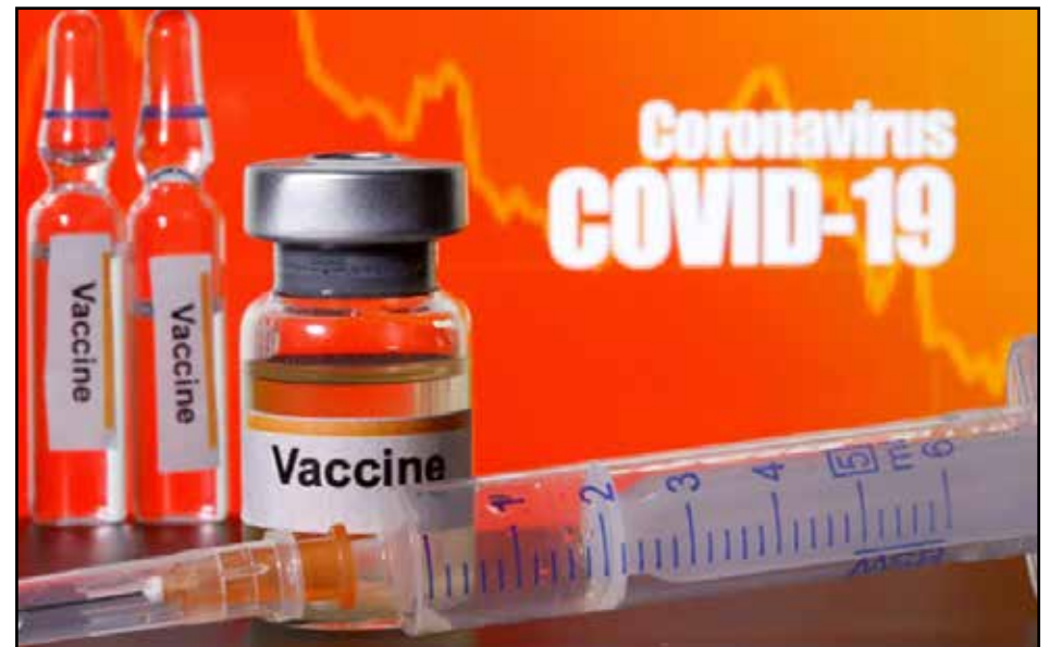
HIGH HOPES: Candidates from Oxford University/Astrazeneca and BioNtech/Pfizer are thought to be the frontrunners.

On the new tiering system for December, he said: "We'll have to work out ways we can advise people in a way that maximises their ability to keep with the essence of what is the festivity but minimises the risk of transmission and we are trying to work that