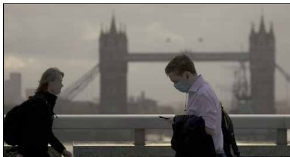
DARK DAYS AHEAD: the lockdown's end is scheduled to coincide with the start of the UK's Christmas shopping season

Meeting with other people is strongly discouraged by the new guidelines, with the only permissible exceptions being exercise in an outdoors space with people from the same household or support bubble, or with one