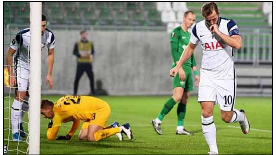
HARRY KANE: scored his 34th headed goal for Spurs Thursday night

• ARSENAL BOSS Mikel Arteta called for the introduction of the video assistant referee in Europa League group games despite Arsenal running out comfortable 4-1 winners against Molde on Thursday night.