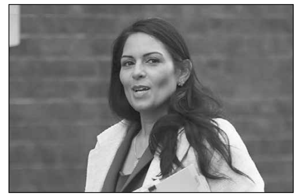
"SIGNIFICANT MOMENT": Patel said the Government will be able to set its own priorities as the country recovers from the pandemic.

Employers will be t encouraged to focus on r training and investing in c UK workers, especially those hit by the recent l crisis. She said: "Our new t immigration system will be an important pillar f in the Government's s strategy to boost our c economy, supporting businesses to grow and getting people back into