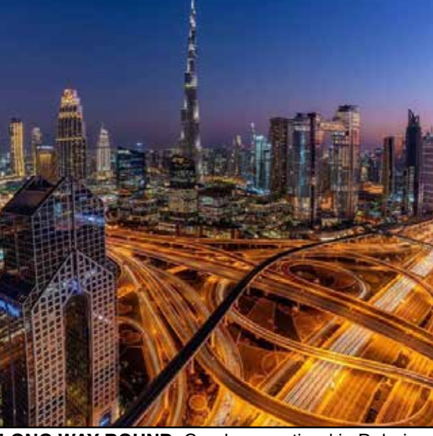
LONG WAY ROUND: Carol quarantined in Dubai

Covid 19 test 96 hours before arriving, and once there go through thermal imaging and temperature checks. I eventually holed up at Le Royal Meridien in Jumeriah Beach (If you are ever going stay here!) I had been the year before to shoot a music video for