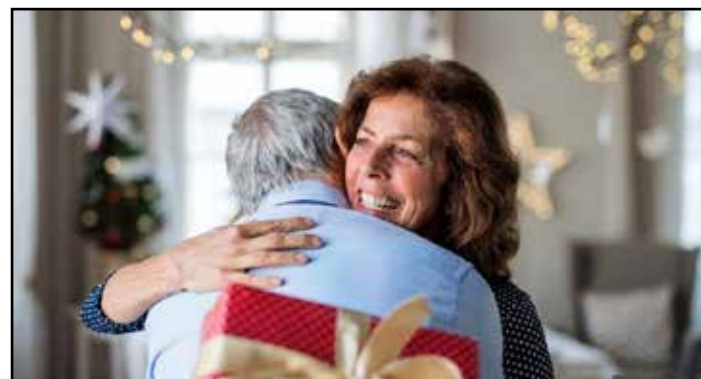
No hugging please, we're British - page 3

California's British Accent™ - Since 1984