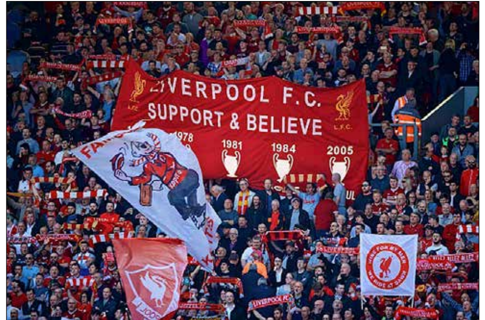
NOT SO FAST: Anfield won't be like it was anytime soon

Bielsa said: "The power of each club corresponds to that club, so there could be a rule that fans are not allowed in or everyone is allowed to have them. The question shouldn't be about the consequences of being in this category or that category, it should be about trying to maintain the competition as equal as possible with things