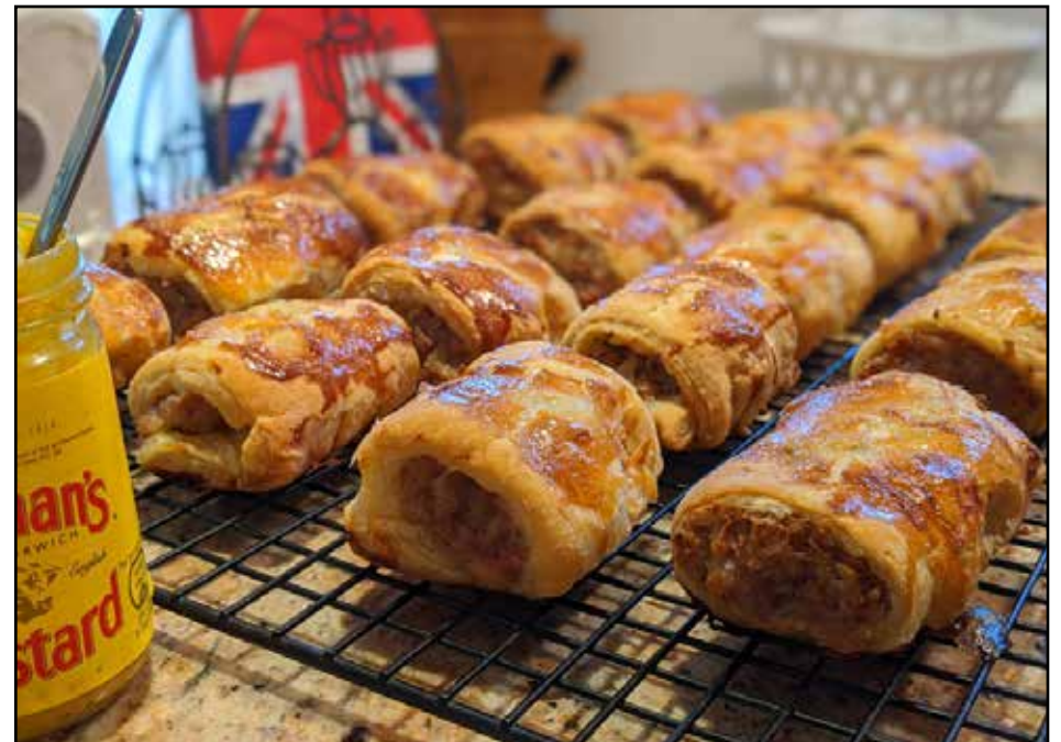
CLASSIC SAUSAGE ROLLS: available now at Simply Peckish

Then my god-daughter who is English and lives in New York posted a very unfortunate looking cake that she attempted to bake on Instagram and I suggested that we could do a weekly Zoom baking class to teach her how to bake. She was apprehensive at first as she had never baked in her life. She invited several of her friends to join the class and we ended up with people joining the class from