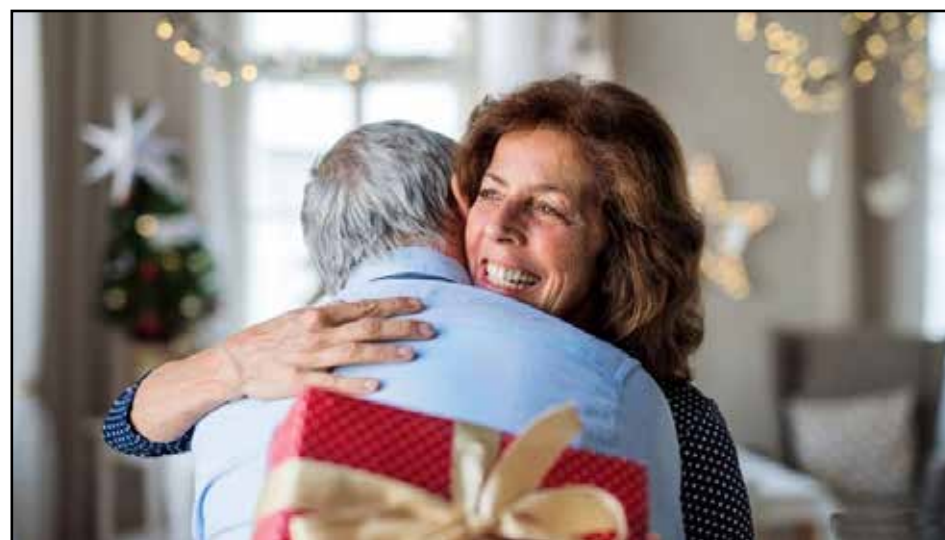
BRITISH RESERVE? this Christmas hugging will allowed but not encouraged

Cabinet Office Minister Michael Gove, who finalised the agreement with Scottish First Minister Nicola Sturgeon and others, said: "It will offer hope for families and friends who have made many sacrifices