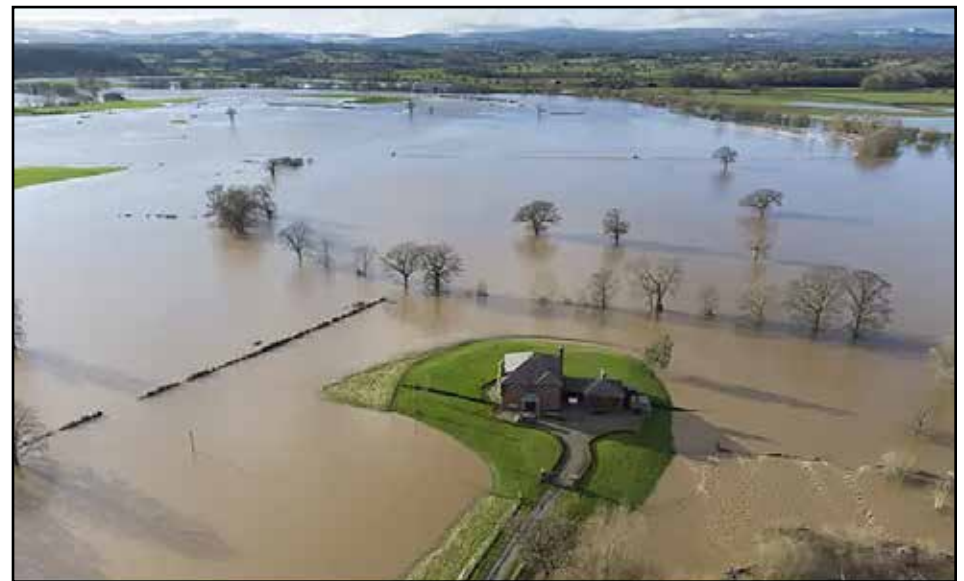
FIELDS AWASH: flooding near Bangor-on-Dee in Wales

were evacuated in Bangor-on-Dee and residents were told not to return despite river levels slowly dropping on Thursday afternoon.