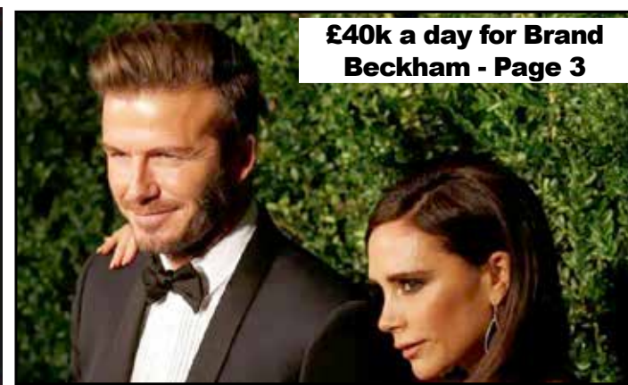
£40k a day for Brand Beckham - Page 3

California's British Accent™ - Since 1984