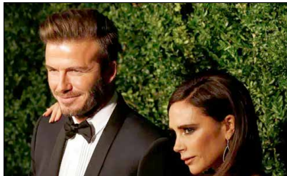
THAT'S RICH: the celebrity couple paid themselves £14.5m in 2020

VBHL said sales were boosted in the last quarter of 2019 by the launch of the Victoria Beckham Beauty brand, and the flagship