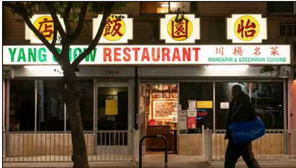
YANG CHOW: do not miss the Slippery Shrimp