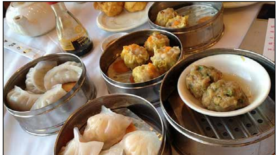
IT'S TAKEOUT ONLY: but the dim sum at Ocean Seafood remains hard to beat

surrounding areas. However I want to concentrate on authentic Chinese food, otherwise it's like going to Disneyland and not seeing Mickey Mouse. Amirite?