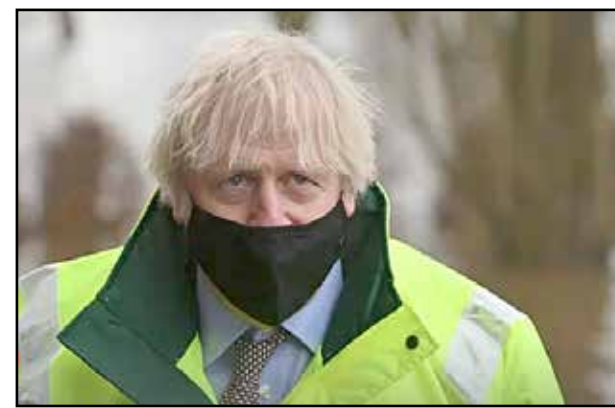
DARK DAYS AHEAD: the PM called for resolve

the Government might ease some restrictions "in the not too distant future, but they can't lift very many. It isn't at all easy and anybody who pretends that it is not being truthful. The faster we can extend vaccination to as many people as possible, the better."