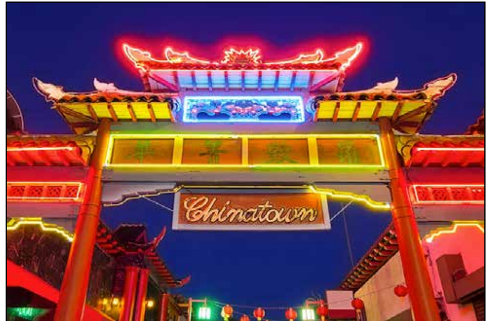
STILL IMPRESSIVE: Chinatown's entrance remains a head-turner

There are a slew of non-Chinese food spots popping up in Chinatown and its