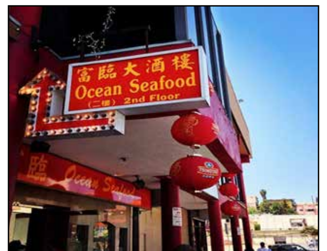
Familiar signs: Ocean Seafood on Hill Street

aren't more traditional dishes at Yang Chow. Their dumplings have fans across the city. I have it on good authority that the staff will try to dissuade you from ordering them because they take more time to cook and they want to turn the tables faster. But trust me- you're going to want them before your Slippery Shrimp.