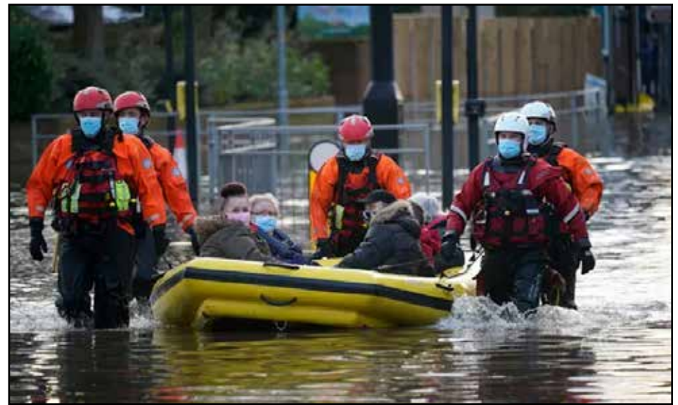
WATERY FATE: rescue crews at work in Cheshire on Tuesday