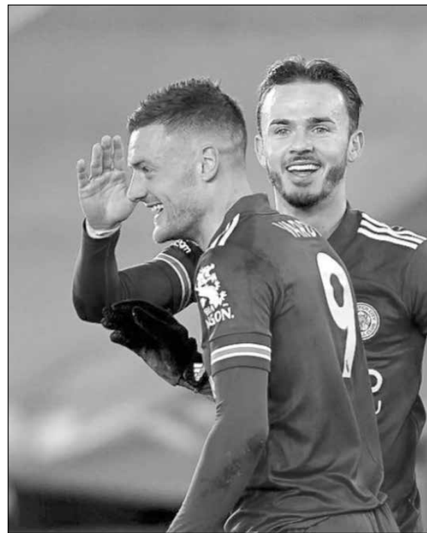
HOT STREAK: Leicester stars Vardy and Maddison

Aguero, who has been with the club since 2011, has only figured for 31 minutes since being substituted at half-time in the draw at West Ham on 24 October.