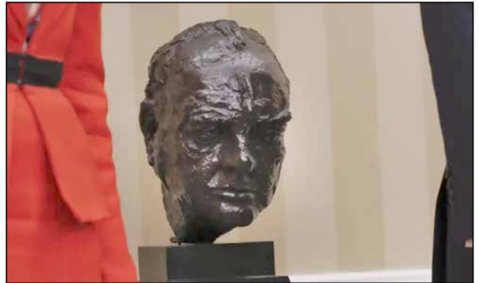
The bust of Winston Churchill, pictured in January 2017, when Theresa May met Joe Biden's predecessor, Donald Trump

When Theresa May went to Washington in early 2017 to be the first world leader to visit Trump in the White House, he swept her into the Oval Office to show that Churchill had been restored to prominence.