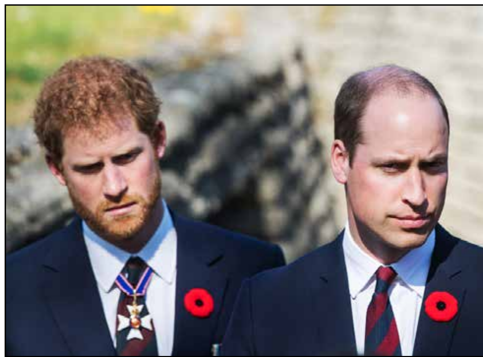
SITUATION FROSTY: The gulf between Harry and William remains wide

The former US First Lady, who knows Harry well, revealed her thoughts about the