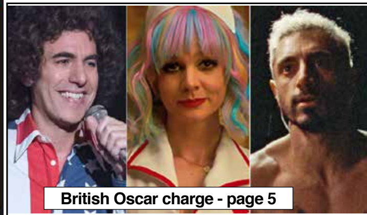
British Oscar charge - page 5

California's British Accent™ - Since 1984