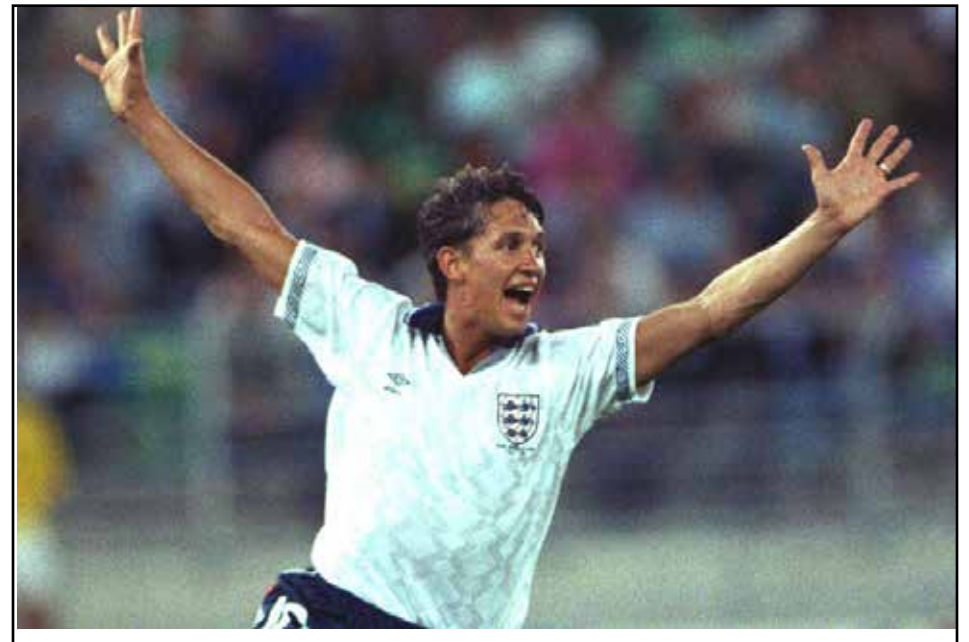
USING HIS NUT: Lineker in his England heyday

England forward Jeff Astle died in January 2002 aged 59 and later that year a landmark inquest ruling said his death was the result of an "industrial disease" resulting from heading footballs.