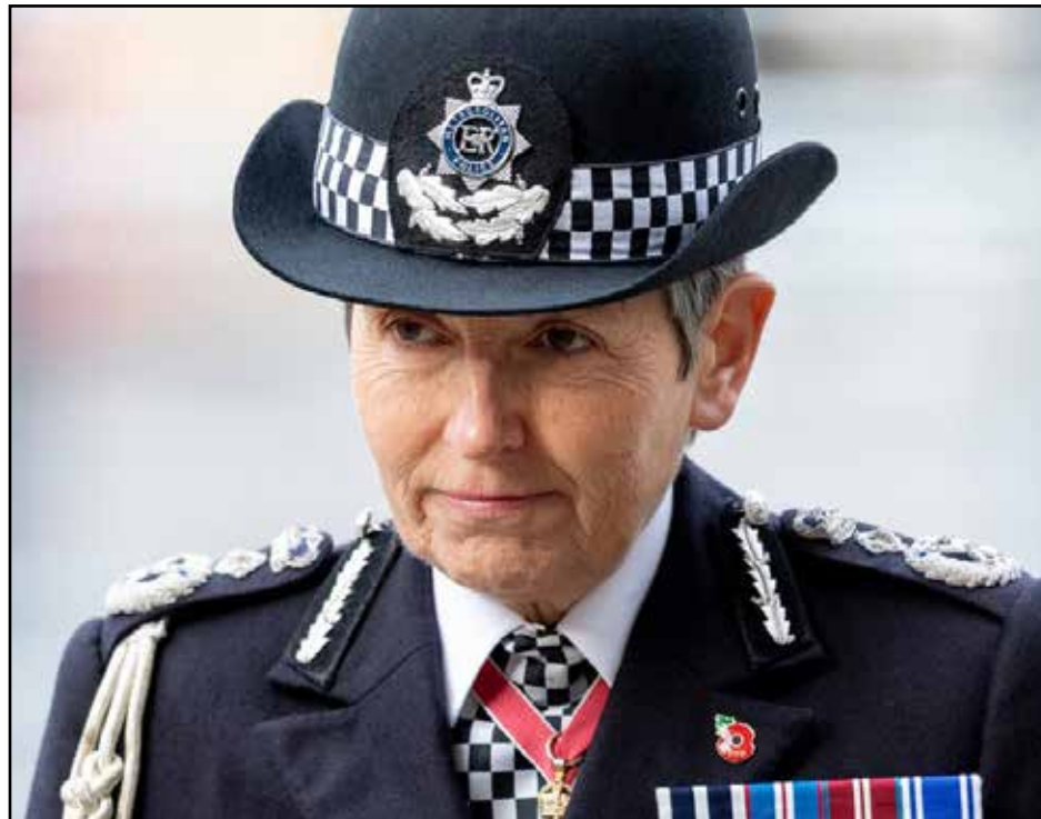
CRESSIDA DICK: said officers were often in very difficult situations.

And Home Secretary Priti Patel backed the Met chief but believes there are still "questions to be answered" about how the event was policed.