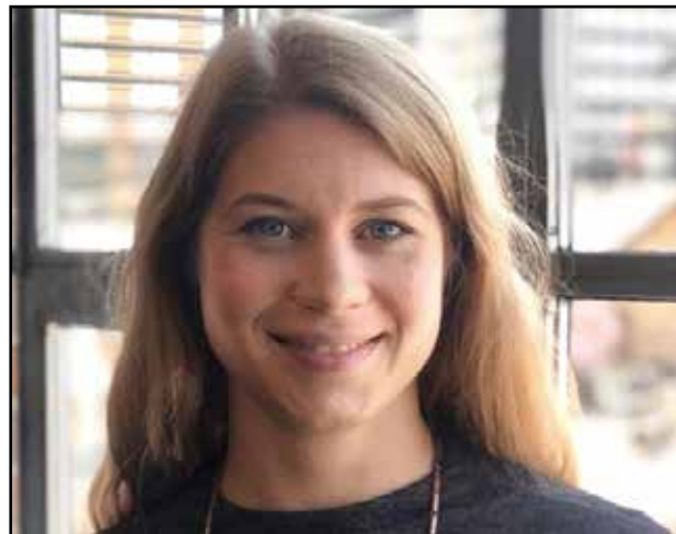
Sarah Everard's death has sparked an outcry