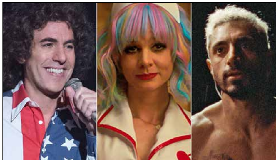
Sacha Baron Cohen, Carey Mulligan and Riz Ahmed are among the British nominees

The eight British acting nominees range from Ahmed, who receives his first Oscar nomination for playing a drummer who loses his hearing in Sound of Metal, to Sir Anthony,