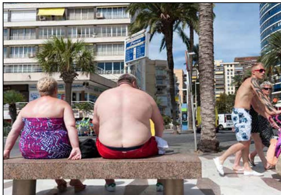
ANNUAL RITUAL: British holidaymakers in Magaluf, Spain

European Commission vice-president Vera Jourova said: "We all want