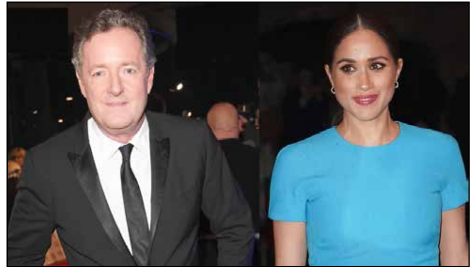
HAPPIER DAYS: Piers Morgan and Meghan Markle were once friendly.....

that even if Meghan's debunked claim about her son Archie being barred from the title of prince because of his skin colour was untrue, it was still her "lived experience" and should be respected.