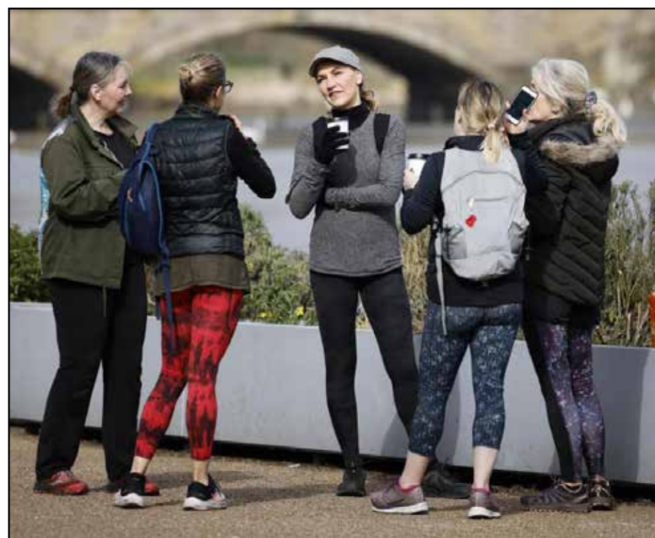
THE SIMPLE PLEASURES: Londoners gather for a chat by the Thames

A few hours later, bosses at golf courses across the country woke up to long queues as players deprived of a round for