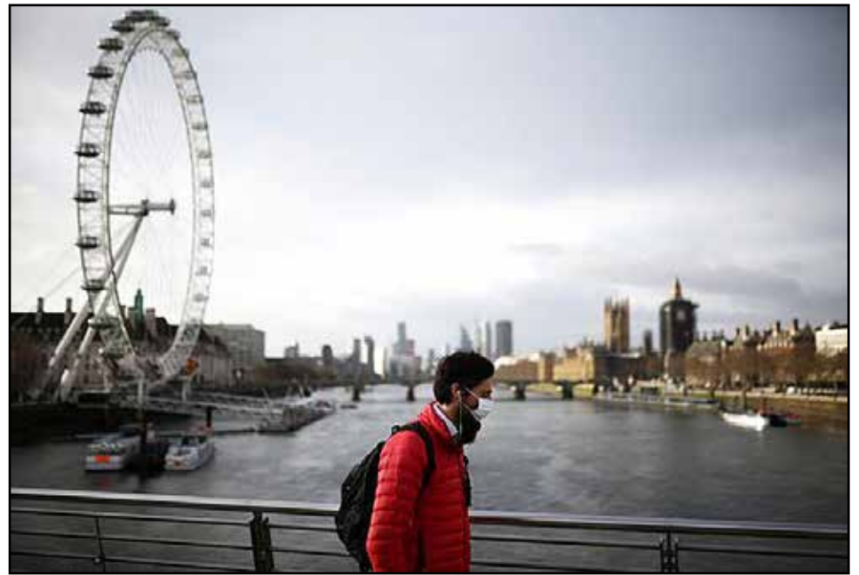
THE TIDE IS TURNING: UK deaths were down to just 23 on Monday

rising across the Channel and it's inevitable, as we advance on this roadmap, that there will be more infections and unavoidably more hospitalisations, and sadly more deaths."