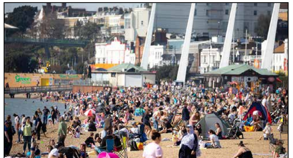
FORGOTTEN ALREADY? the scene in Nottingham this week

“But that wave is still rising across the Channel and it is inevitable as we advance on this roadmap that there will be more infections, and more hospitalisations and sadly more deaths. So what we need to do is continue flat out to build the immunity of our population, build our defences against that wave when it comes.”