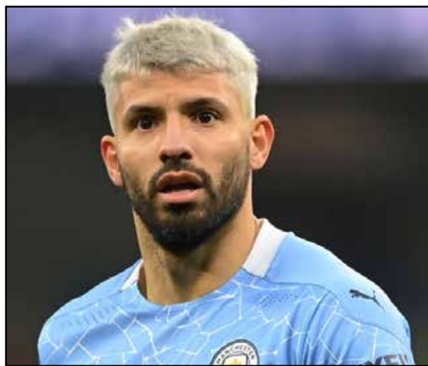
CITY LEGEND: Sergio Aguero

Revealing his decision to bring to an end a decade of stunning success at the club, Aguero posted an emotional farewell message on Twitter. It read: "When a cycle comes to an end, many sensations arise. A huge sense of satisfaction and pride remains in me for having played with City for a whole 10 seasons – unusual for a professional player in this day and age.