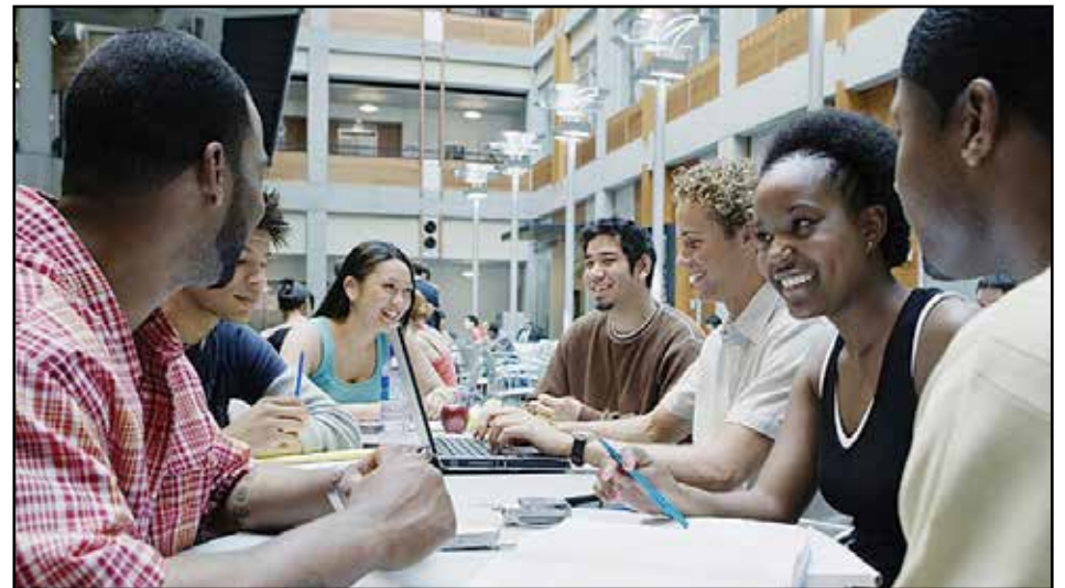
The Commission on Race and Ethnic Disparities this week said Britain had become a more open society....a claim quickly disputed by many

The contents made public so far have led to criticism by some charities and unions, who said that the findings were