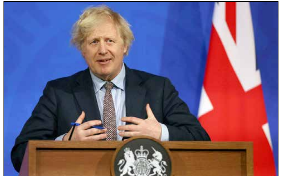
WHAT ME, GLOAT? Boris milks the moment this week

“The UK’s vaccination programme has been a national success, with over 30 million people now having received a