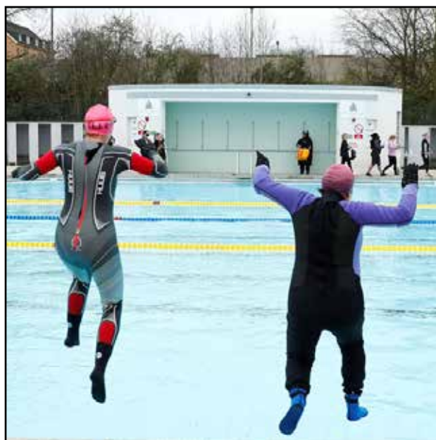
JUMPING BACK IN: public pools saw long lines

Leading gym chain David Lloyd welcomed back members, with classes and equipment in open marquees. In all, the