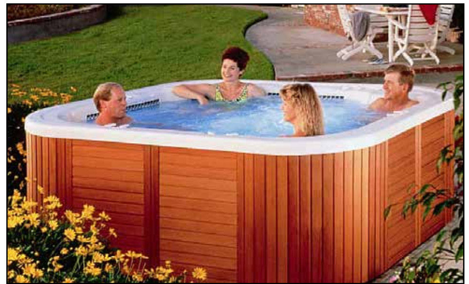
HOT PROPERTY: the UK has seen a surge in jacuzzi larceny