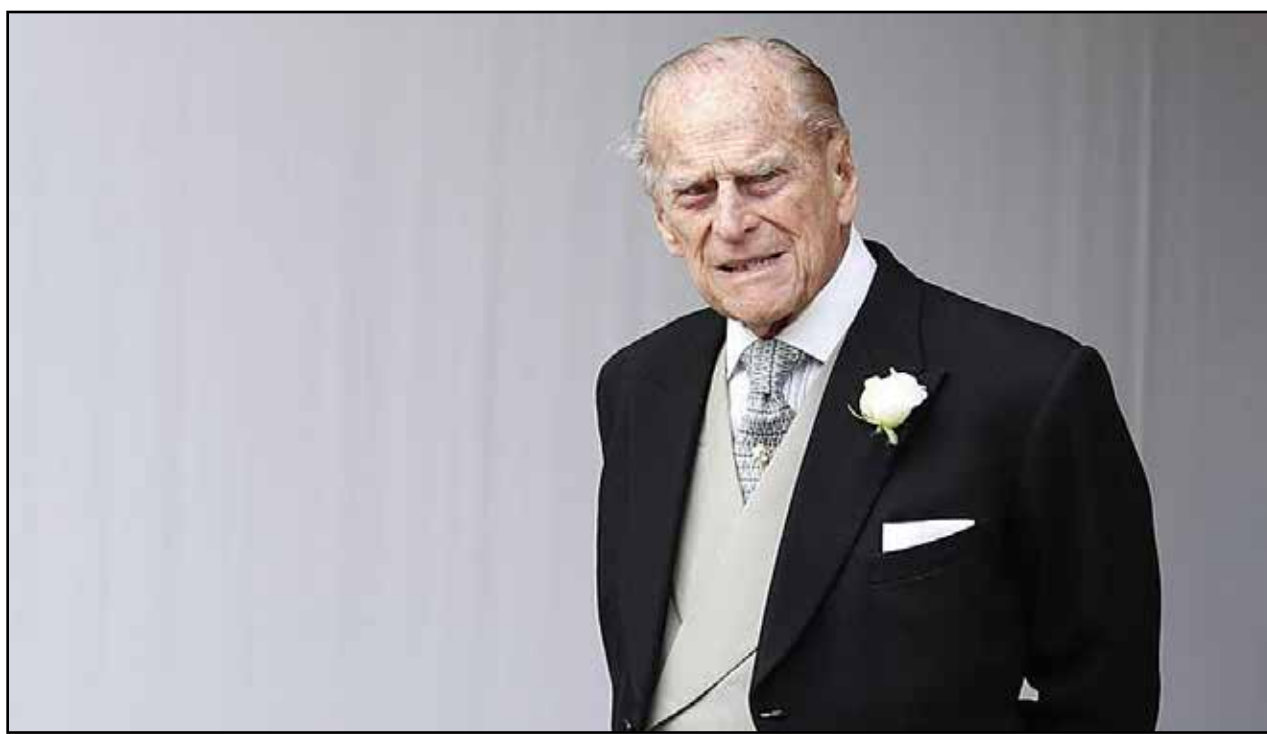
GOOD INNINGS: Philip died at Windsor Castle last Friday at the age of 99