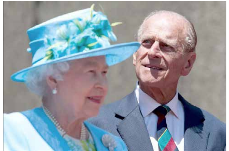
LONGEVITY: the royal couple married in 1947

were grateful for all the "amazing tributes" to his father.