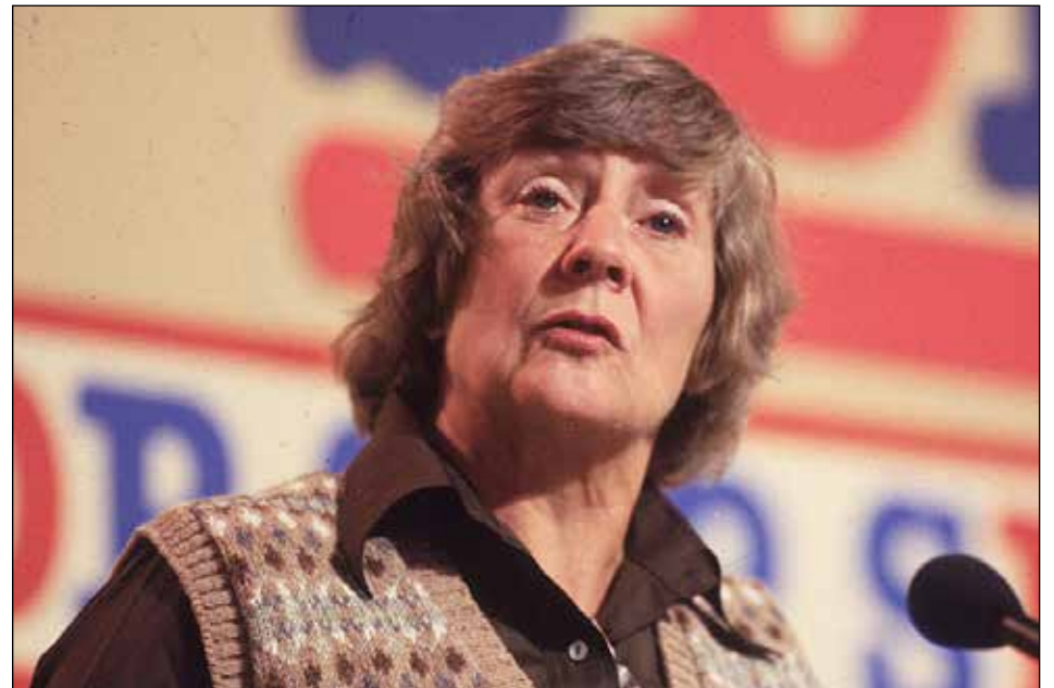
SHIRLEY WILLIAMS: "a tireless champion for the causes she believed in"

"She would have beaten Roy Jenkins, she would have beaten me.