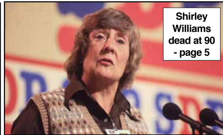
Shirley Williams dead at 90 - page 5

California's British Accent™ - Since 1984