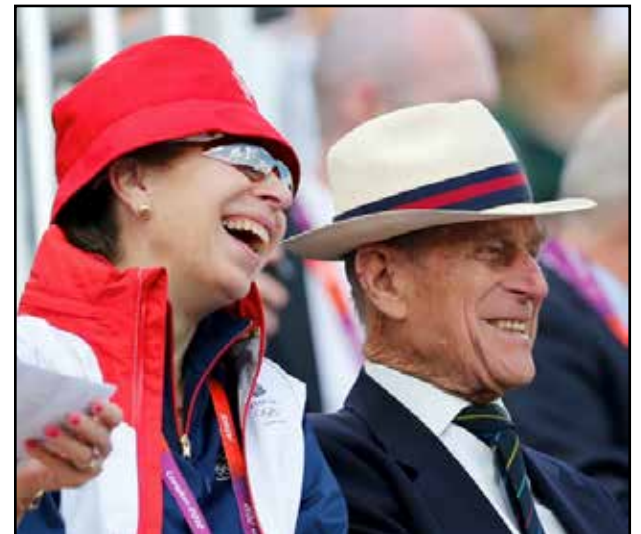
FATHER DAUGHTER TIME: Anne shared a picture of the pair at the 2012 London Olympics

“The word I was given was that those conversations were not productive. But they are glad that they have at least started a conversation,” she said.