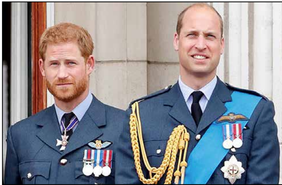
SITUATION FROSTY: Wills and Harry have barely spoken in months

The procession order was “a practical change rather than sending a