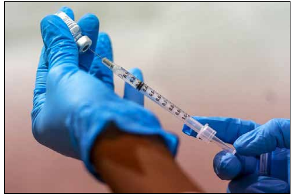
The UK has secured an extra 60 million doses of the Pfizer/ BioNTech vaccine

Mr Hancock said: “We are working on it right now, and in fact I had a meeting on this yesterday, to make sure we can get the rules right so that people can safely leave a care home and come back without