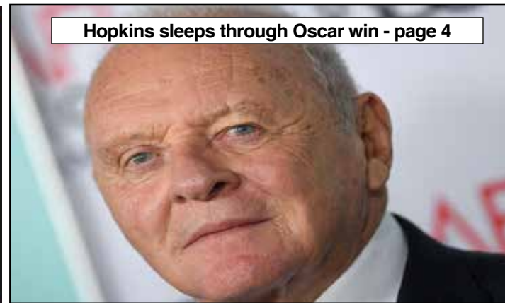
Hopkins sleeps through Oscar win - page 4

California's British Accent™ - Since 1984