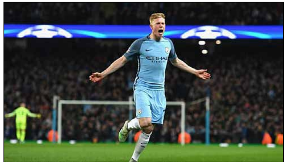
COMETH THE HOUR, COMETH THE MAN: De Bruyne shone for City on Wednesday

Walker began pushing up the flanks, and City looked much better. De Bruyne nearly pulled off a spectacular scissor kick, the ball going just over.