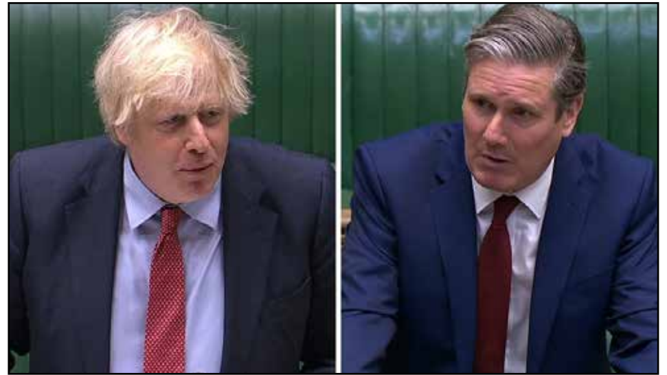
FLAT BROKE? Labour leader Sir Keir Starmer (right), mocked the PM over the affair, referring to him as 'Major Sleaze'

"We will continue to work constructively with the Electoral Commission on this