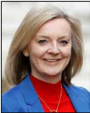
Trade Secretary Liz Truss

She said it was based on a "static analysis" of the position now but the world will be "very different in 2030".