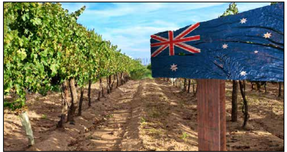
BIG DOWN UNDER: Australia was the UK's fifth largest trading partner in 2019

"But what we will do through this trade deal is to make sure we get