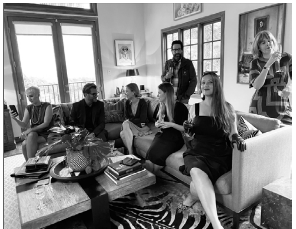
CHEZ YOUNG: Small gatherings inside are now allowed with fully vaccinated people