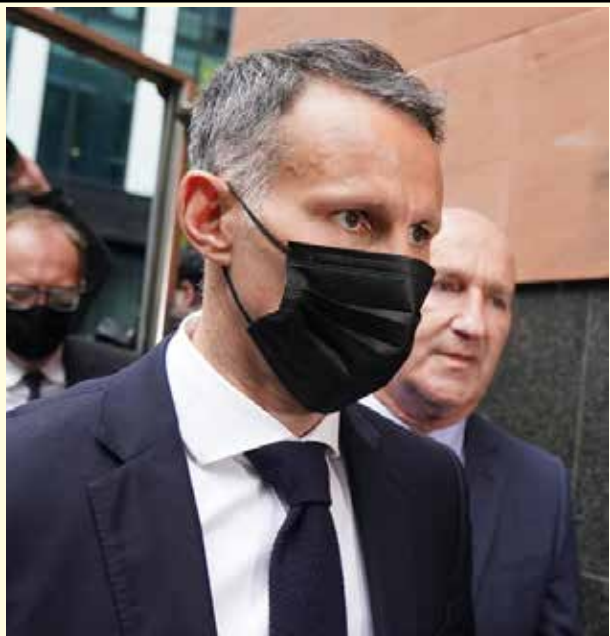
Ryan Giggs arriving at court this week