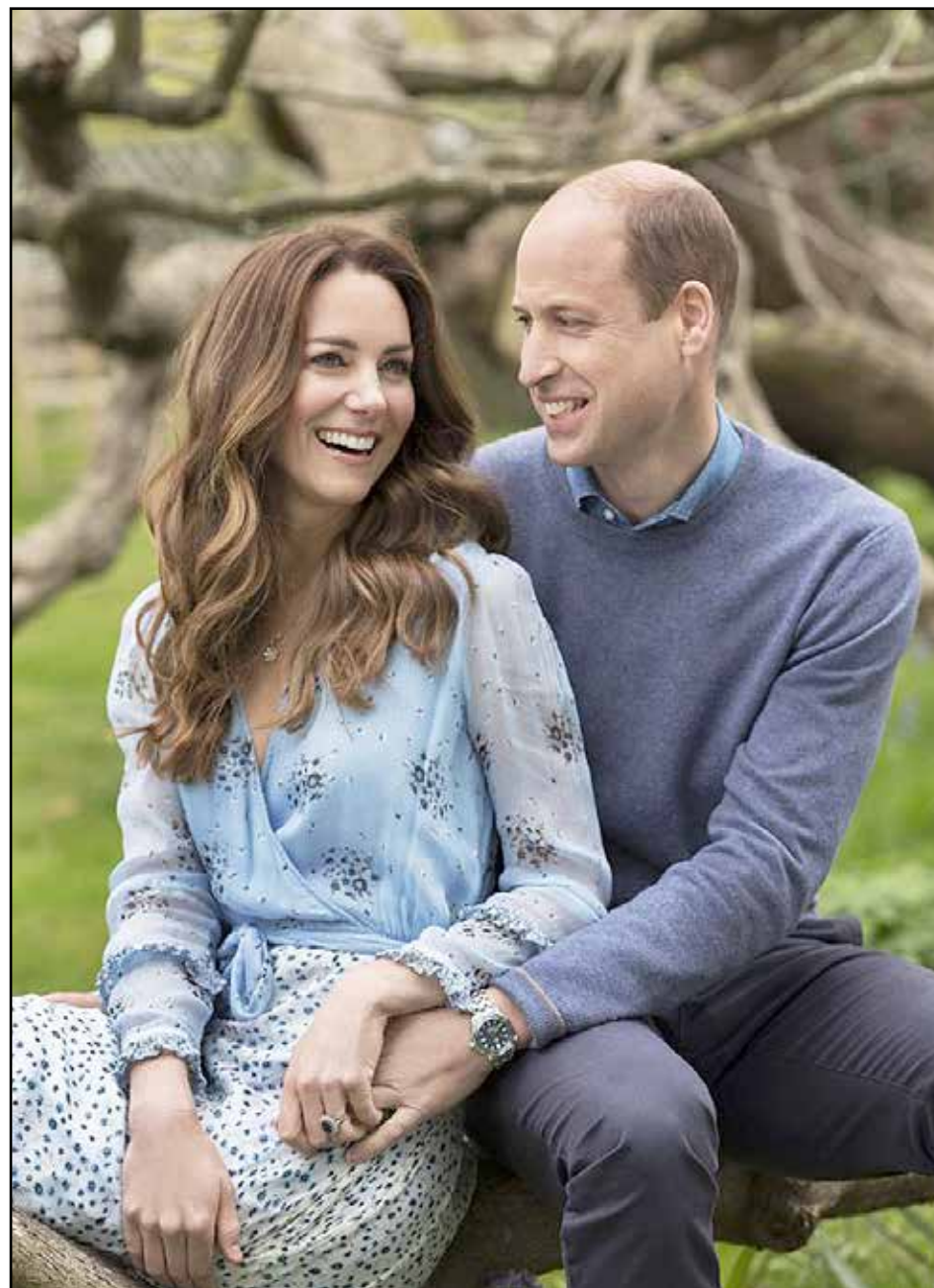
SO FAR, SO GOOD: William and Kate married on April 29, 2011. The royal couple have three children.