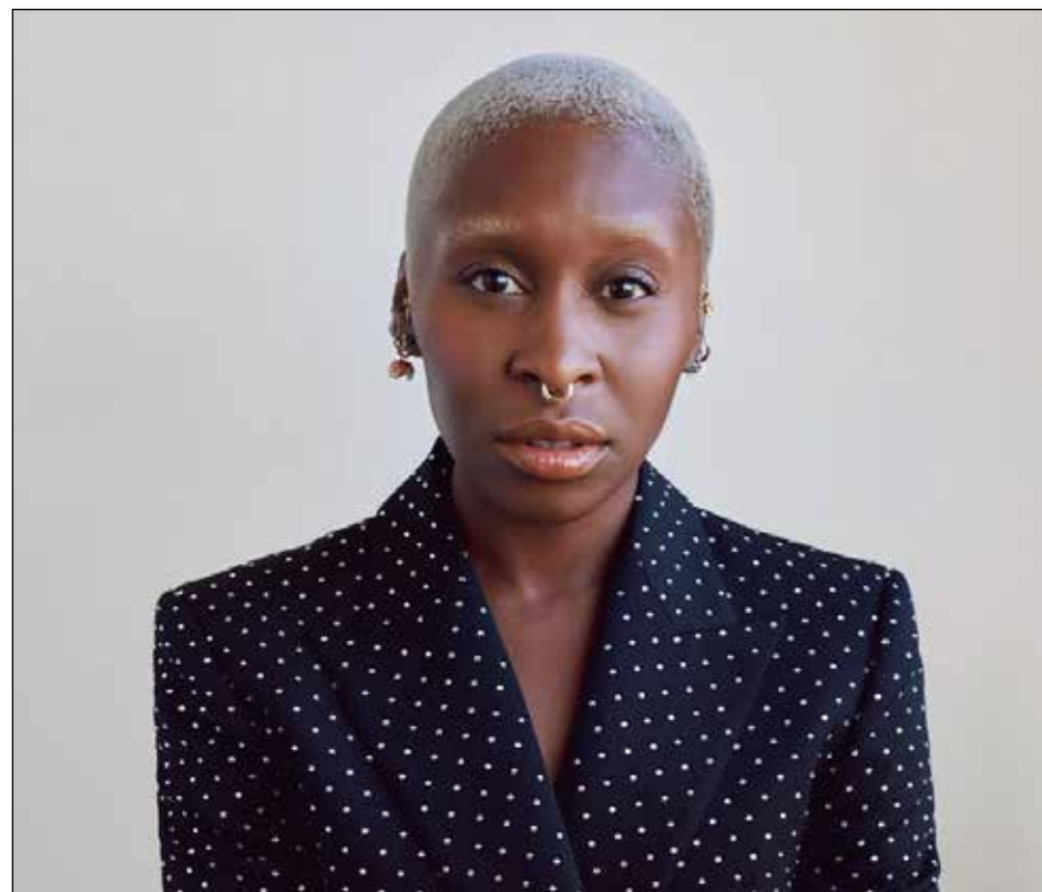
Best of British: Grammy, Tony and Emmy winner Cynthia Erivo performs at the Hollywood Bowl next month

Everyone's favorite "Gothfather", Gary Numan, returns to Los Angeles with a show at the Fonda Theater on September 27. Tickets went on sale to the general public on Friday and are priced at $40. Visit axs.com for details. Gary shot to fame way back in the late 1970s as the brains behind electronic music pioneers Tubeway Army before going solo and scoring the monster hit "Cars". Numan is touring in support of his new album Intruder , released