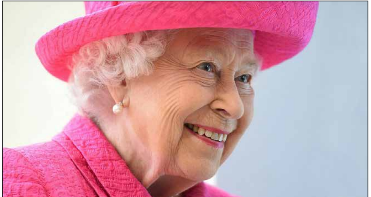
In February the Queen will become the first British sovereign to have been on the throne for seven decades.

and her family will attend a thanksgiving service at St Paul's Cathedral. Further events will be announced.