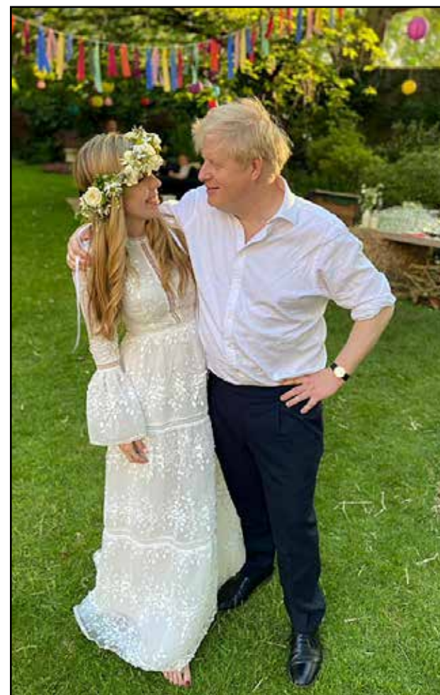
INTIMATE AFFAIR: just 30 guests were invited to the ceremony at Westminster Cathedral

The last prime minister to get married while in