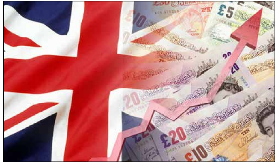
ON THE UP: Britain's GDP growth is expected to hit 7.2% in 2021

expected consumption if households run down excess savings more than assumed could boost growth considerably, while weaker than forecasted consumption and higher savings could lead to lower growth," it said.