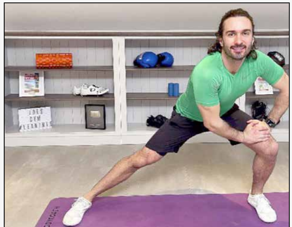
JOE WICKS: "The gratitude from people was amazing..."

"The gratitude from people was amazing, not just from the kids but from widows and people in care homes, saying, 'You got me through a really difficult