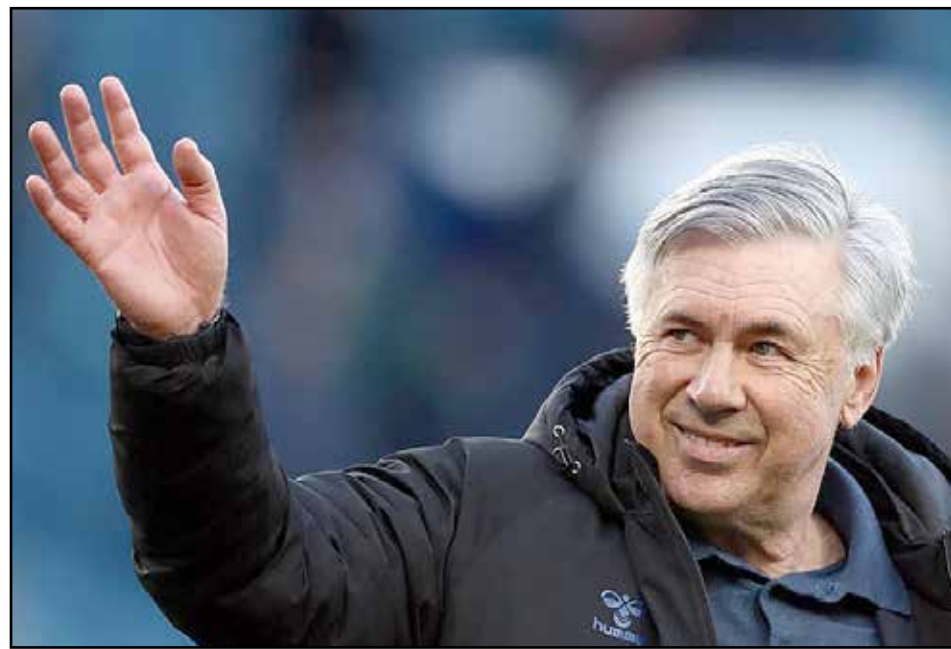
ARRIVERDERCI! Carlo Ancelotti lasted just 18 months at Goodison Park