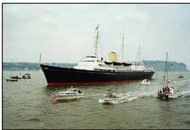
SORELY MISSED: HM Y Britannia leaving Cardiff ahead of her decommissioning in 1997

And she is unlikely ever to use the Royal