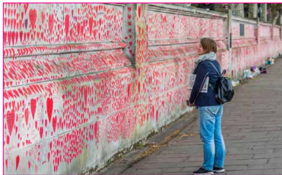
The national Covid memorial wall outside St Thomas' hospital, London, with hearts representing those who have died with Covid.

Boris Johnson believes there is nothing in the data to suggest there needs to be a delay to the June 21 removal of the remaining