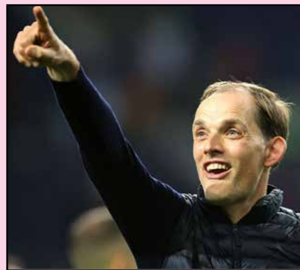
Magic Tuch? The German has overseen a stunning transformation at Chelsea this term

in Porto triggered an extension clause in Tuchel's 18-month contract that was set to run out next summer.