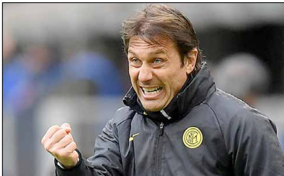
ANTONIO CONTE: left Inter this week after guiding them to a Scudetto title