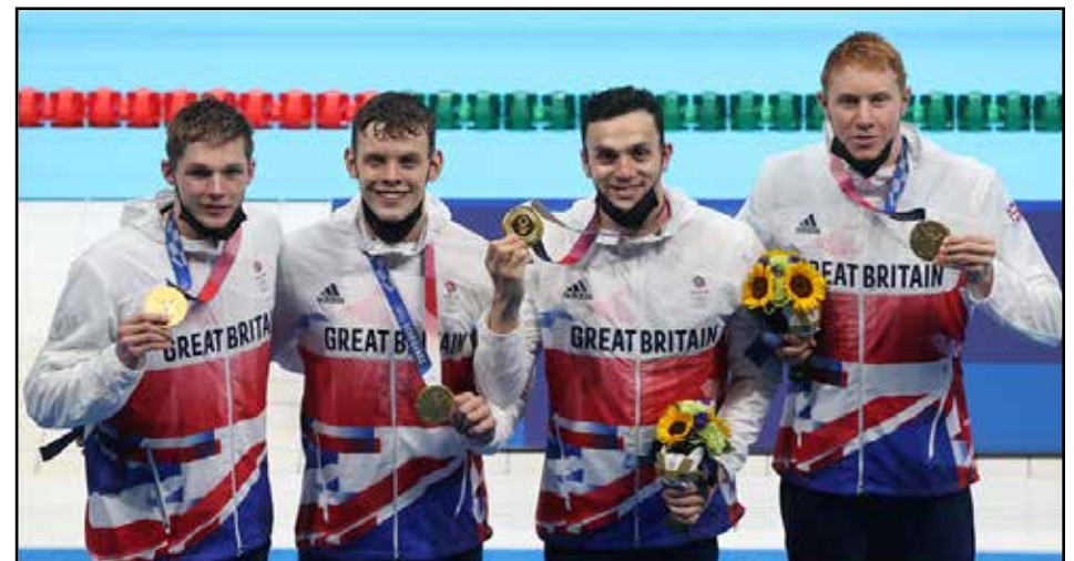
IN THE SWIM: Duncan Scott, Matthew Richards, James Guy and Tom Dean of Team Great Britain pose with their gold medals for the men's 4x200m freestyle

"This is the single greatest achievement of my life," the 21-year-old said in a news conference after his victory in the men's 200-meter freestyle Tuesday. "It's amazing. It's a dream come true having a gold around my neck."