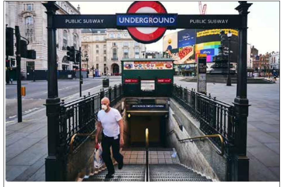
More than 37 million people in the UK have received both doses of a Covid jab.