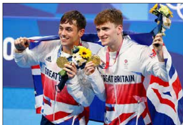
GOLDEN BOYS: Tom Daley and Matty Lee

The 26-year-old punched the water in jubilation as he clocked the fifth-fastest time ever