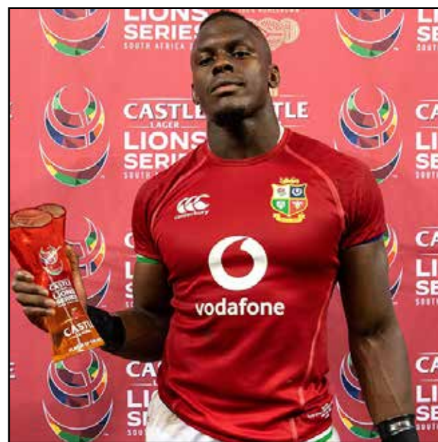
ITOJE: The Springboks – we know they are coming."

"Looking at the 2001 Tests in Australia, the Lions won the first Test quite convincingly and then went on to lose the