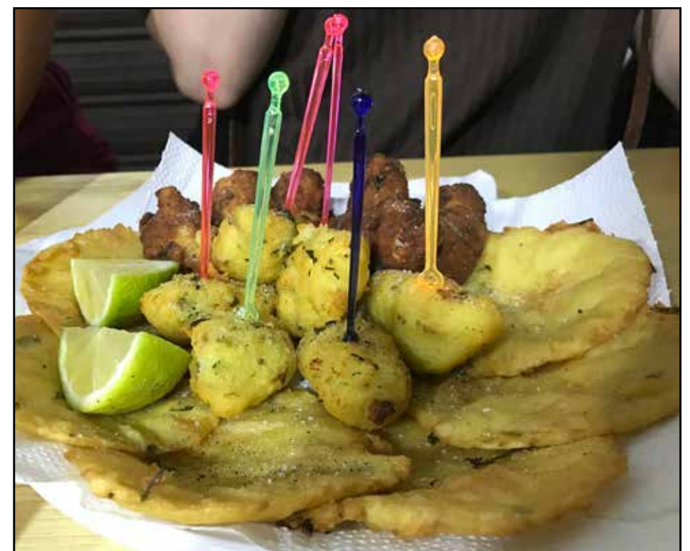
CHICKPEAS, THREE WAYS: the Sicilians are endlessly resourceful in creating delicious dishes from the most humble of ingredients