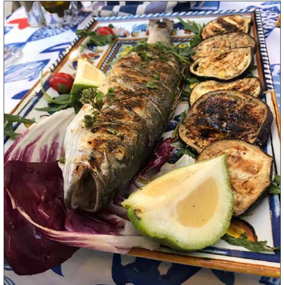
THRILL FROM THE GRILL: Loup de Mer at Osteria Paranza

If you like classic architecture, dilapidated buildings and a more than a hint of the Moorish, you will love this town, especially its three main markets, Capo, Vucciria and Ballaro,, all reminiscent of Arab souks. I found the abundance and variety of food staggering. Despite some wonderfully enticing fruit and vegetables, I was captivated by the food stalls, hawking local delicacies including fried