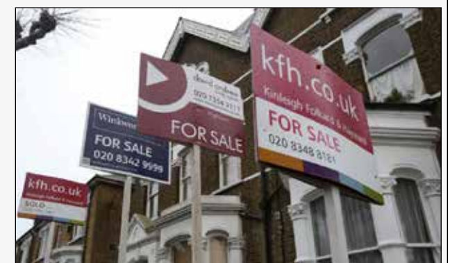
SIGN OF THE TIMES: prices just keep rising...

Looking at property types, the search for space