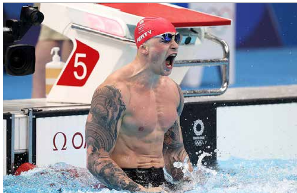
ADRIAN PEATY: the first British swimmer to retain an Olympic title in the 100m breaststroke