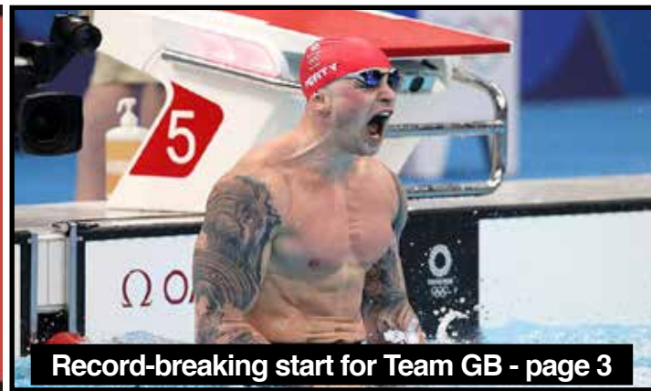
Record-breaking start for Team GB - page 3