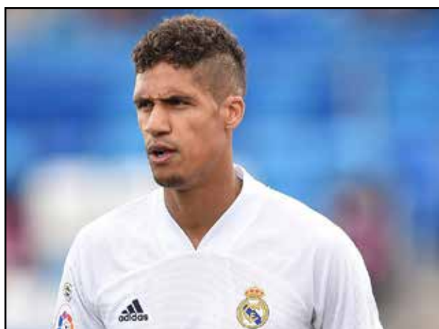
WORLD CUP WINNER: Rafael Varane

agreed, only a medical stands in the way of the club unveiling their latest acquisition later this week.