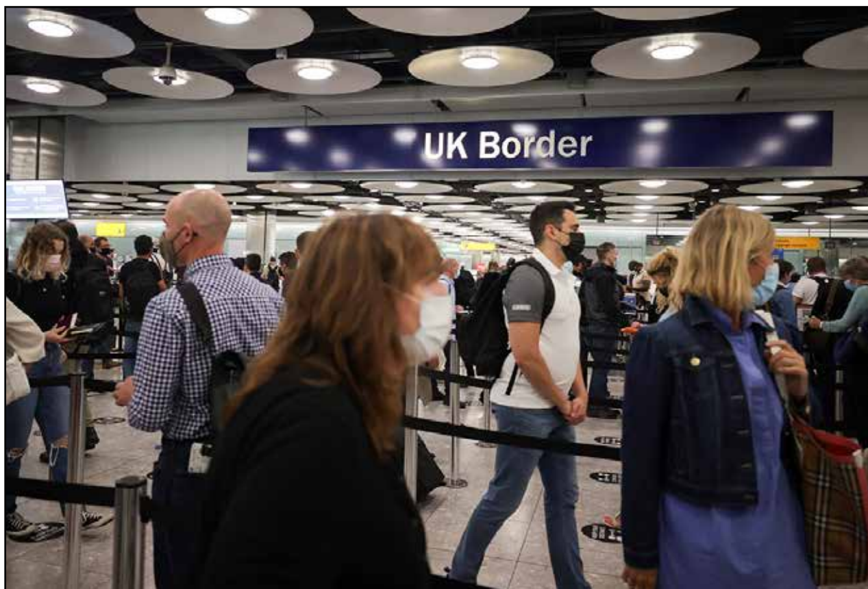
CROWDS AHEAD: the travel industry expects the change to prompt a surge of tourists into the UK

Mr Shapps said this advice would be reviewed at "the end of next week" as part of the rolling assessment of travel rules.