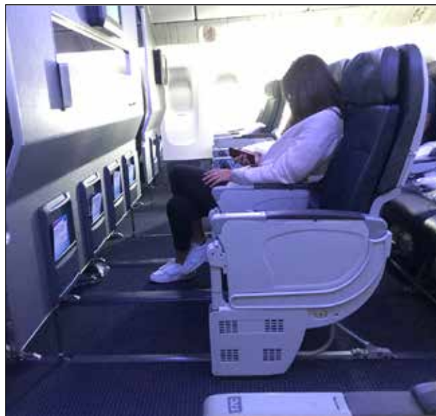
Eight seats, two occupants: Covid times

frutti di mare, the locally famous gambero rosso (red prawns) cooked on the grill to order, and the sublime sarde a beccafico (stuffed Sicilian sardines). In these situations I always wish I had the capacity to eat every hour, on the hour, to satisfy my curiosity. The garrulous and exuberant food stall barkers, who