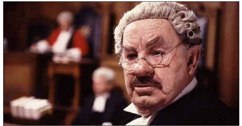
SMALL SCREEN LEGEND: Leo McKern as Rumpole

Sources say the remake will reflect the current state of the sexes in the courts, where there are now more female