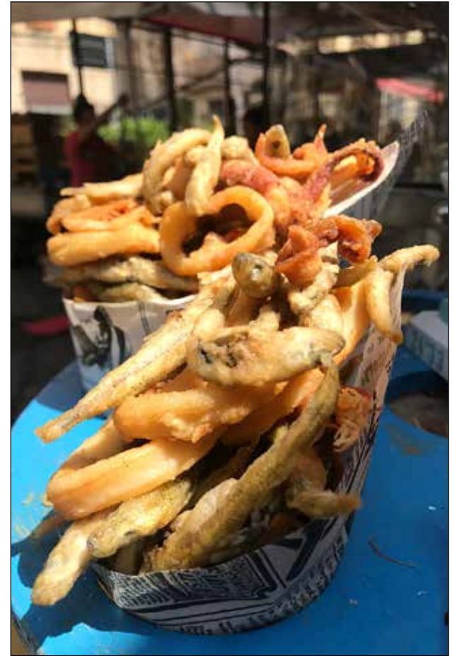
FRIED DELIGHT: Sicilian Frutti di mare