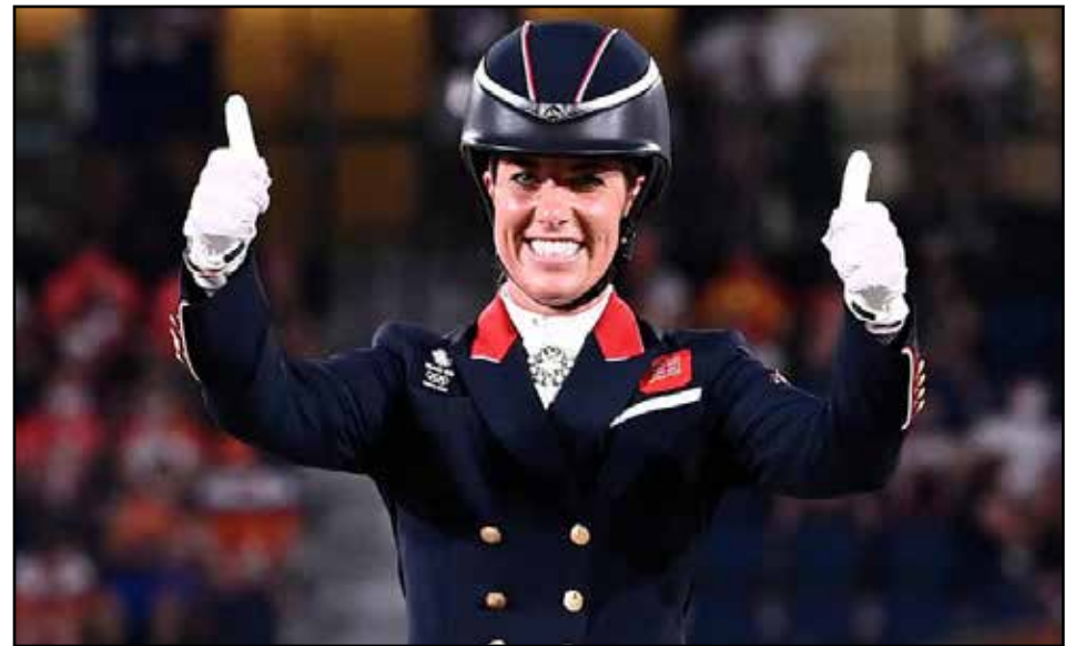
NICE HAUL: Dujardin has three gold medals, one silver and two bronze

Dujardin's collection of three gold medals, one silver and two bronze moves her ahead of the five medals won by the British rower Katherine Grainger and the tennis player Kathleen McKane Godfree.