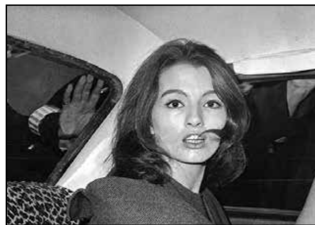
Christine Keeler: iconic 1960s figure in the UK

But details kept coming out—British newspapers called it the "Scandal of the Century"—and he