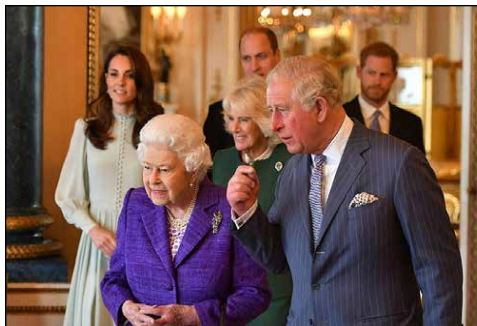
Showing her age at last? The Queen was briefly hospitalized this week

The monarch was scheduled to attend the high-profile event in Scotland, but she cancelled her original plans after undergoing preliminary medical checks and will instead address the delegates "via a recorded video message".