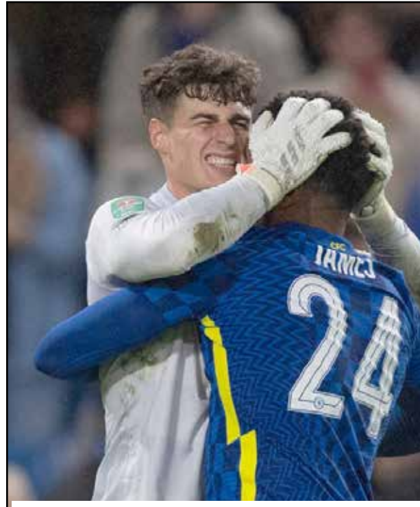
FEELING THE LOVE: Arrizabalaga embraces James

Hammers keeper Alphonse Areola made a fine save to keep out John Stones' close-range header while West Ham's best chance in normal time fell to Tomas Soucek.