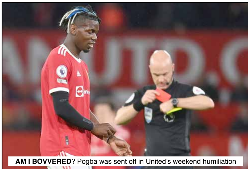
AM I BOVVERED? Pogba was sent off in United's weekend humiliation

Arsenal, hoping to win the competition for first time since 1993, will find out their last-eight opponents in Saturday's draw.