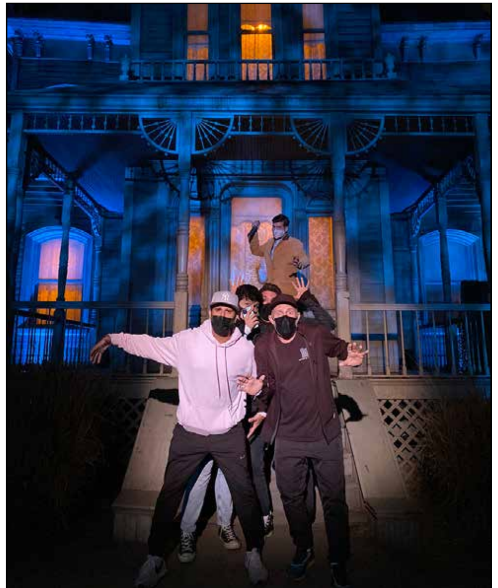
LET'S FACE IT: there's nothing quite so much fun as dressing up and getting scared silly...

This maze and I have a bit of a beef. I remember when it debuted back in 2017 and feeling incredibly let down by the end result. Going into this maze this