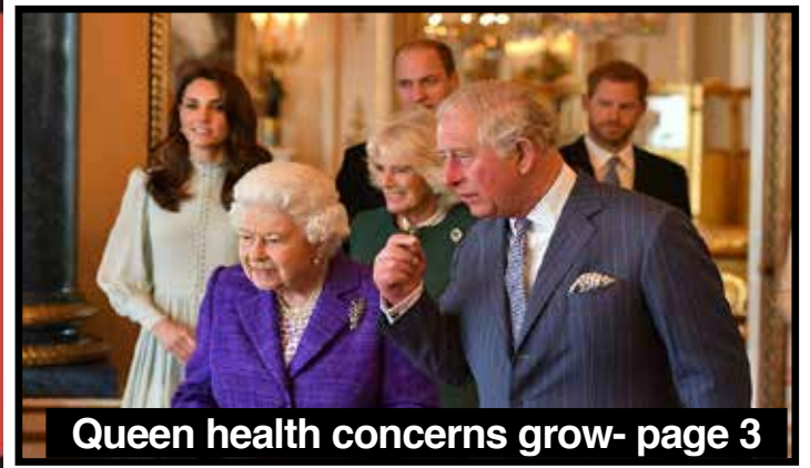
Queen health concerns grow- page 3