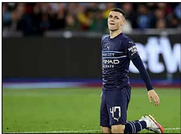
PHIL FODEN: penalty miss for City