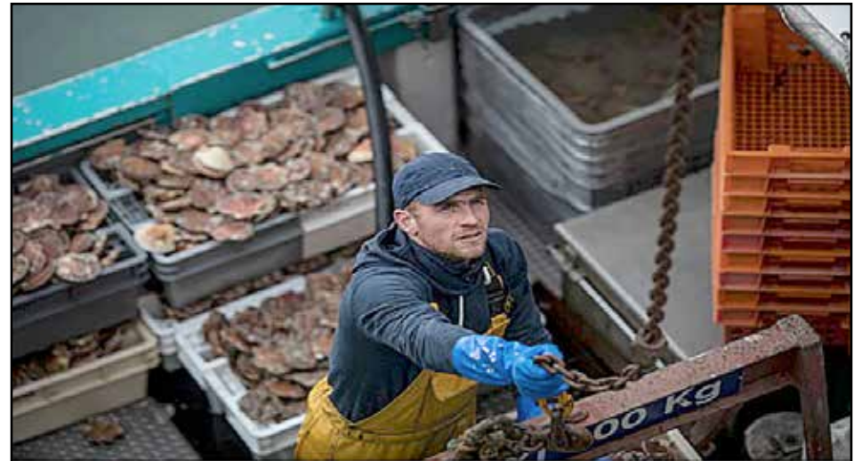
TROUBLED WATERS: "Things are clear and we have said that we won't let the British wipe their feet on the Brexit agreement," a French spokesman said

"What we see today is that 50 per cent of the