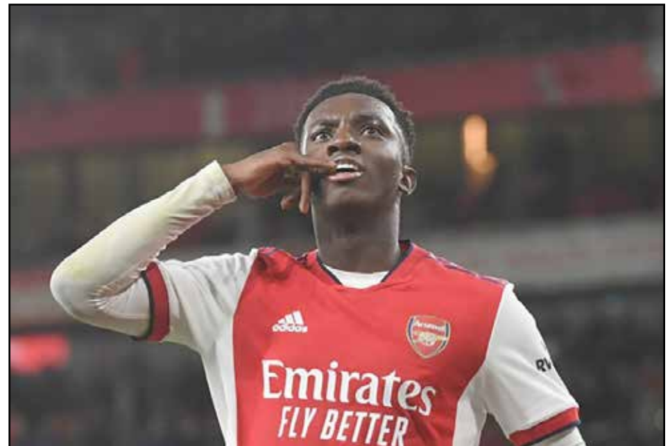
ARTETA ON NKETIAH "I regard him really highly and from my side I want him to stay."

"That contract situation is more and more common in football where we are coming from with Covid and a lot of the issues that we