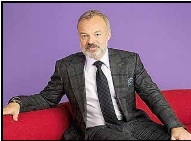
THAT'S RICH: chat show host Graham Norton

The money, for 'presenter fees', 'production fees' and 'royalties', is understood to include his pay from presenting The Graham Norton Show, as well as a large part of his earnings from his other BBC work. But the exact details of where the money has come from