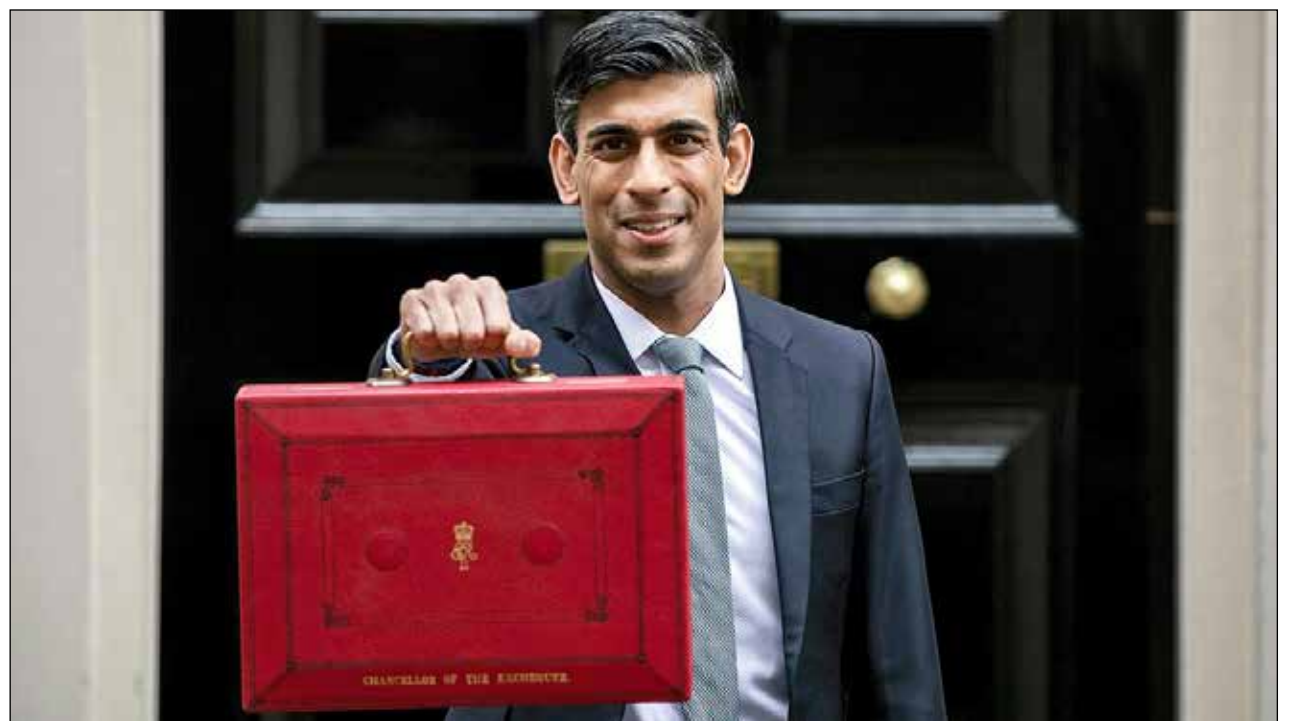
A BIT OF GIVE AND TAKE: Rishi Sunak strikes a familiar pose outside No. 11

In pre-budget announcements, the Treasury had already confirmed an increase to the national living wage to £9.50 an hour and the unfreezing of public sector pay.