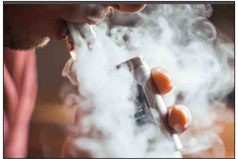
E-cigarettes are the most popular aid used by smokers trying to quit, but prescribing them on the NHS remains controversial

"Overall, it would seem easier to just recommend existing products which are well regulated by consumer protection regulations."