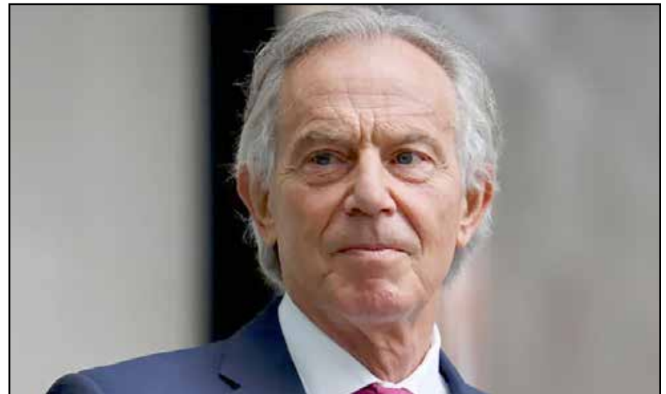
STILL CONTROVERSIAL: Tony Blair's knighthood has opened old wounds

Blair also faced criticism for sending troops into Afghanistan and Iraq, a decision which culminated in a devastating report by Sir John Chilcot in 2016 which found he overplayed evidence about Saddam Hussein's