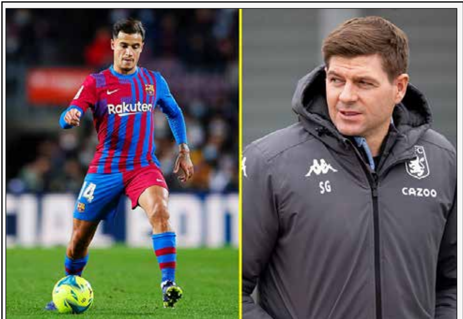
Coutinho and Gerrard: teammates at Liverpool in 2014

a kid who has given absolutely everything, he's had a huge impact on big matches and, you know, his defending, the grittiness of his defending is a key component."