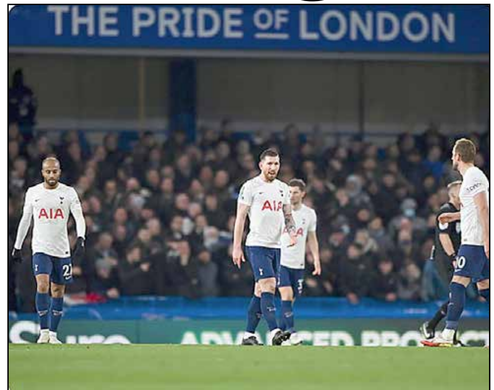
MIND THE GAP: Antonio Conte's men were lucky to lose by only a brace

He was involved on plenty of occasions, with