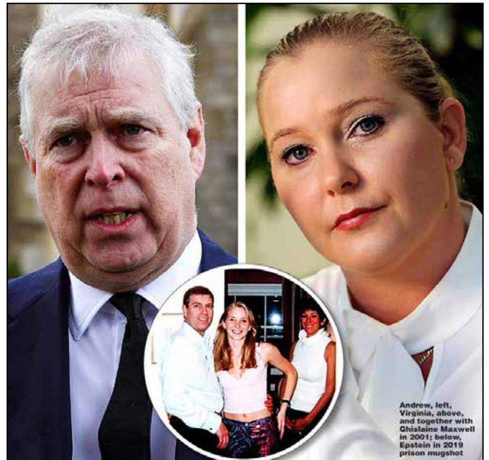
Andrew, left, Virginia, above, and together with Ghislaine Maxwell in 2001; below, Epstein in 2019 prison mugshot

The ninth in line to the throne vehemently denies the allegations and has insisted he has no recollection of ever meeting Ms Giuffre, a mother of three who was previously known as Virginia Roberts.