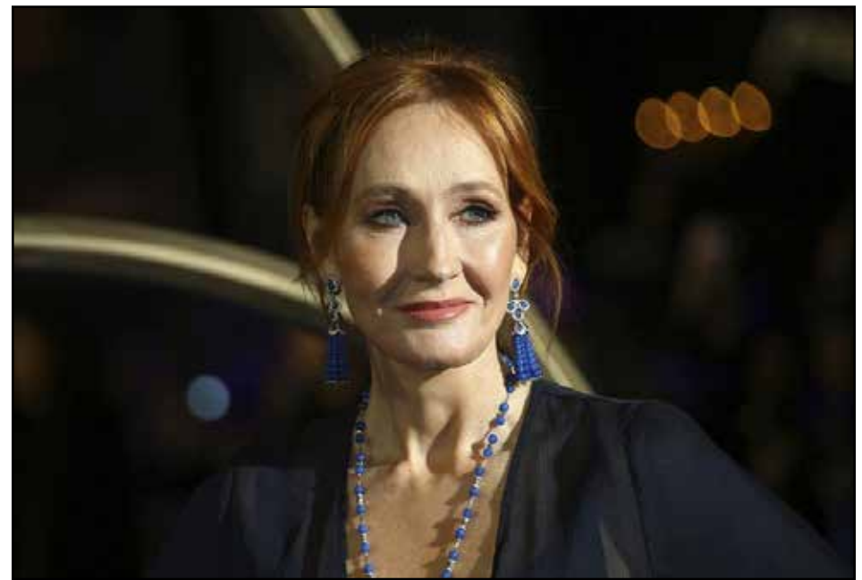
JK ROWLING: the row erupted after the Harry Potter author mocked an article that used the words "people who menstruate" instead of "women".

An email sent out by the school said: "Following numerous requests by students and staff we are reviewing the name of our red house 'Rowling' and in light of [her] comments and viewpoints surrounding trans people.