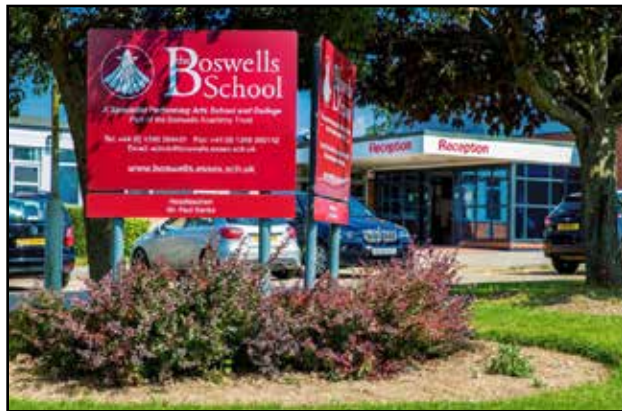
Boswells School: Censorship? Or taking a stand?

Olympian Dame Kelly Holmes will now replace Rowling as the house's inspirational British figurehead.