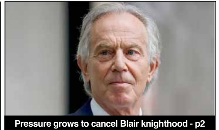
Pressure grows to cancel Blair knighthood - p2

California's British Accent™ - Since 1984