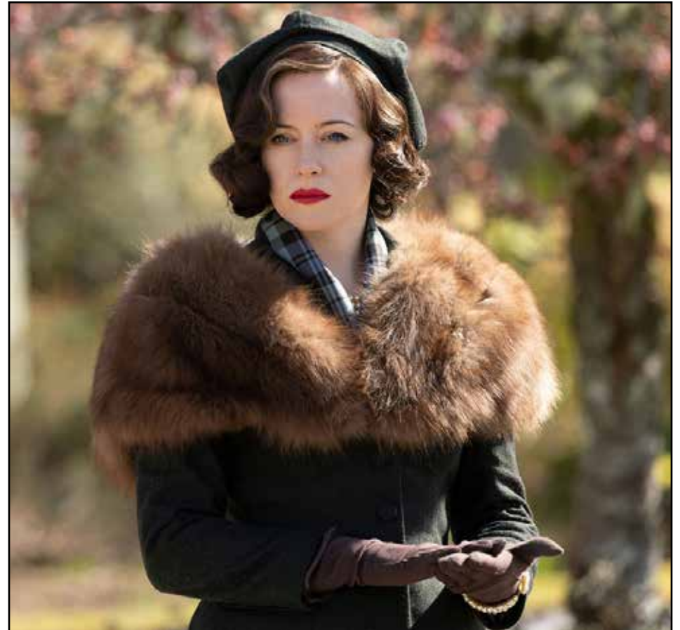
Claire Foy dazzled as the Duchess of Argyle on British TV at Christmas

Veteran journalist Andrew Neil was less impressed, tweeting: “Now seen all three