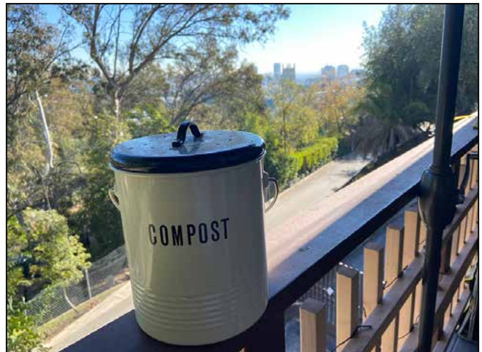
IN YOUR FUTURE: soon we will be required to start composting food waste

Amongst the proposed laws Governor Newsom vetoed was decriminalizing jaywalking - which means you can still get a ticket if you cross the street outside of a crosswalk - this currently costs the princely sum of $250 including administration fees, and if you are a cyclist it is still against the law to roll/yield at a stop sign - so if you happen to get a ticket for this mov-