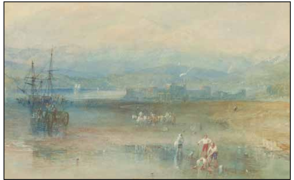
JMW Turner's Beaumaris Castle, Anglesey, will be on display

Organized chronologically, the exhibit will explore portraiture, historical subjects, landscape, still life, botanical illustration, and caricature. The works on view will represent a full range of styles, including quick pencil sketches that candidly reveal artists' creative processes, fluid pen-and-ink studies that approach the quality of finished works, and highly refined watercolor paintings.