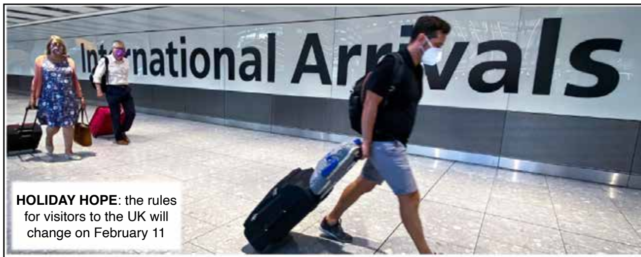
HOLIDAY HOPE: the rules for visitors to the UK will change on February 11