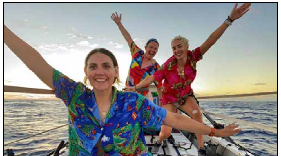
Aboard the Dolly Parton: the three ladies didn't just smash a record, they also had a lot of fun doing it...

And fun it was. Despite scorching heat, enormous night waves, sleep deprivation, blisters and sharks trailing their 25ft boat – called Dolly Parton – the trio made it seem a hoot. As they arrived, the