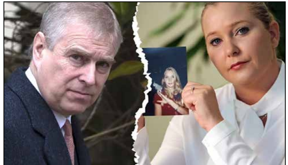
ONGOING DENIAL: The Prince is vigorously contesting Virginia Giuffre's claim of sexual abuse and rape when she was under 18.

The Duke of York's motion was filed after