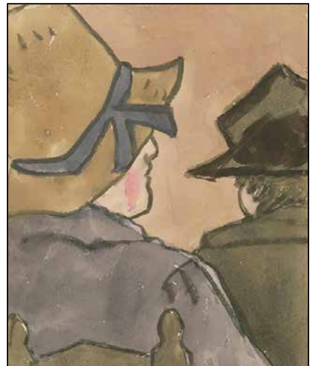
Gwen John's Two Hatted Women in Church

Turner, for example, method, described by an eyewitness as first that could withstand his cont. on page 9, col. 1