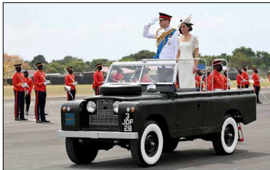
ECHOES OF EMPIRE? The Duke and Duchess rode in a Land Rover during their trip to Jamaica - the same vehicle used by the Queen in her visit to the Caribbean country decades earlier

The Duke said: “Catherine and I are committed to service. For