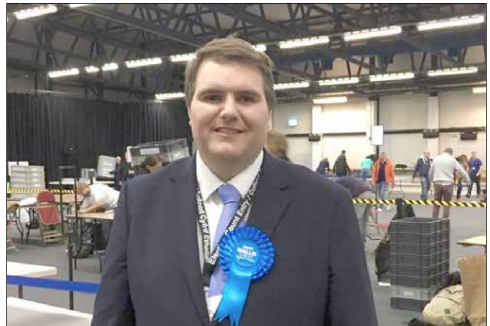
TRANS TORY: Jamie Wallis is the MP for Bridgend

secretary Wes Streeting said: “Sending you love and solidarity from the other side of the Commons.”