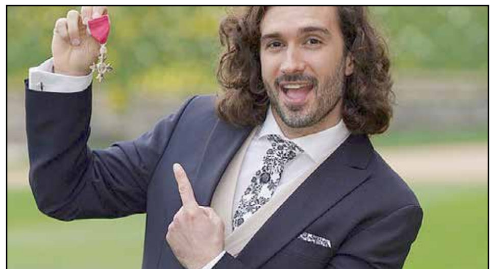
LOCKDOWN hero Joe Wicks this week shed his fitness gear for a day to collect an MBE.

But Tory Sir Roger Gale, said if the PM is fined then “there are serious questions” to be answered.”