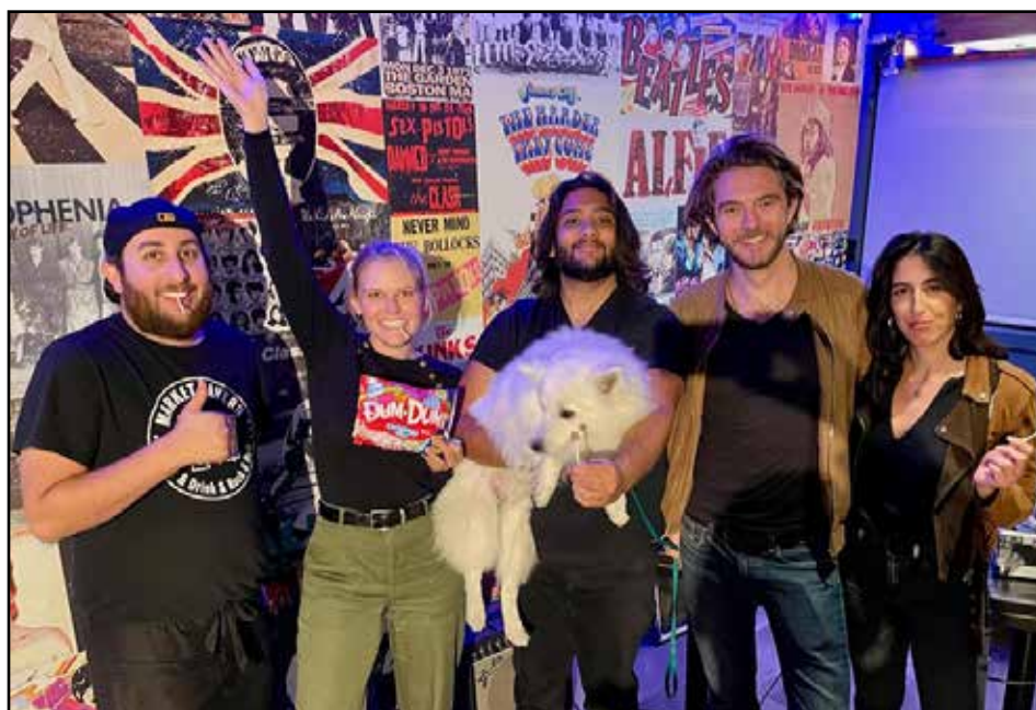
TOPICAL TEAM: the quintet Fresh Punch of Bel Air never threw in the towel