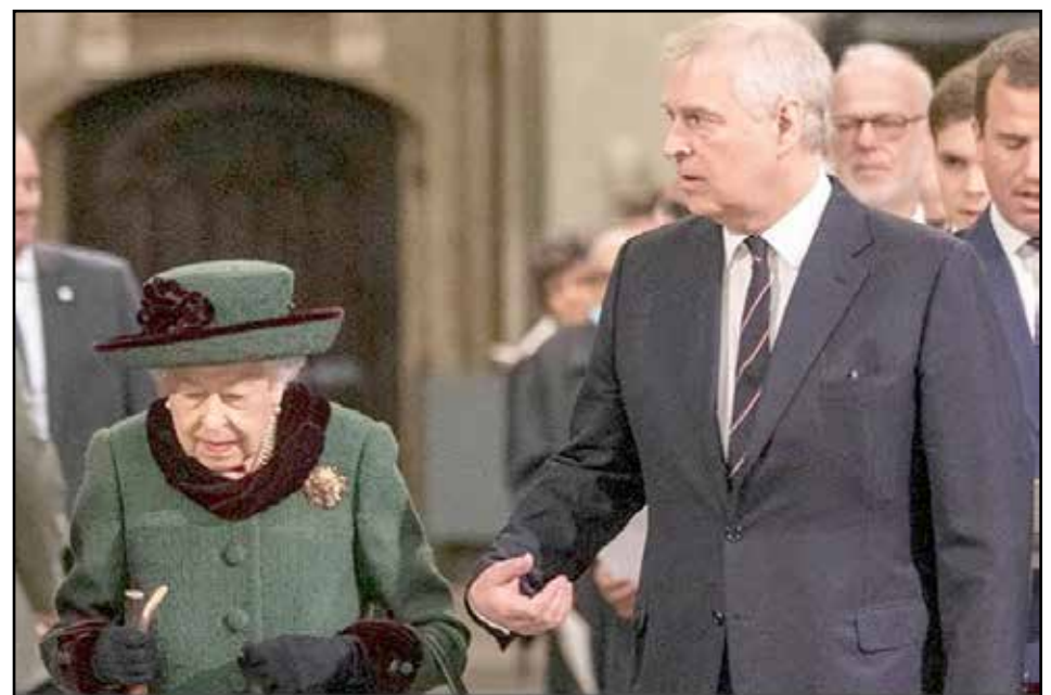
BAD COMPANY? The Queen and Andrew at Westminster Abbey

the scene as a slap in the face for the victims of sexual assault and sex trafficking.