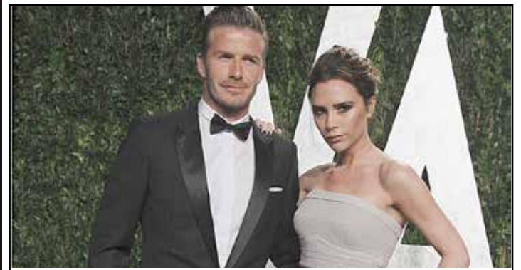
Beckhams' London mansion burgled - p4

California's British Accent™ - Since 1984