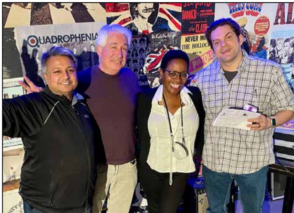
CAN YOU DETHRONE THEM?: current reigning champs, Foo Fighters: Help Wanted