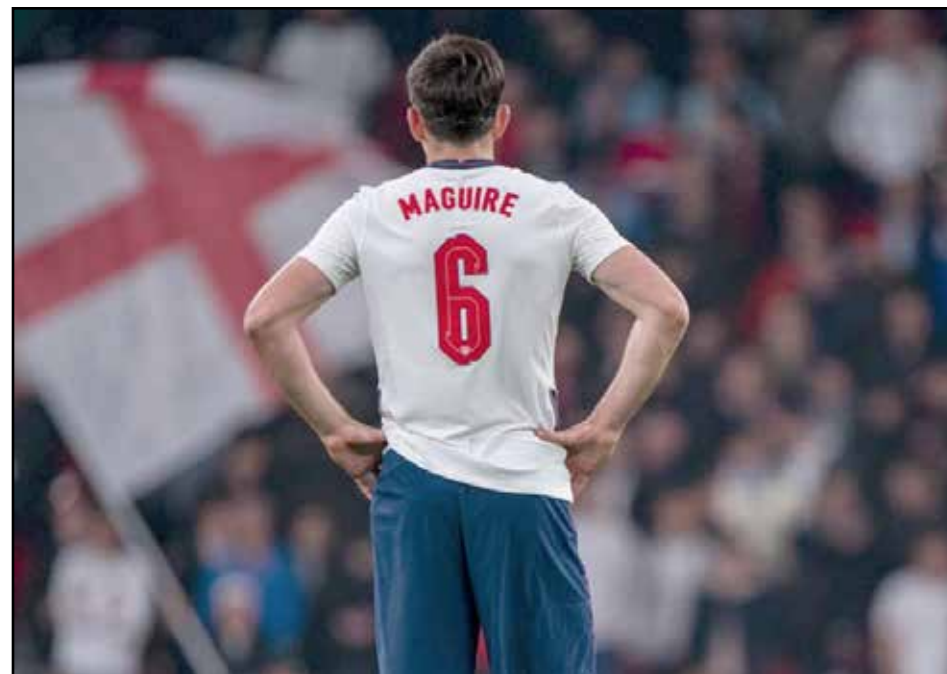
TOUGH SPELL: Manchester United's captain came in for a torrent of boos from the home fans ahead of Tuesday night's friendly against Ivory Coast

We are united as a team. We need a Harry Maguire playing well to have a chance of doing well because we are not going to win a World