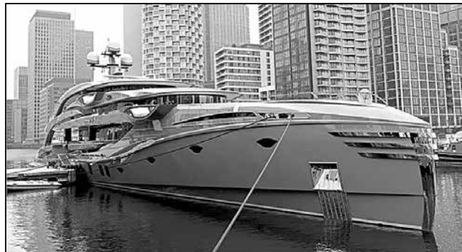
LIVING LARGE: The superyacht Phi was docked at London’s Canary Wharf when it was seized by the authorities on Wednesday

The superyacht – registered to a company based in the Caribbean