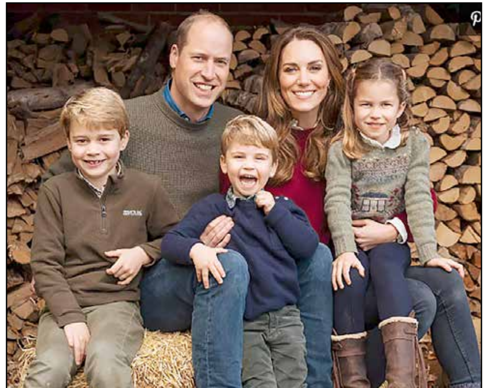
RISING STARS: George (left), Louis (center) and Charlotte (right) are likely to take center stage in what has been called a "royal show of force".

Traditionally, the Queen heads the procession, inspecting her Household Division at Horse Guards Parade before leading them