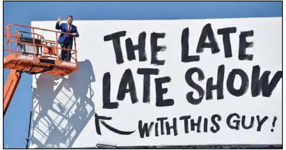
MR HOLLYWOOD: Corden has hosted the CBS talk show since 2015

"These are very difficult jobs to leave, because you work with incredible people and you do something that's really amazing every day."