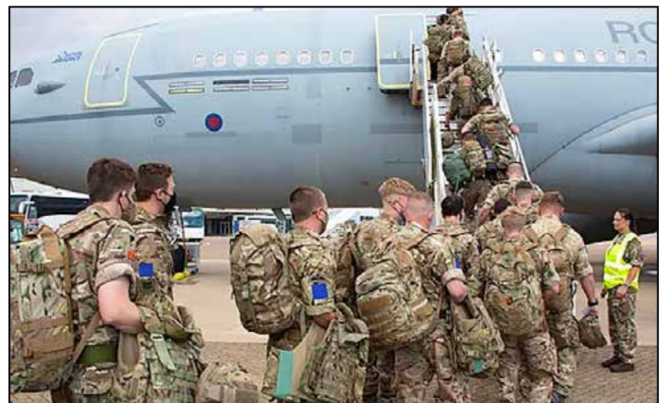
UK military personnel boarding an RAF Voyager at Brize Norton this week