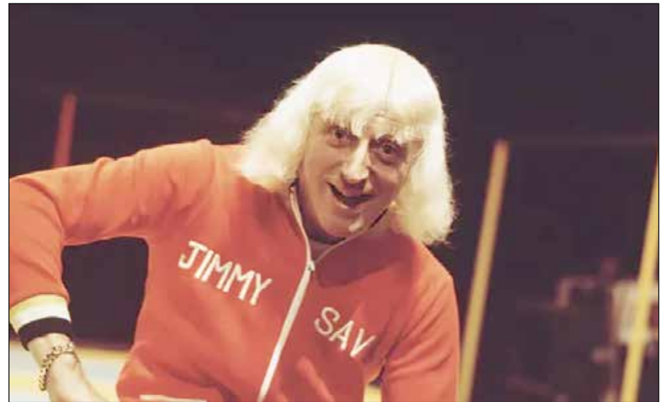
Savile: hundreds of victims came forward after the entertainer's death in 2011

Instead, the Sun published a carefully worded article about child abuse at the Jersey care home, along with a picture of Savile on the premises – while repeatedly emphasizing