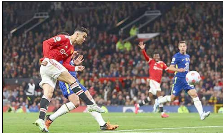
It's that man again: Ronaldo fires home at Old Trafford Thursday night

The best of those were by Havertz, who broke clear midway through the first half only to be