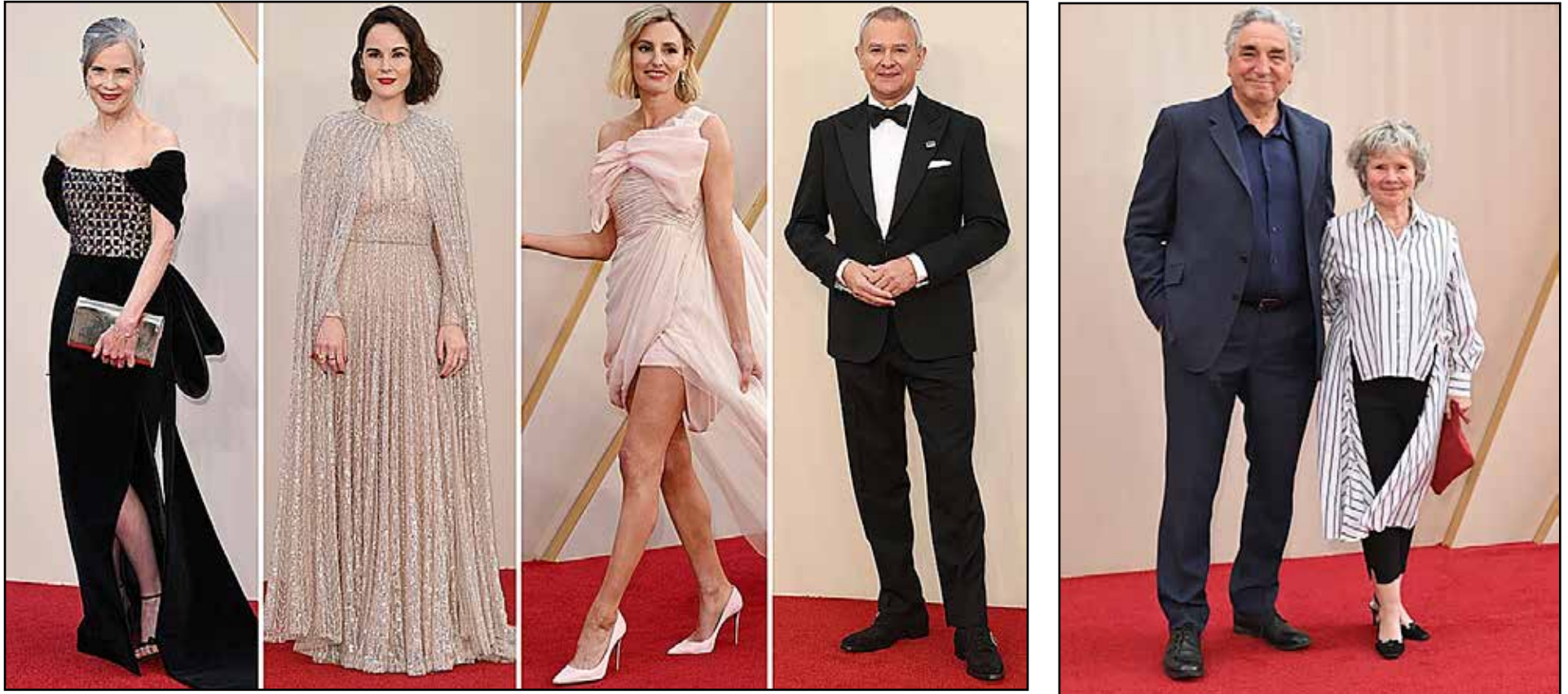
STARS IN ALIGNMENT: (from left) Elizabeth McGovern, Michelle Dockery, Laura Carmichael, Hugh Bonneville, Jim Carter and Imelda Staunton all shone brightly on the red carpet in London's Leicester Square this week at the glamorous premiere of Downton Abbey: A New Era

LAURA Carmichael, Elizabeth McGovern and Michelle Dockery brought some distinctly upstairs glamour to the premiere of the new Downton Abbey film at the weekend.