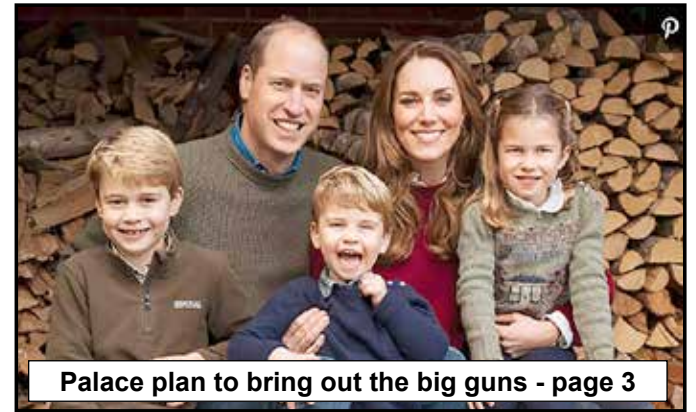
Palace plan to bring out the big guns - page 3

California's British Accent™ - Since 1984