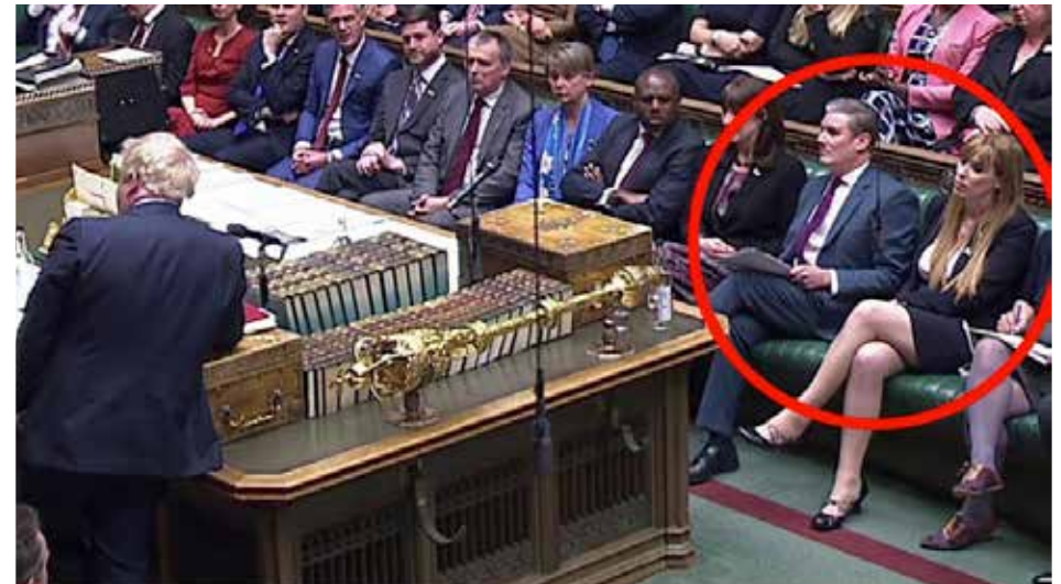
The article claimed Angela Rayner was trying to 'distract' Boris Johnson by crossing and uncrossing her legs in the Chamber

In a series of tweets on Monday, the Ashton-under-Lyne MP said: "Boris Johnson's cheerleaders have resorted to spreading desperate, perverted smears in their doomed attempts to save his skin. They know exactly what they are doing." She said