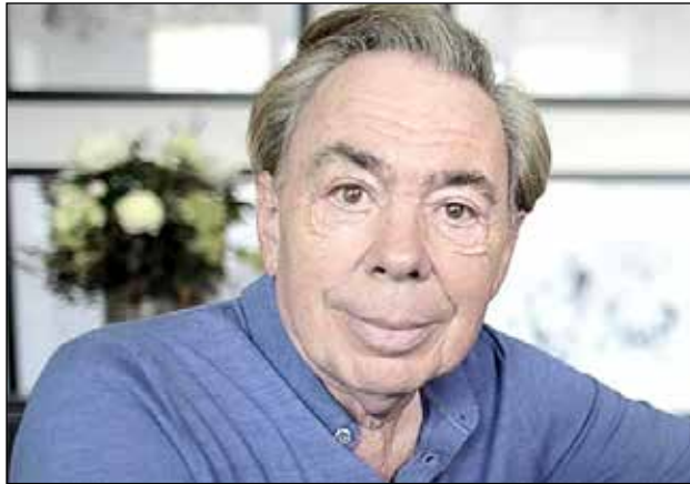
LLOYD WEBBER: still optimistic