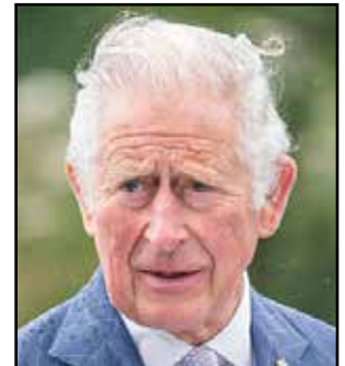
Past his sell-by date? Many Britons think William is a better choice than his father