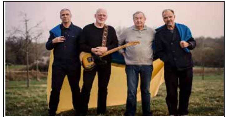
Pink Floyd reunite for Ukraine - sort of - page 3