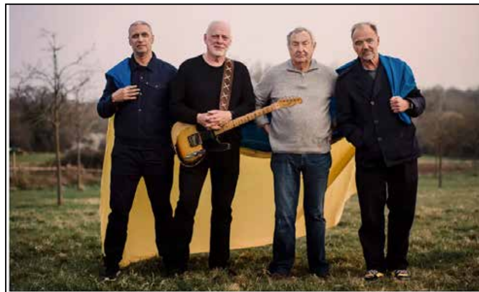
ROCK OF AGES: David Gilmour and Nick Mason, flanked by Nitin Sawhney and Guy Pratt, collaborated on Hey Hey, Rise Up!