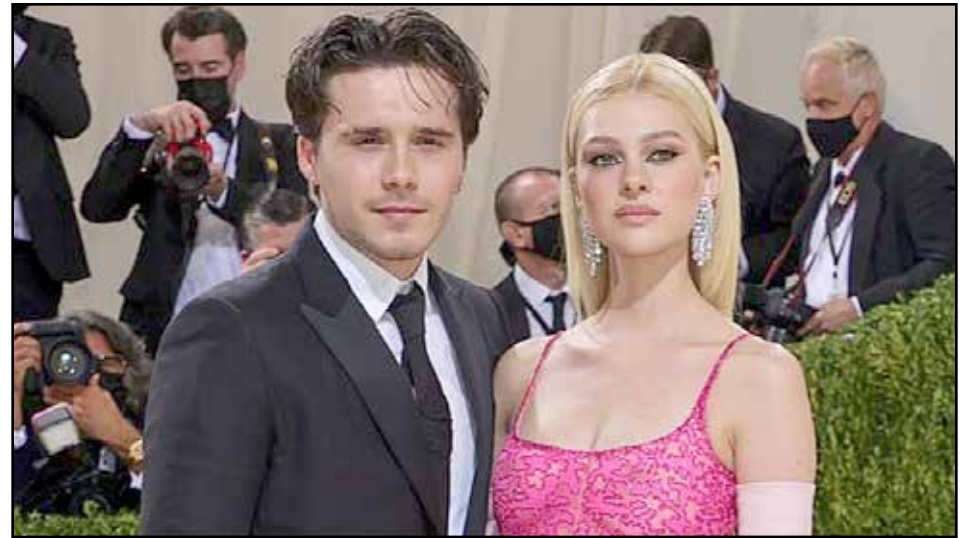
LOVE'S YOUNG DREAM? Brooklyn Beckham and Nicola Peltz at a 2021 Met Gala in New York

parents, David and Victoria, is dwarfed by the estimated £1.3 billion wealth of Miss Peltz's financier father Nelson.