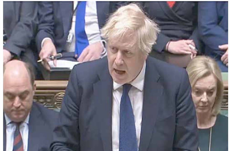
Johnson: "immensely sympathetic to people who want to change gender..."

"And I also happen to think that women should have spaces which are, whether it's in hospitals or prisons or changing rooms or wherever, which are dedicated to women.