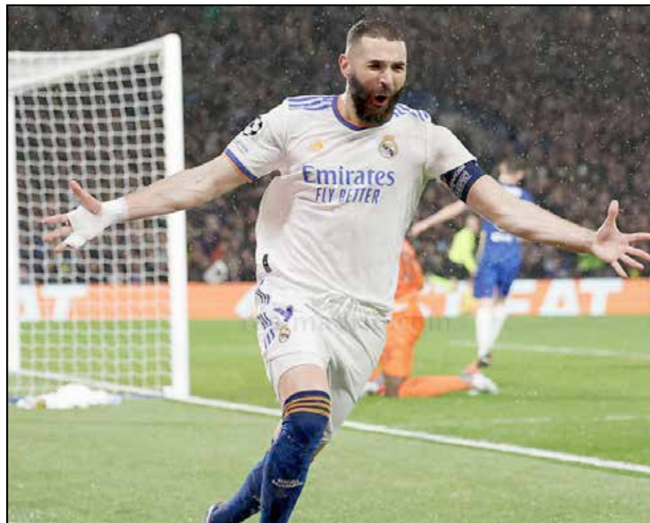
BIG BEN STRIKES: Karim Benzema's superb show on Wednesday night underlined his late career resurgence