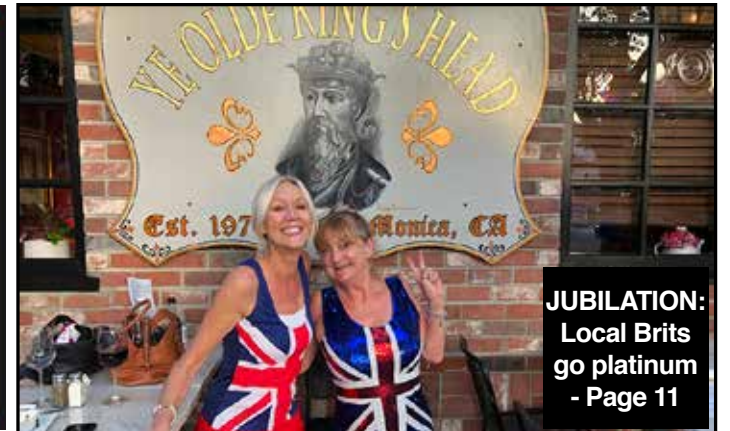
JUBILATION: Local Brits go platinum - Page 11

California's British Accent™ - Since 1984