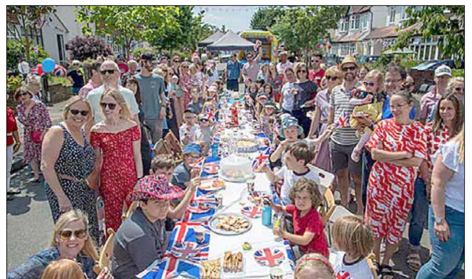
BECKENHAM: thousands enjoyed the sun in South London on Sunday

Clipstone Avenue in Newcastle was packed with revellers who