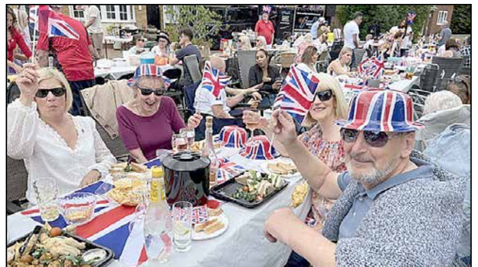
STEVENAGE: Hertfordshire residents enjoy the four day bank holiday