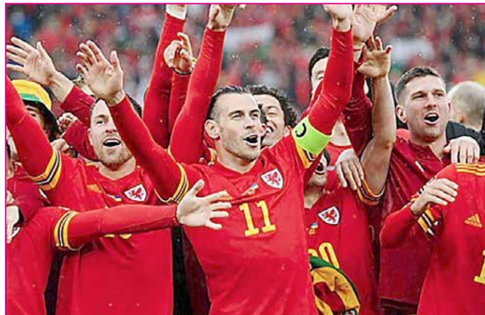
LAND OF MY FATHERS: There were delirious scenes after the final whistle at the Cardiff City Stadium