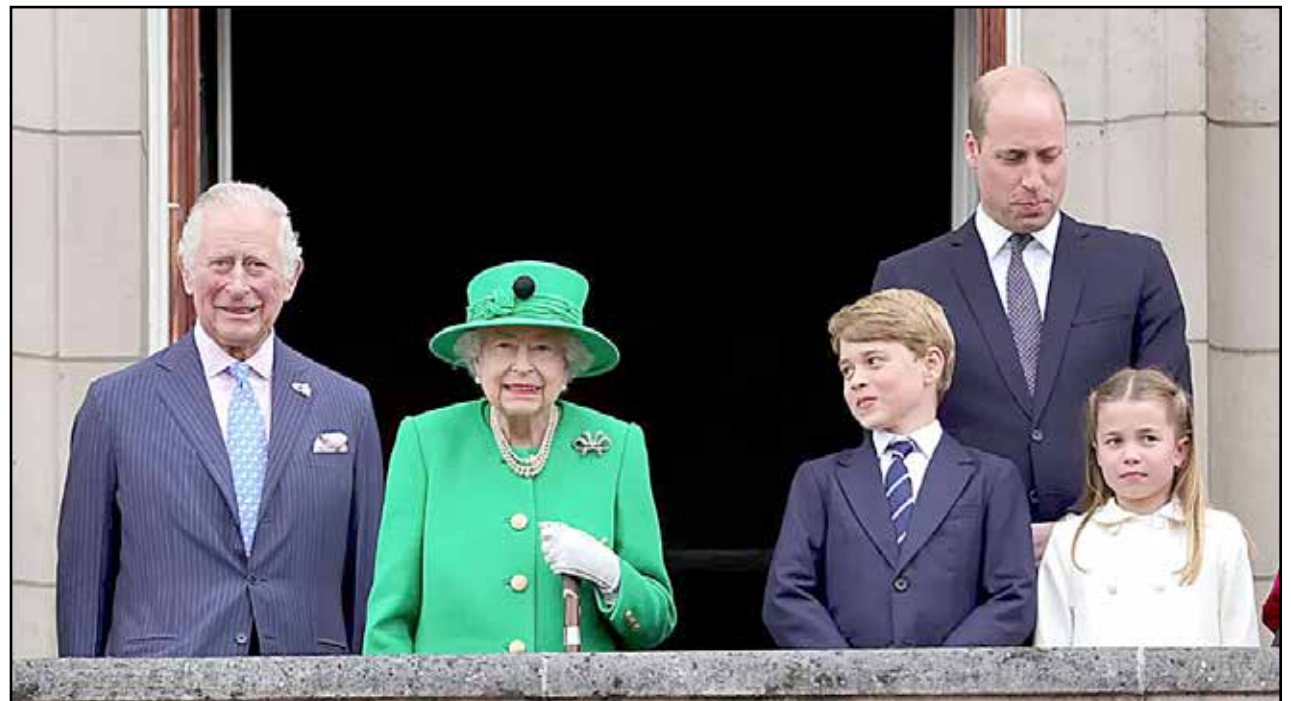
GRAND FINALE: Her Majesty delighted the crowd by appearing on the balcony of Buckingham Palace on Sunday night, with Prince Charles, Prince George, Princess Charlotte and the Duke of Cambridge

Sunday marked her third public appearance