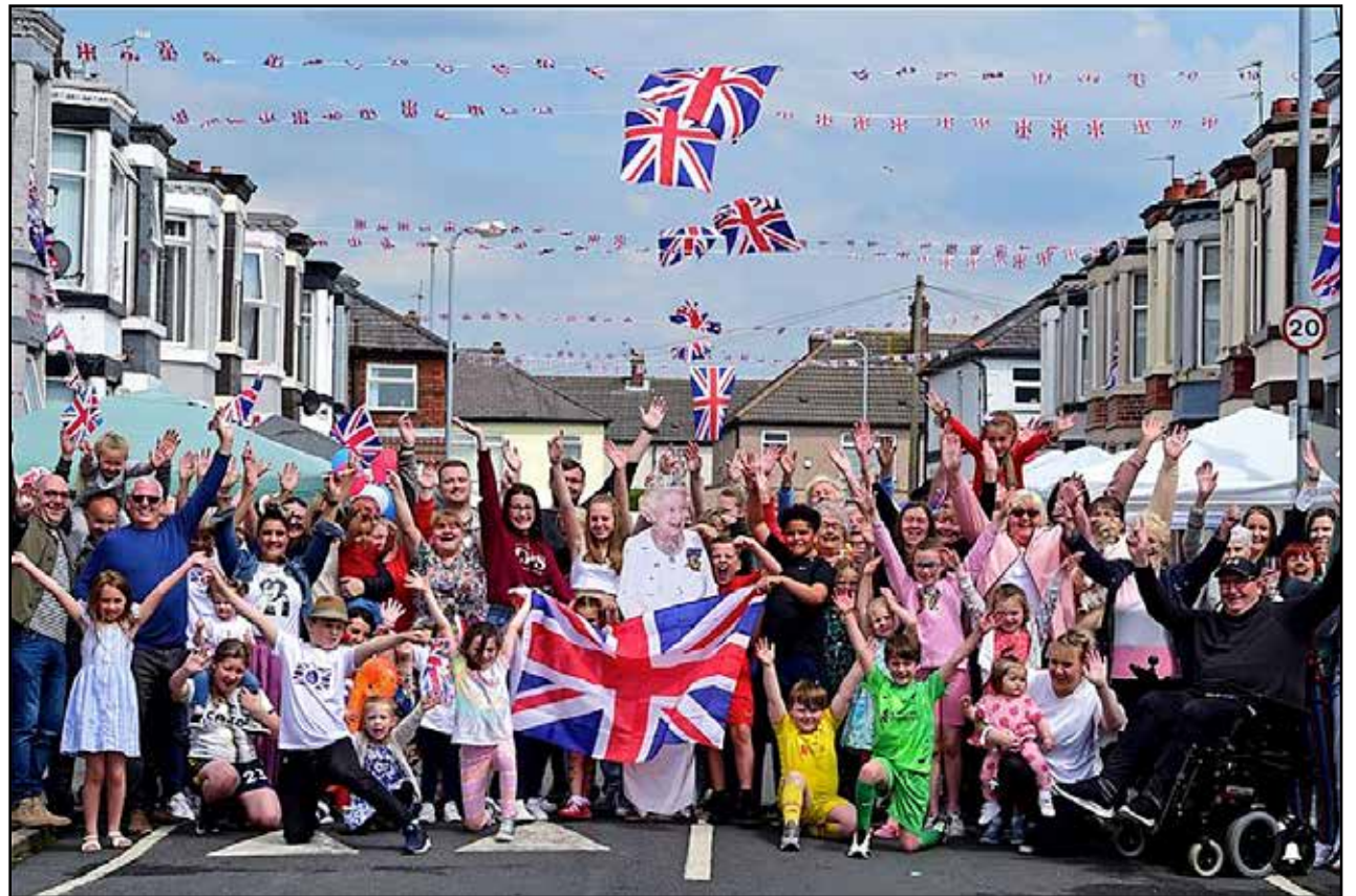
SCOUSE PARTY: locals fly the flag at a street party in Bootle