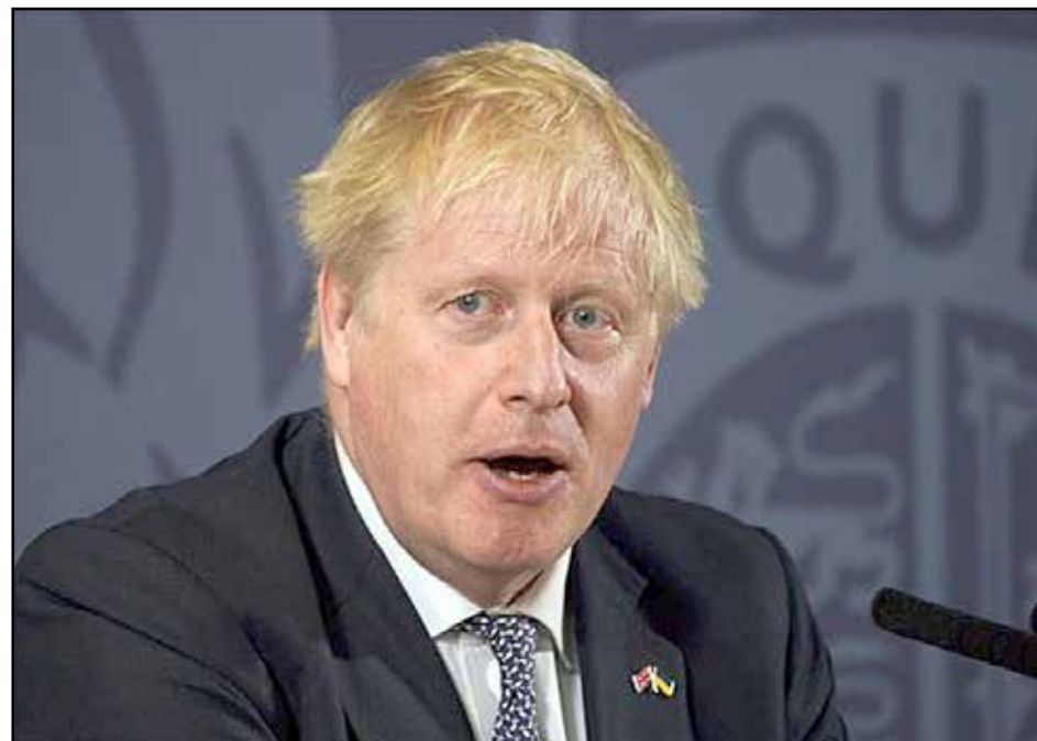
THE INCREDIBLE SHRINKING PM: Johnson is fronting it out - for now

cent. Now’s the time to get on with the job.”