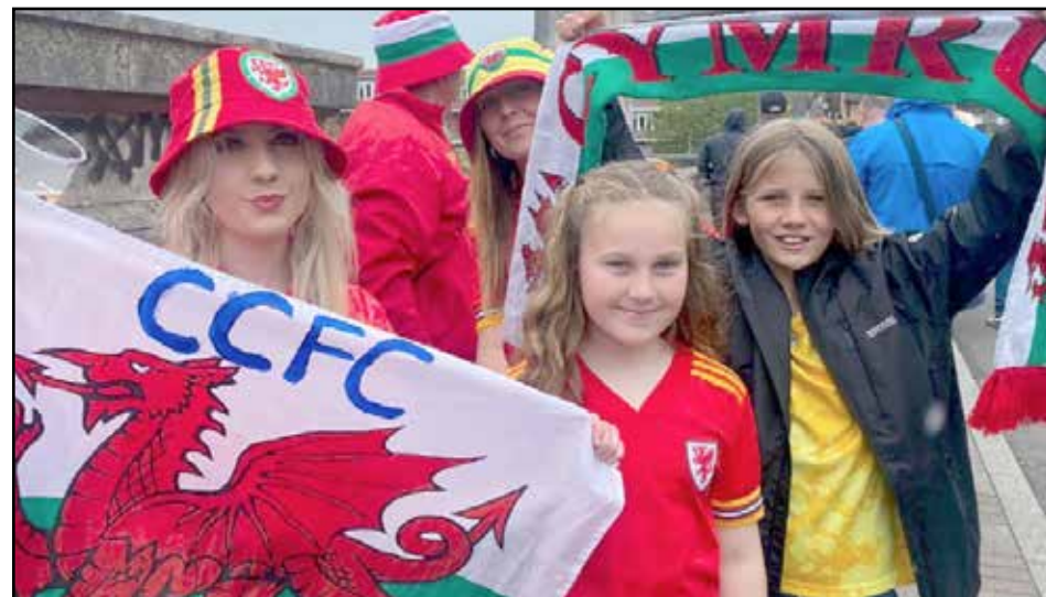
DREAMERS: young fans enjoying the moment outside the stadium

from his restaurant welcome" to Qatar. going to have the time and "everybody is so "The Wales fans are of their life," he added.