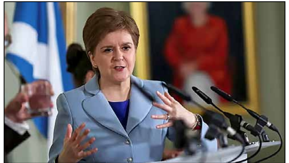
NO SCEXIT? Ms Sturgeon has pledged to hold a referendum in 2023 but so far the UK Government has refused to co-operate.

“Nicola Sturgeon should give it a rest and focus on the people of