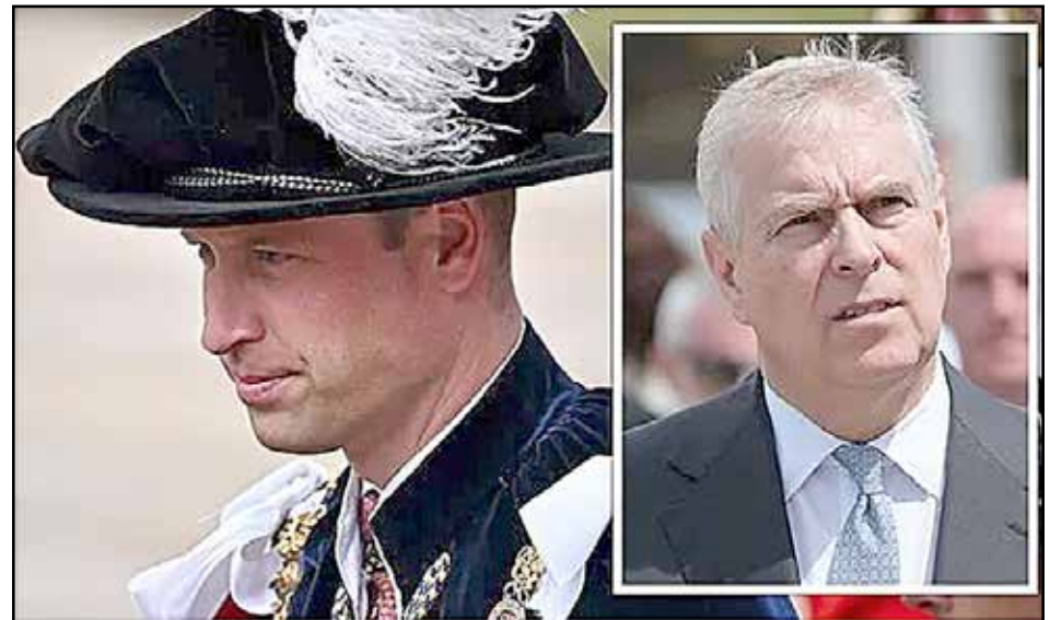
A HOUSE DIVIDED: reports claimed Prince William threatened to quit Sunday's Garter ceremony if Andrew were included

editor of Majesty Magazine, said: "Clearly it was the intention he would be there. Interesting that the family should need to intervene on something like this. This is very much a damage limitation exercise."