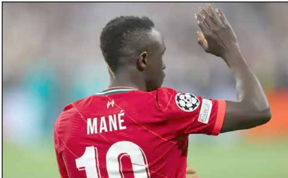
GOOD INNINGS: Mané has been with the club since 2016

Mané told Liverpool of his desire to leave soon after the Champions League final and made Bayern his preferred destination. Bids from the German club were turned down before a deal was reached on Friday. Bayern's sporting director, Hasan Salihamidzic, confirmed the move to Sky Sports in Germany on Friday evening. "Yes, Sadio is