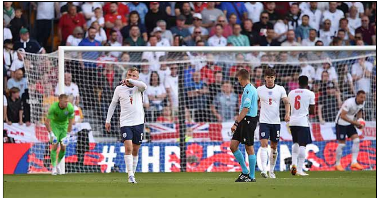
That sinking feeling: England has no answer to the rampant Hungarians on Wednesday

Hungary - who top a group that also includes Germany and Italy - were well organized and clinical to earn only their second win over the Three Lions on English soil and first