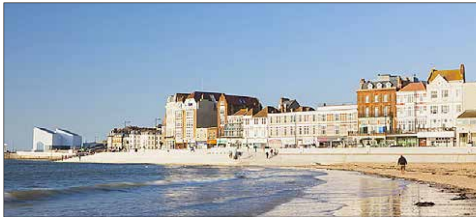
IT ROCKS: the average home in the Kent seaside town costs £286,716

Homeowners in Dover can enjoy stunning views of the Channel, Dover Castle and the famous white cliffs. Portmeirion, in Gwynedd, Wales, came in third place with homes costing £172,875 on average – attractive if you can work from home.