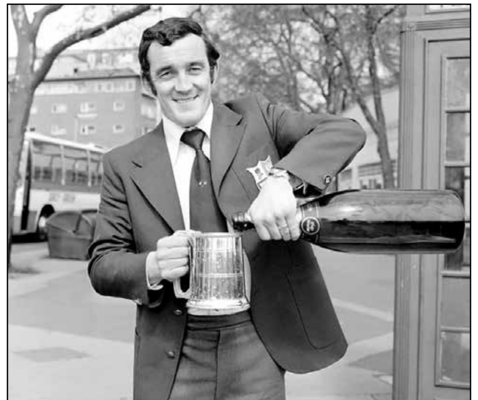
WALES LEGEND: Phil Bennett, pictured in 1977

games and scored 2,444 points over 15 seasons for the Scarlets. The fly-