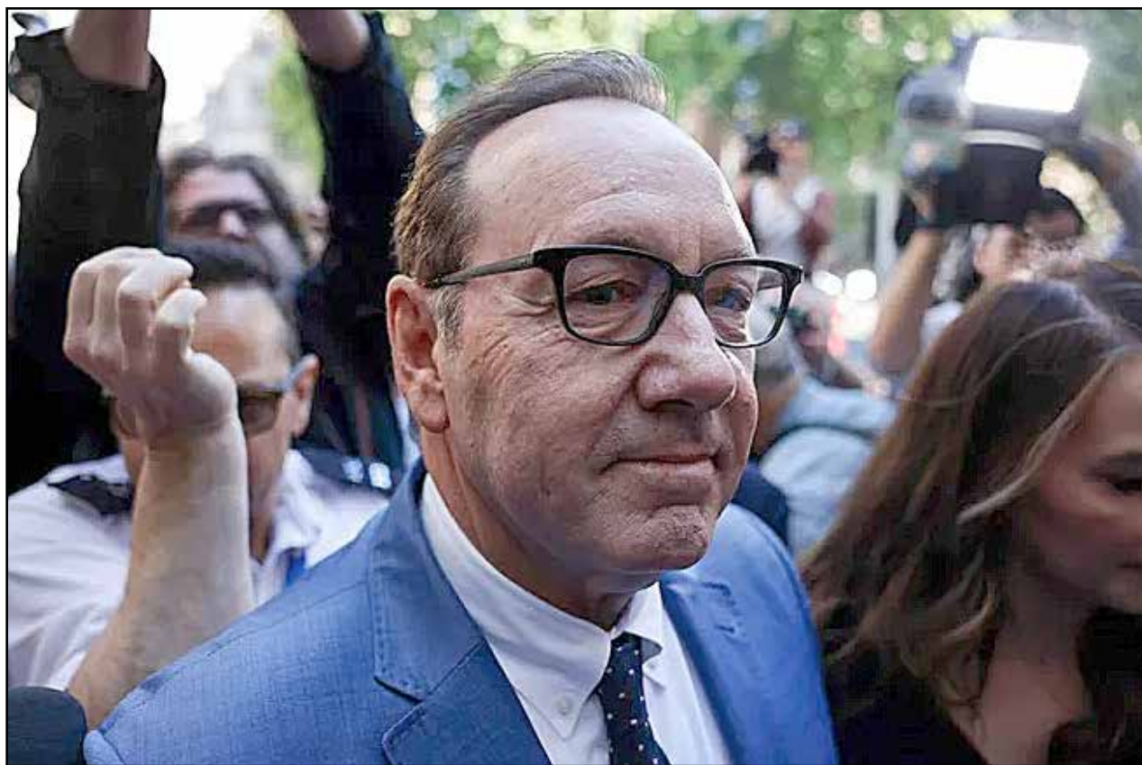
Spacey was artistic director of London's Old Vic theatre from 2005 to 2013

He had earlier stood in the dock to confirm his full name, the address of his London flat and his