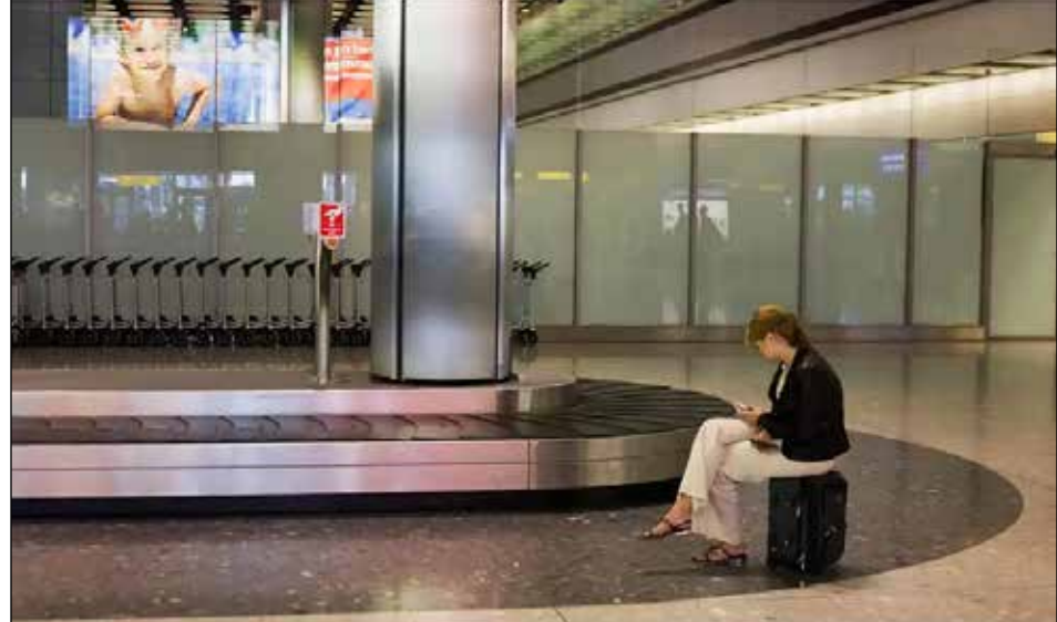
THE WAIT GOES ON: a lone traveler at Heathrow waits for her luggage

His pay package prompted a sizeable shareholder revolt last week, with more than a quarter of investors failing to back it. IAG faced down a rebellion at its annual meeting in Madrid where 17.8% investors voted of against the controversial pay policy, and 7.8% abstained. Investment advisers Glass Lewis and ISS described the pay