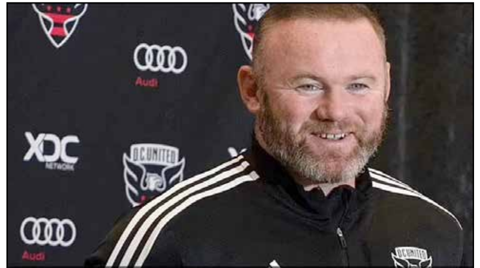
ROONEY: "The team need to improve, I think that's obvious for everyone to see."

"The team need to improve, I think that's obvious for everyone to see, and I really think with my capabilities of developing young players - of course we're working hard to get a few new players in - we can really get this club to successful ways again.