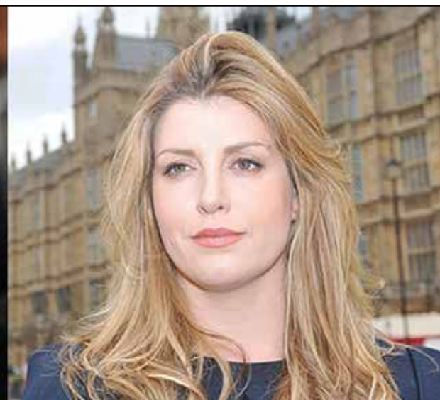
Rishi Sunak and Penny Mordaunt were set to join the three other candidates in a debate on Friday