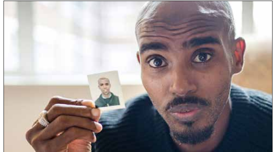
Sir Mo said he arrived under a false name after escaping war in Somalia