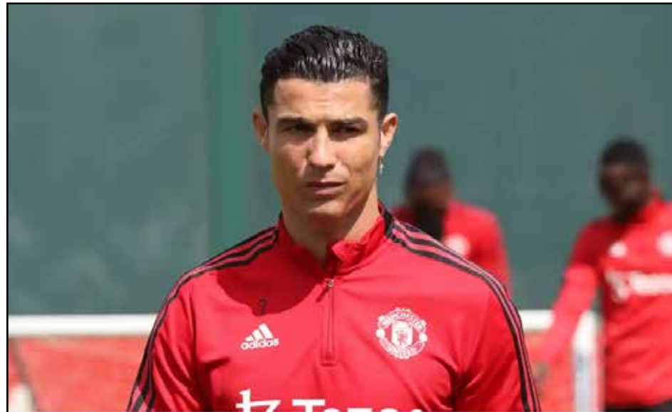
RONALDO: THE Portuguese forward has not joined United on pre-season tour

Ronaldo has also been offered to Bayern Munich, Napoli and Paris Saint-Germain, although the German champions have said they will not