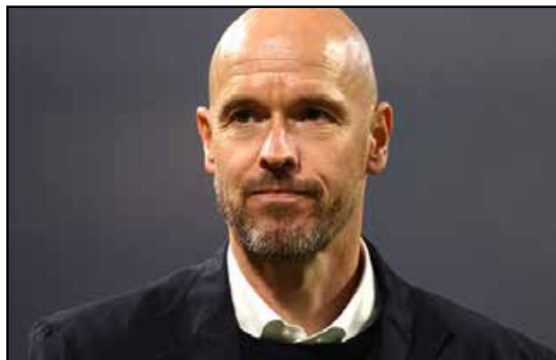
TEN HAG: "I have seen some really good things"

It has been an awful few months for United and they are not clear of trouble by any means