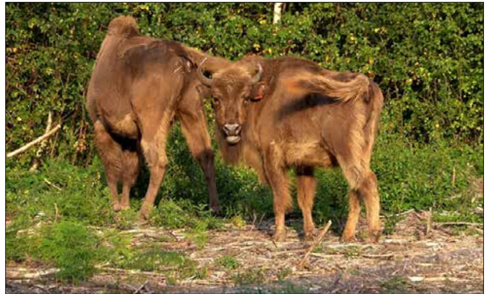
BACK TO THE FUTURE: The bison all come from wildlife parks in Scotland and Ireland

The WWF also alleges: "Despite nature struggling against all odds to survive, more