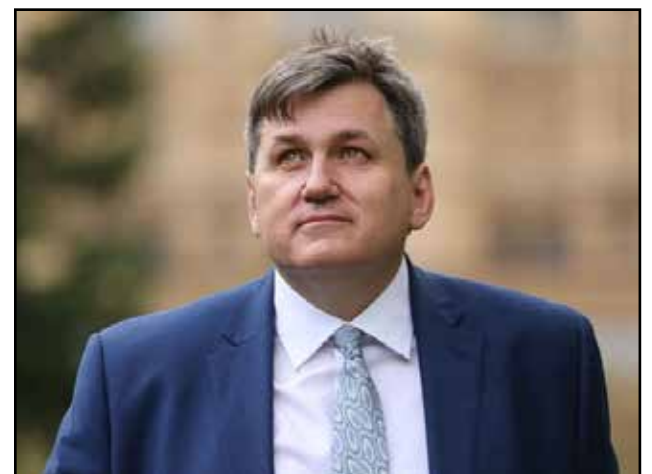
MALTHOUSE: promised a 'new national resilience strategy' for Britain to help deal with the new reality

Sadiq Khan, said the London fire brigade received more than 2,600 calls on Tuesday – seven times the usual volume.