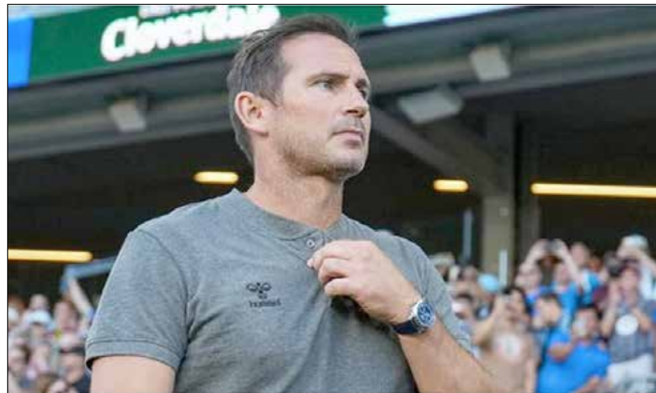
NOT MUCH JOY: Everton lost 4-0 to Minnesota United this week

a void in forward areas”, while “through the team, there are things that I want to strengthen”.