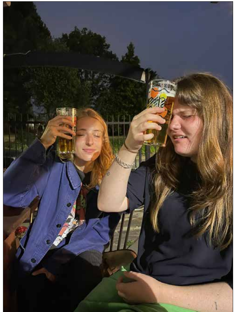
WHEN IN DOUBT: a cold pint down the pub is always welcome

As I'm sure some may remember, our heat is a different type of heat. I went for a swim at my local pool which is only a five minute cycle from my house and during that time I managed to get sunburnt. Most public spaces don't have air con, our homes are literally built to keep the