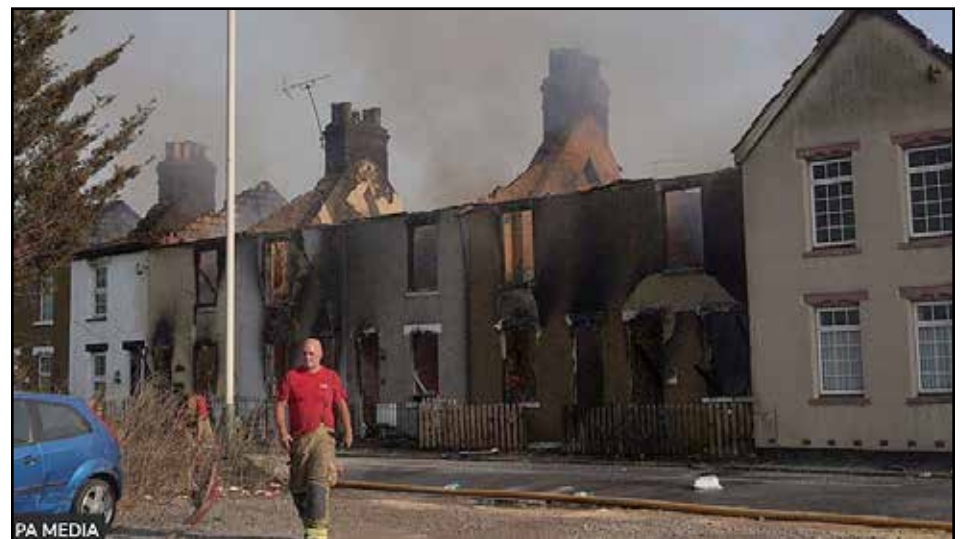
Firefighters battled an outbreak of wildfires around Wennington, on London's eastern outskirts, on what was described as their busiest day since World War

A large swathe of eastern England, from Surrey to South Yorkshire, saw temperatures between