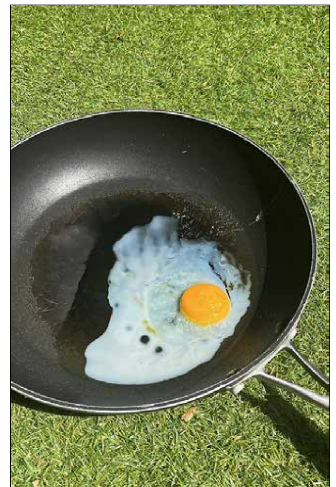
Yes, you literally could fry an egg in the garden this week

There's not been much else to do other than complain and sweat, I have spent my time inside in front of a fan eating ice lollies. Once the sun goes down it's a sprint to the pub to rehydrate with a crisp cold pint. Most pub-goers suffering from sweaty foreheads and a bright red complexion, myself included. I think we are coming out of the extreme temperatures now but let's see. You never know with Britain. I say at this point bring on the rain, I really do miss it!