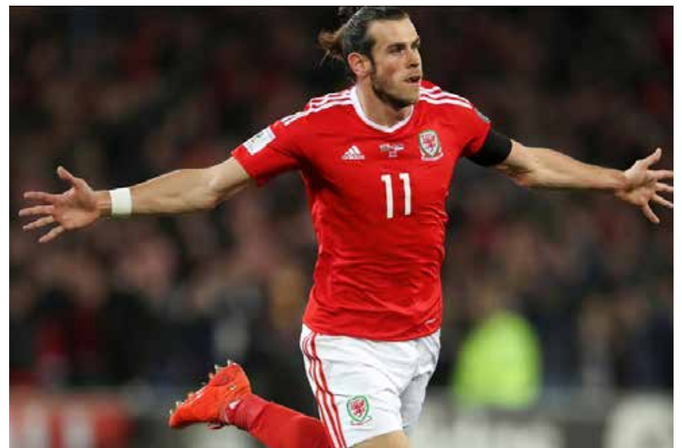
PLENTY MORE TIME FOR GOLF THEN...Bale’s hanging up his boots

Wales’ most-capped men’s player with 111 appearances and top goalscorer with 41 goals, Bale retires with a truly