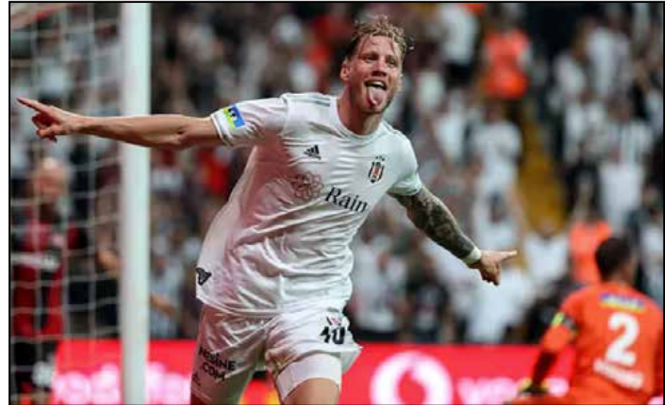
BIG MAN UP FRONT: Weghorst made a name for himself at the World Cup

ACP program details can be found at www.fcc.gov/affordable-connectivity-program-consumer-faq