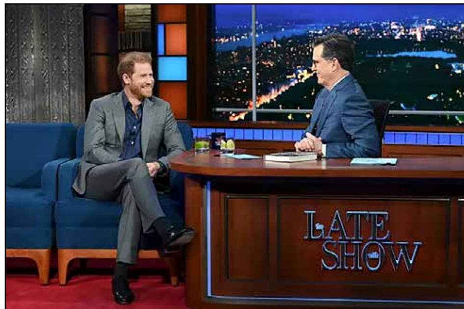
BOOKS, BOOZE AND BANTER: Prince Harry with Stephen Colbert this week

"He's keeping quiet for the good of his family and the country. He's handling