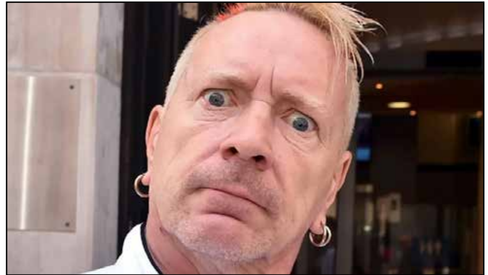
Lydon: turning sentimental (sort of) in his old age?