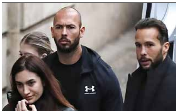
Andrew Tate: the online influencer (center) was held as part of an investigation into human trafficking

But in a document explaining the judge's reason to continue to hold the brothers, it said "the possibility of them