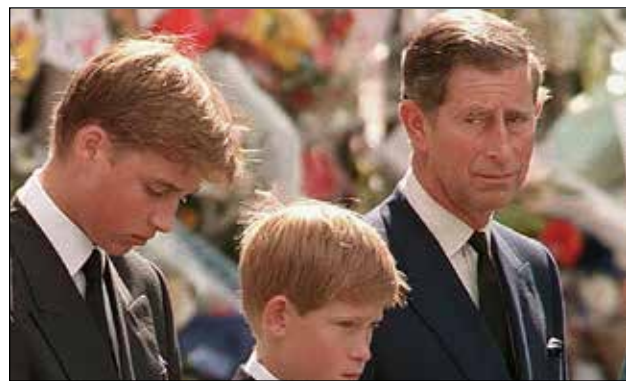
“Pa was never made for that. To be fair, he tried.”