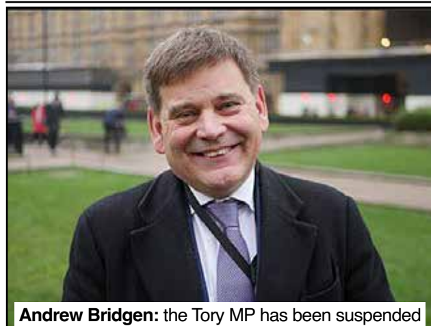
Andrew Bridgen: the Tory MP has been suspended