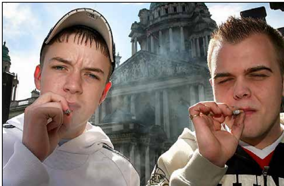
Up in Smoke: cigarette usage costs the NHS an estimated £2.4bn annually

"I'm curious to know where the voters are on this, where the country is and what appetite exists for change." New Zealand will impose a steadily rising smoking age to prevent tobacco