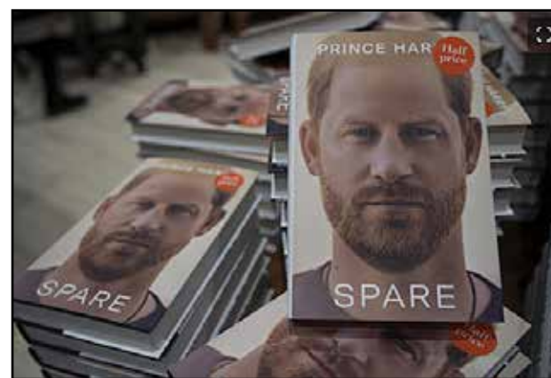
SELLING LIKE HOTCAKES: Harry's memoir

Harry also called on the monarchy to modernise, "especially because of their role in