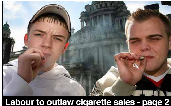
Labour to outlaw cigarette sales - page 2