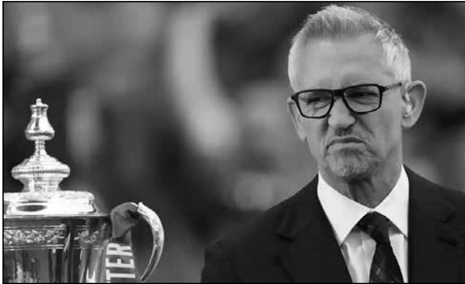
LINEKER: the Match of the Day presenter vowed to “continue to try to speak up for those poor souls that have no voice.”