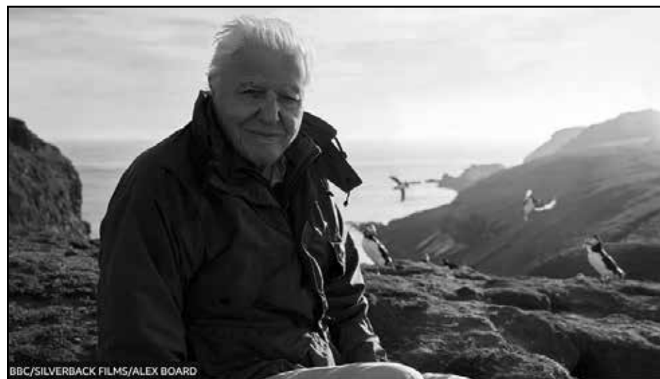
WILD ISLES: The BBC series, presented by Sir David Attenborough, will see new behavior filmed around the UK

Sir David had to be kept away from fledging chicks during filming due to fears that an outbreak of avian flu could be fatal. One segment called for