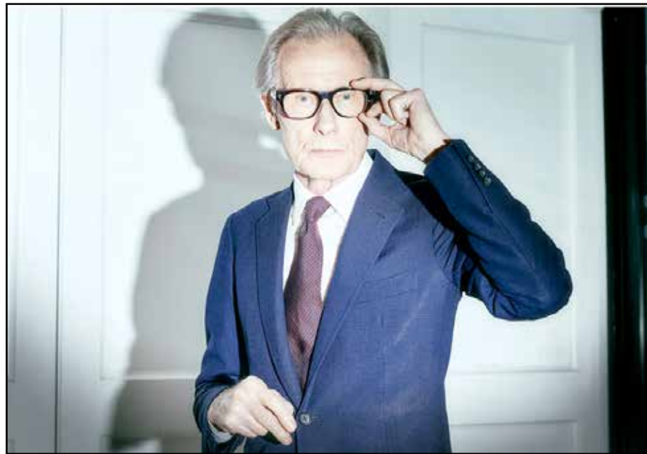
THE END IS NIGHY: The much-loved British actor gives the performance of his career as a terminally ill bureaucrat in Living.

table interviews with one's rivals that are part of any Oscar campaign. There is a thrill in that.