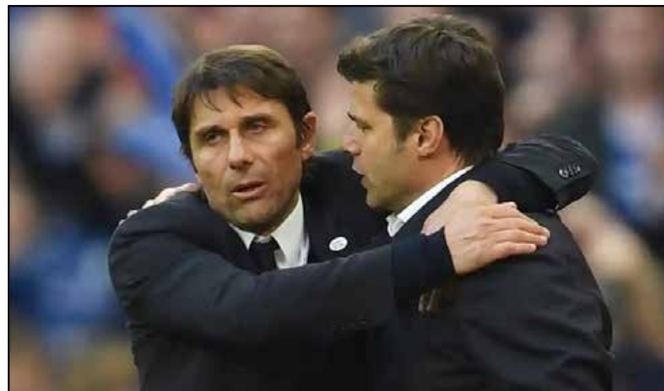
PAST, PRESENT AND FUTURE? Conte and Pochettino pictured after a Chelsea-Spurs Premier League game in 2017

Conte, out of contract in June, has endured a traumatic season, undermined by bereavements and health problems and – with the team struggling – it has come to feel that a separation would be in everyone's best interests. The Italian has certainly made few friends at the club in recent months, with both with his refusal to discuss a new contract