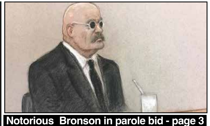
Notorious Bronson in parole bid - page 3