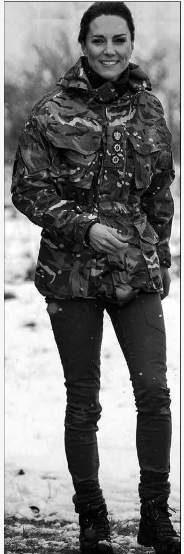
Kate is a Colonel of the Irish Guards