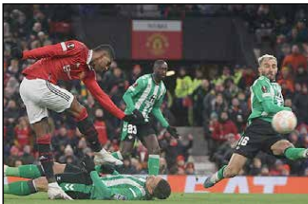
Marcus Rashford's hot streak continued on Thursday

It included his eighth goal of the season as he headed home Luke Shaw's 58th-minute