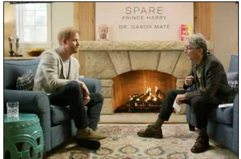
ANOTHER WEEK, ANOTHER TELL-ALL: Harry with Gabor Maté this week

Tensions had been high after the couple aired their grievances in a TV interview with Oprah Winfrey and a Netflix series, before Harry published his bombshell memoir, in which