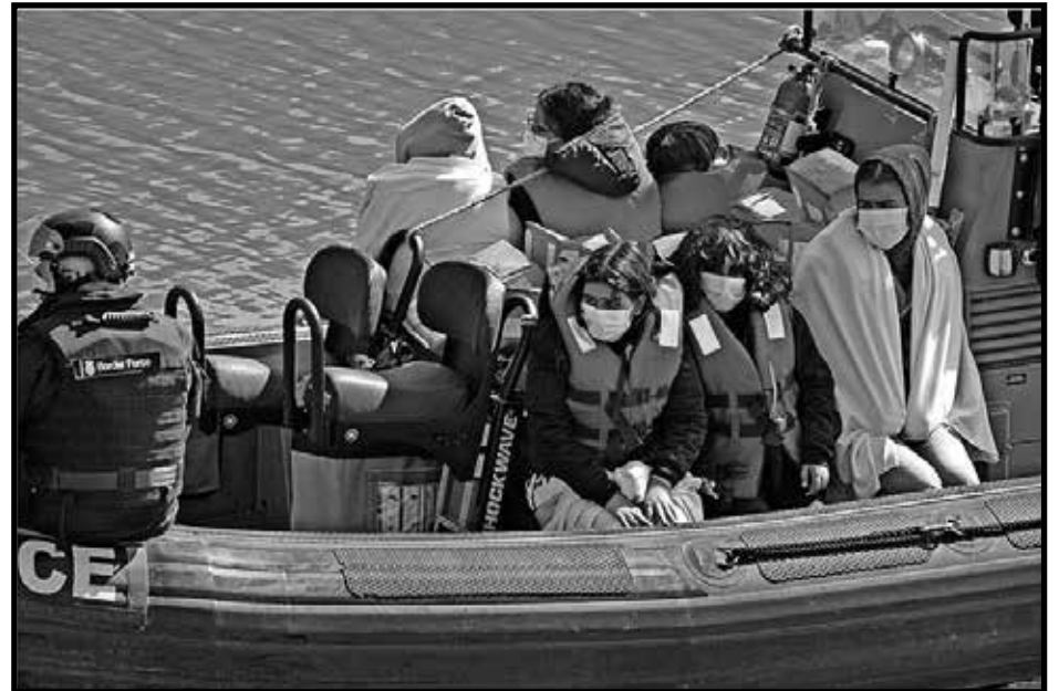
HUMAN CARGO: migrants are rescued by a Borderforce vessel; last year 45,000 made the dangerous crossing from France

Channel in small boats last year and 3,000 have made the journey so far in 2023.