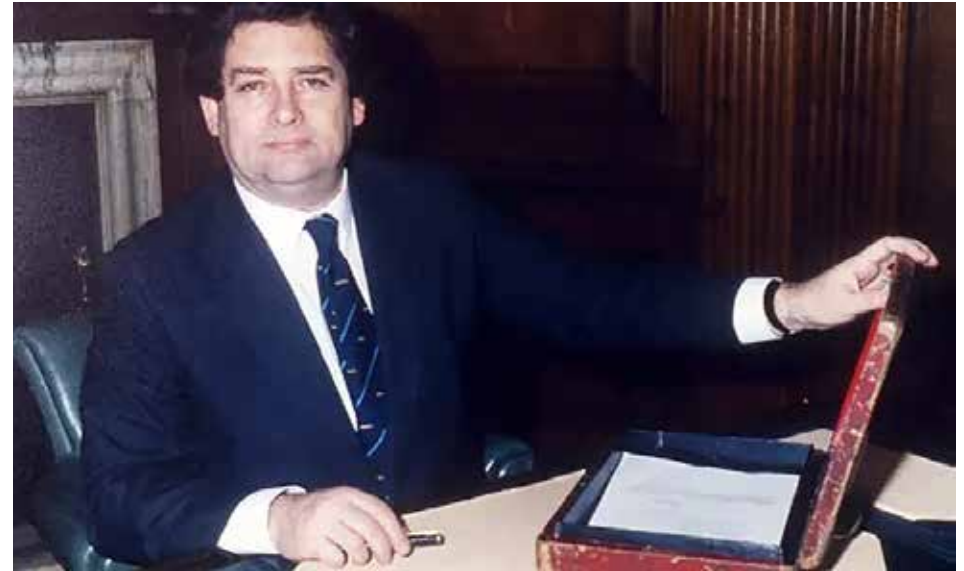
FREE MARKET CHAMPION: Nigel Lawson, pictured in Downing Street in 1987

joined in the praise, posting on Twitter last night: "Sad news that Nigel Lawson has died.