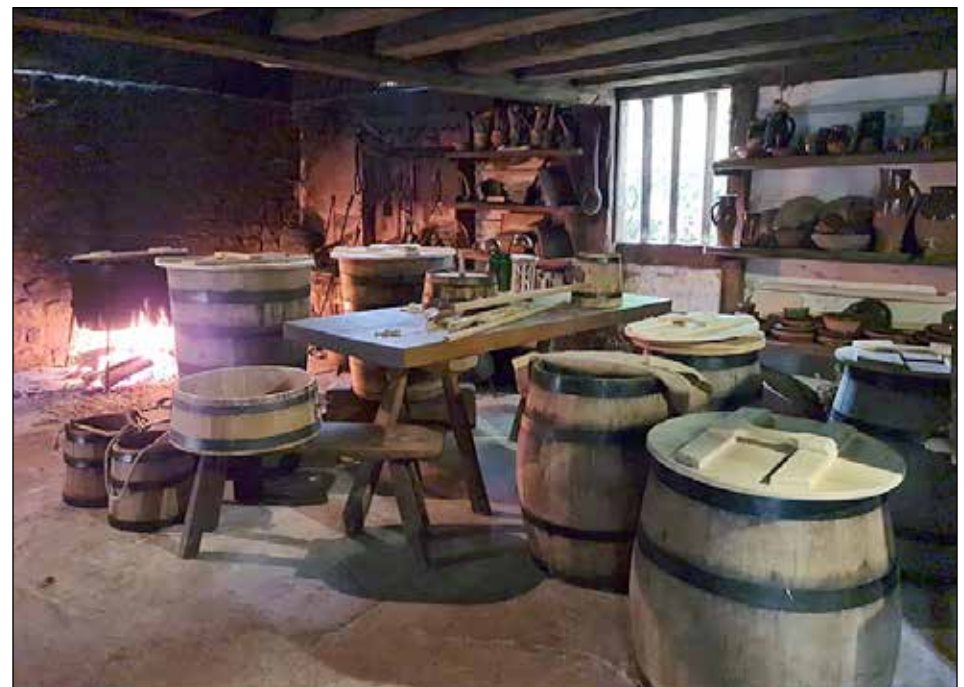
TOTALLY AUTHENTIC: the brewhouse in Sussex was stocked with custom-made equipment reproduced exactly from historical texts