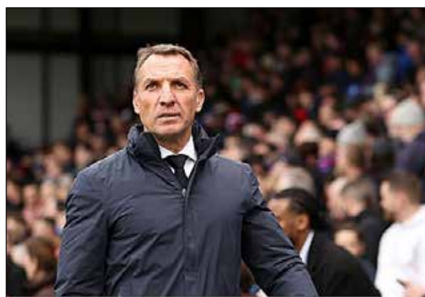
RODGERS: 'obviously disappointed' at Foxes exit