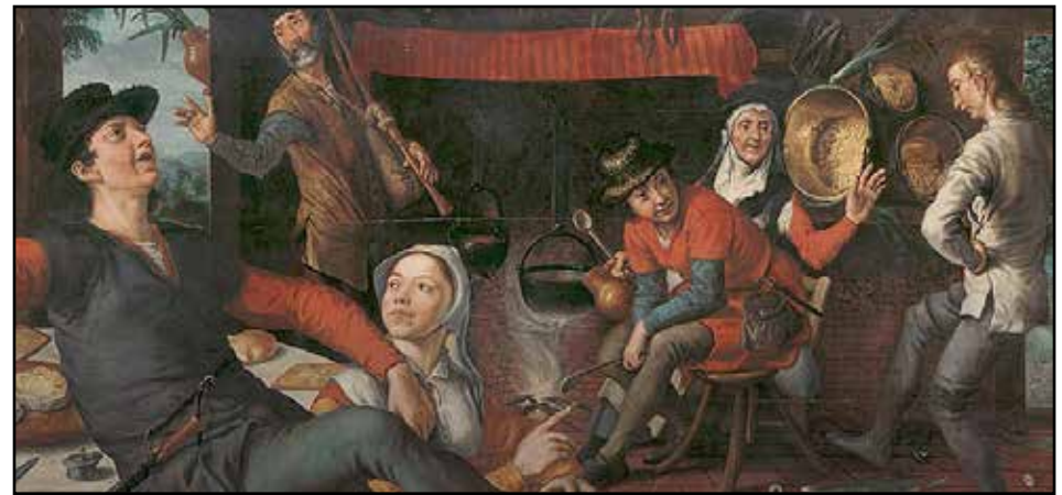
GETTING THEM IN: "beer was seen as nutritious and strength-giving, and therefore a fitting part of a worker's diet."

Curators at the museum of historic buildings, near Chichester, allowed the researchers to borrow a Tudor farmhouse