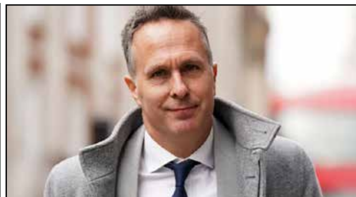
Vaughan: my two year nightmare - page 5