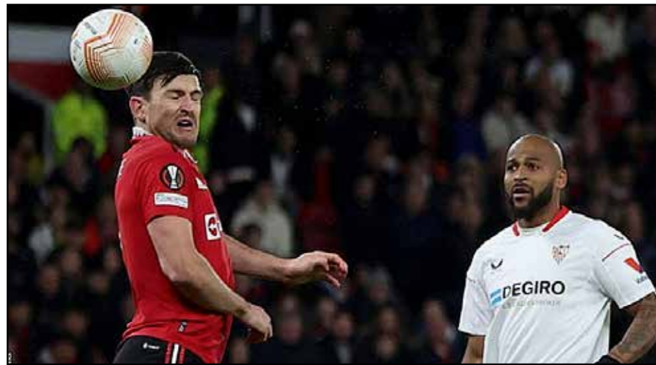
Thrupenny Bit proves costly: Maguire's late own goal made it 2-2

At that point United had a healthy advantage, with Sabitzer profiting from excellent through balls from Fernandes and Martial and Ten Hag presumably reasoned it was a wise option not to take a risk with so many big games to come,