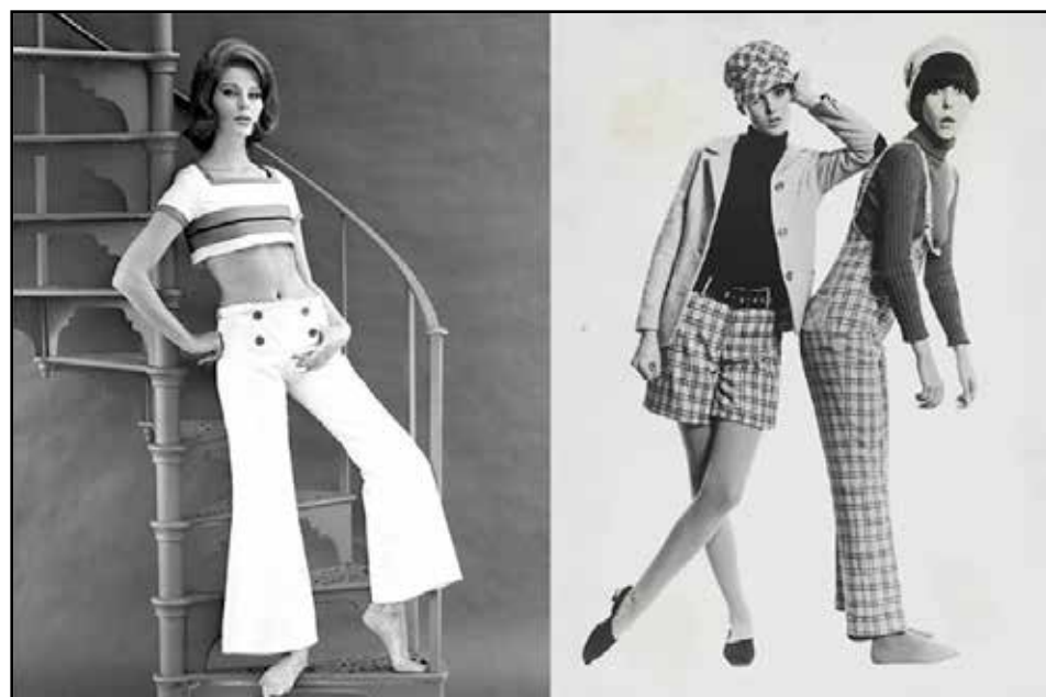
left to right: 'Tom's' trouser ensemble (1962) and 'Huntin' Jacket' and 'Humphrey culottes, with "Brand's Hatch" dungarees (1966)