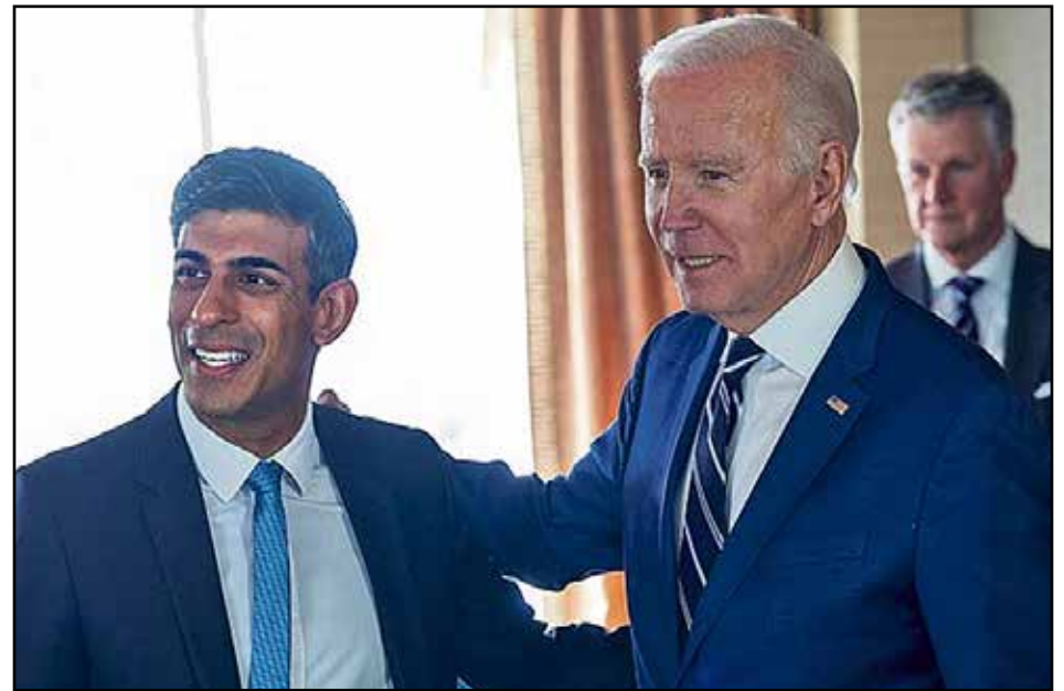
Sunak said he and Biden "had a great discussion about a range of issues including investment in Northern Ireland."

The Democratic Unionist Party boycotted the power-sharing executive last year in protest at post-Brexit trading arrangements. They feel it gives the EU