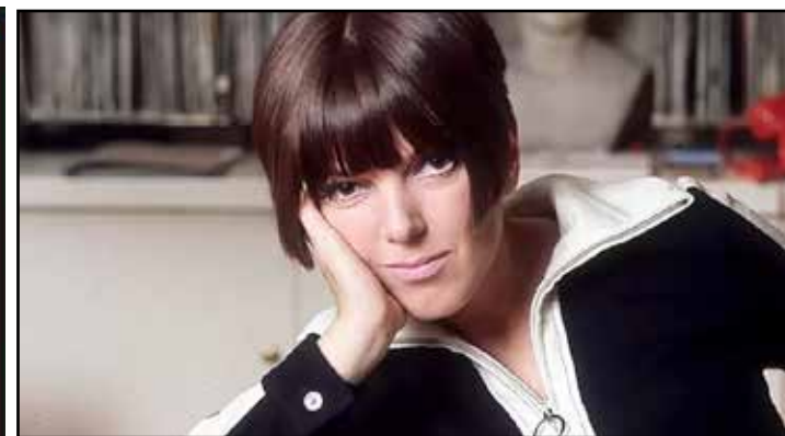
Farewell, Mary Quant - page 3