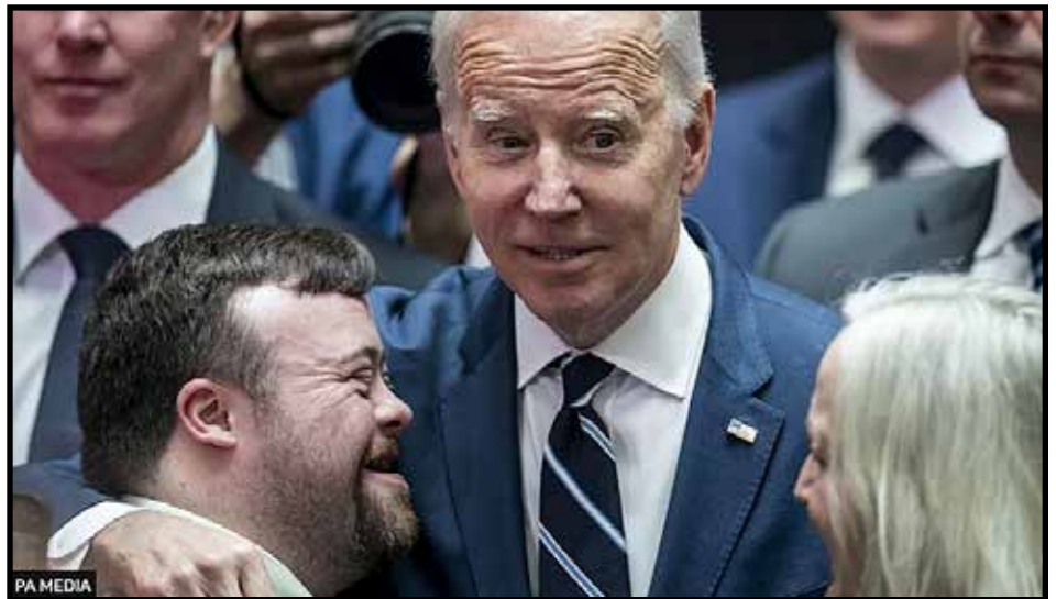
Biden drew a big cheer when he hugged James Martin, the Oscar-nominated Northern Irish actor who has Down's Syndrome

economy - cybersecurity, life sciences, green energy.