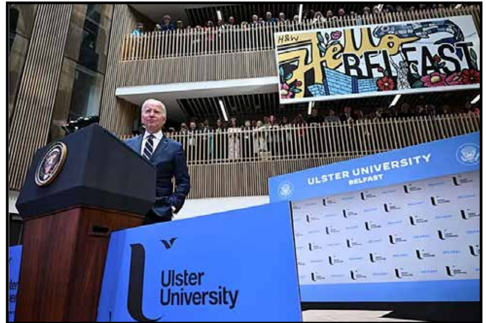
President Biden "recognised the need to bring balance to what he had to say", said the leader of the Democratic Unionist Party

The industries he mentioned are already bright spots in the Northern Ireland