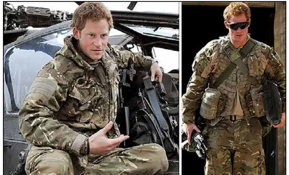
HE WAS EXPENDABLE? a controversial new documentary claims so