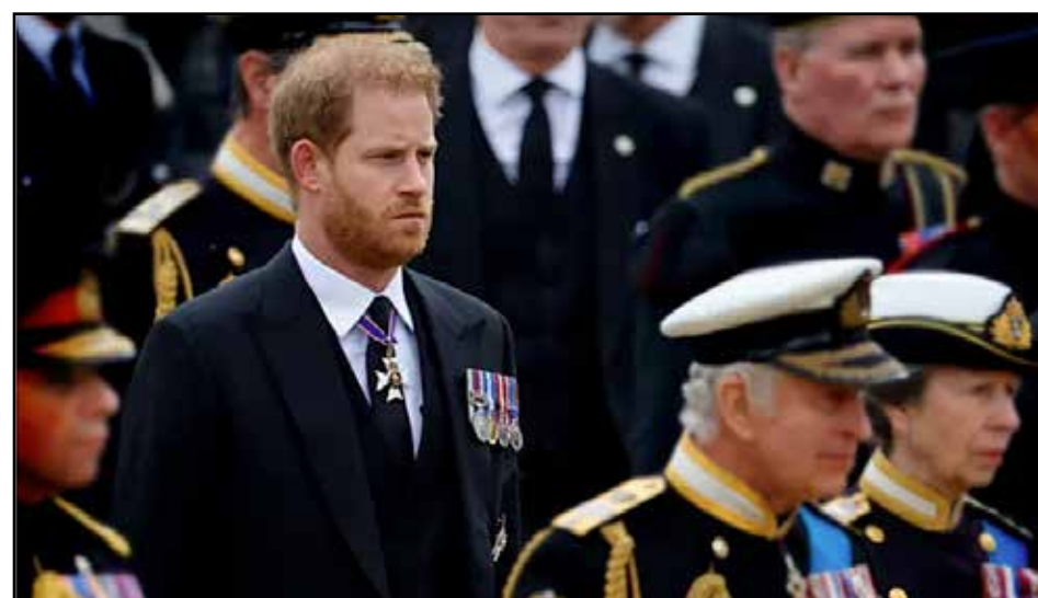
HARRY: a delicate truce seems to be emerging between the outspoken Prince and his English family

There has been growing speculation that the pair may even have spoken in recent weeks. But sadly Prince Harry's relationship with his brother William is still