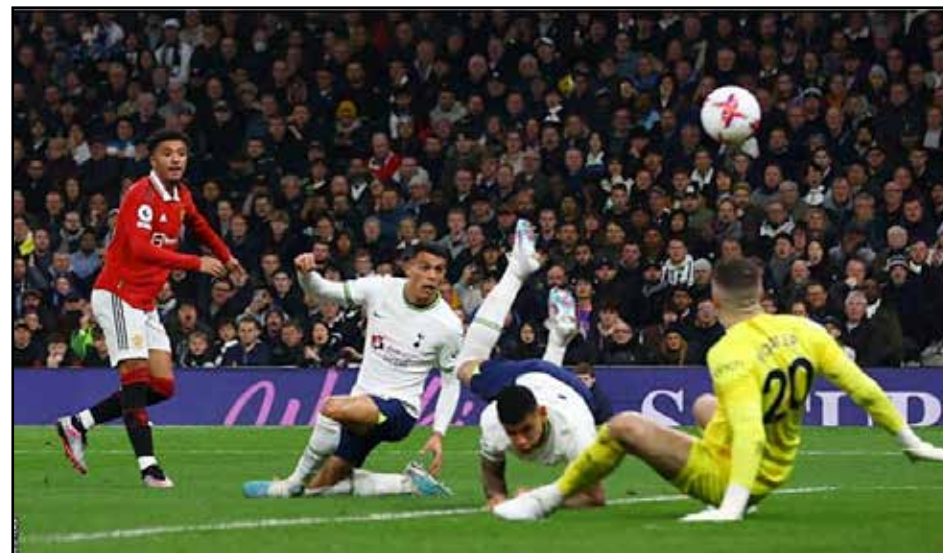
ANOTHER POOR START: Spurs went behind to Jadon Sancho's early goal

United remain well placed to finish in the top four but the sloppy manner in which