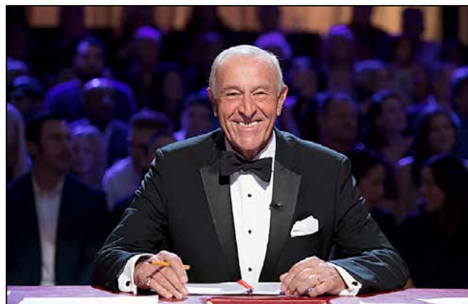
LATE BLOOMER: Goodman did not become a household name in the UK until he was 60...but then there was no stopping him