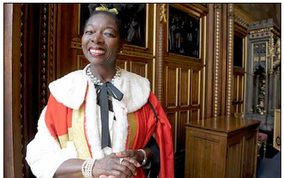
Baroness Benjamin: the Liberal peer made her name as Floella Benjamin, working as an actress and presenter for children's TV

She is among an eclectic group set to carry historic items such as crowns, sceptres, rings, rods and the orb in the procession, while others will present