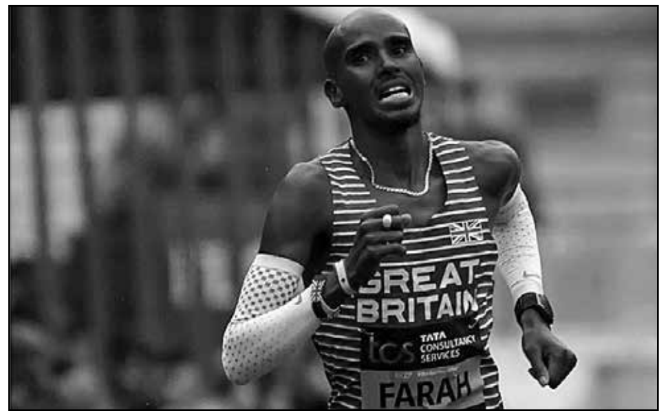
I can hopefully now enjoy time with my family and little ones - Mo Farah

Now 40, Farah said that it was the people - and even the memory of the London 2012 Olympics, where he won double gold over 5,000m and