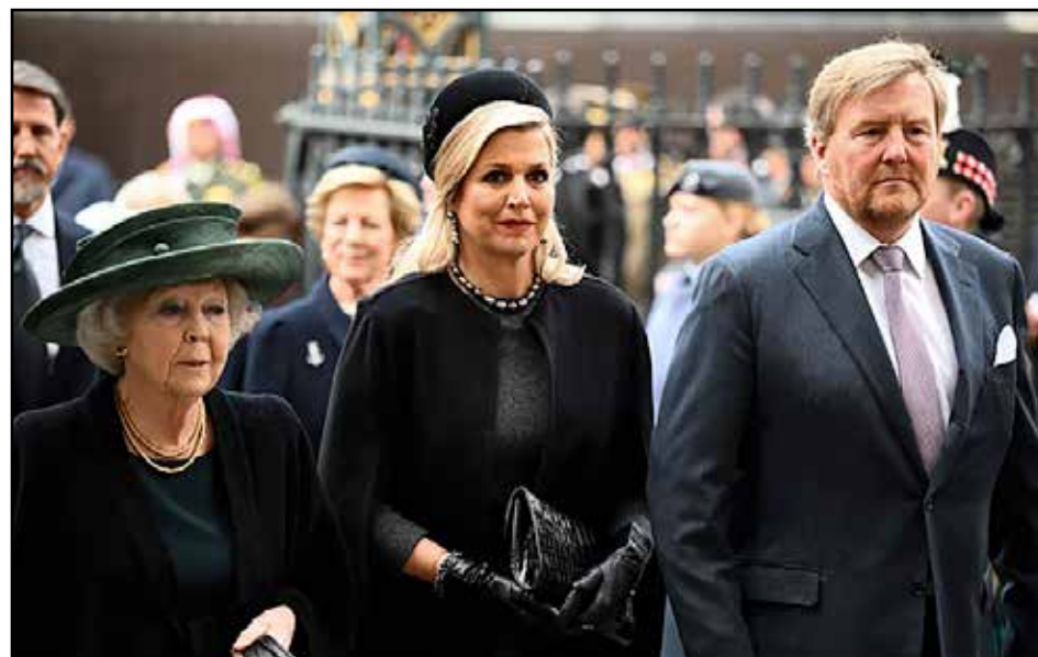
Princess Beatrix, Queen Maxima and King Willem-Alexander of the Netherlands are all expected to be in London for the celebrations, alongside Catharina-Amalia, The Princess of Orange

It is thought his trip will be a flying visit, with no plans to attend any other