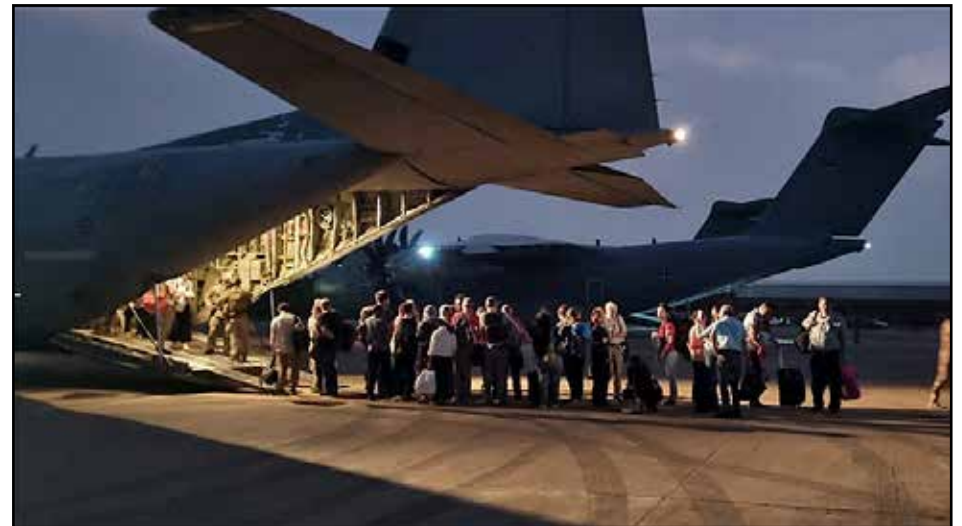
SANCTUARY: Britons at Khartoum airport prepare to board an RAF flight