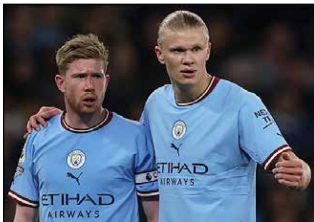
UNSTOPPABLE: Kevin de Bruyne and Erling Haaland combined to devastating effect Wednesday night

The confrontation billed as a potential title-decider turned into an embarrassingly one-sided affair.