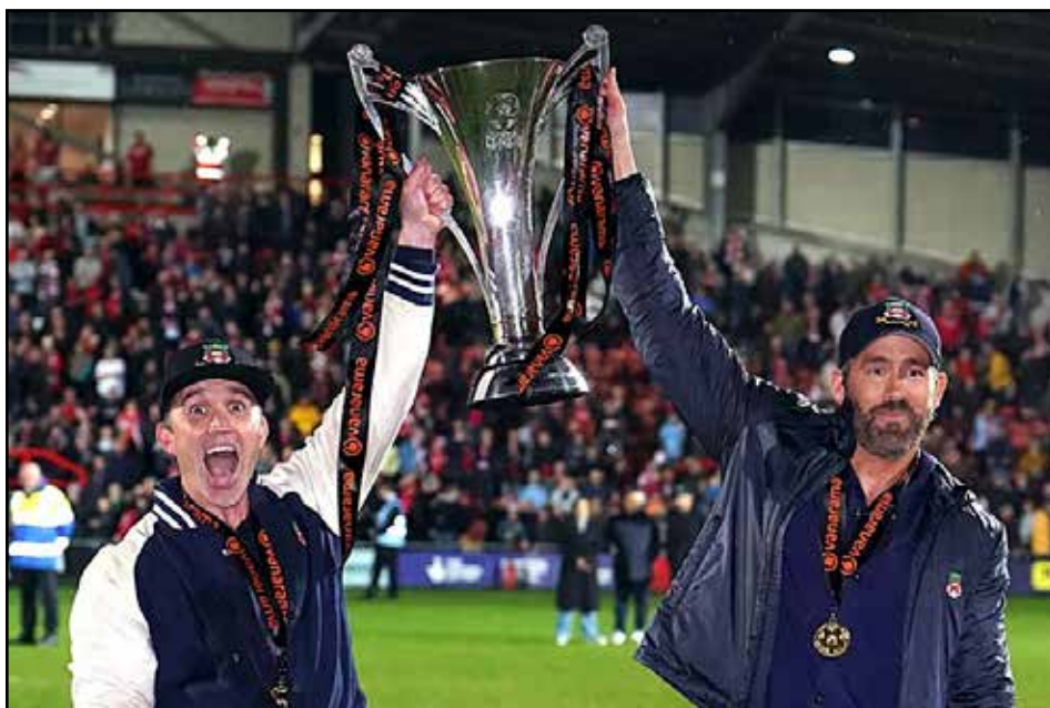
FAIRY TALE ENDING: Rob McElhenney and Ryan Reynolds lift the National League trophy

The title is not run yet and no-one at City will be complacent, but this performance carried all the hallmarks of a side on a mission to keep their crown and who now have all the momentum with them.