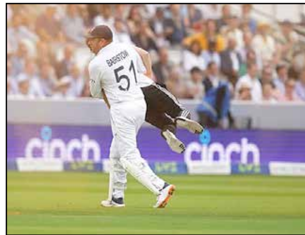
KEEP CALM AND CARRY OFF: Bairstow deals with a protester Thursday at Lords

similar disruptive action to sporting events this year, as Just Stop Oil tries to force the Government to ban new fossil fuels licences, citing a climate crisis.