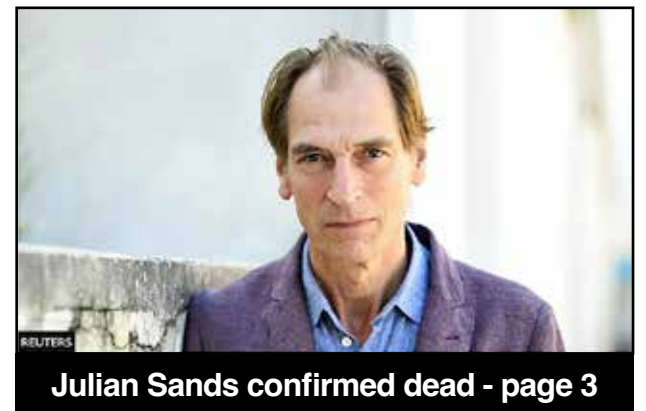
Julian Sands confirmed dead - page 3

Pyramid stage, while Debbie Harry and Blondie also wowed the crowds along with Yusuf Islam formerly Cat Stevens in the legends slot.