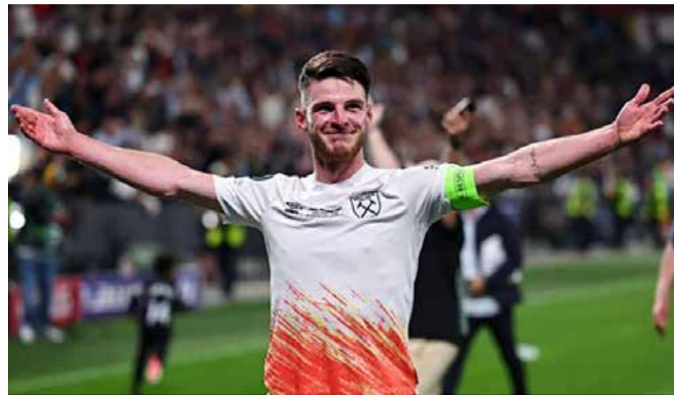
PROVEN WINNER: England midfielder Declan Rice led his team to victory in the Europa League Conference Trophy final last month

The Premier League's most expensive signing is the 121m euro (£107m) transfer fee that Chelsea paid Benfica for Argentina