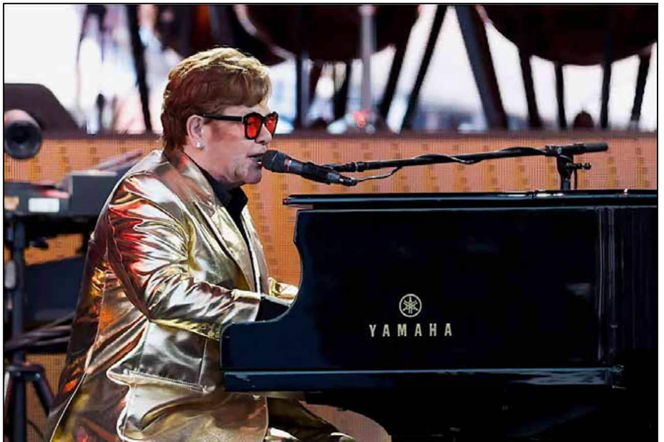
ELTON BOWS OUT: I want to thank you also for 53 years of amazing love and loyalty that you've shown me. It's been an incredible journey, and I've had the best, best time."

Those wanting to see the historic show included an array of stars including Paul McCartney. Even Elton's