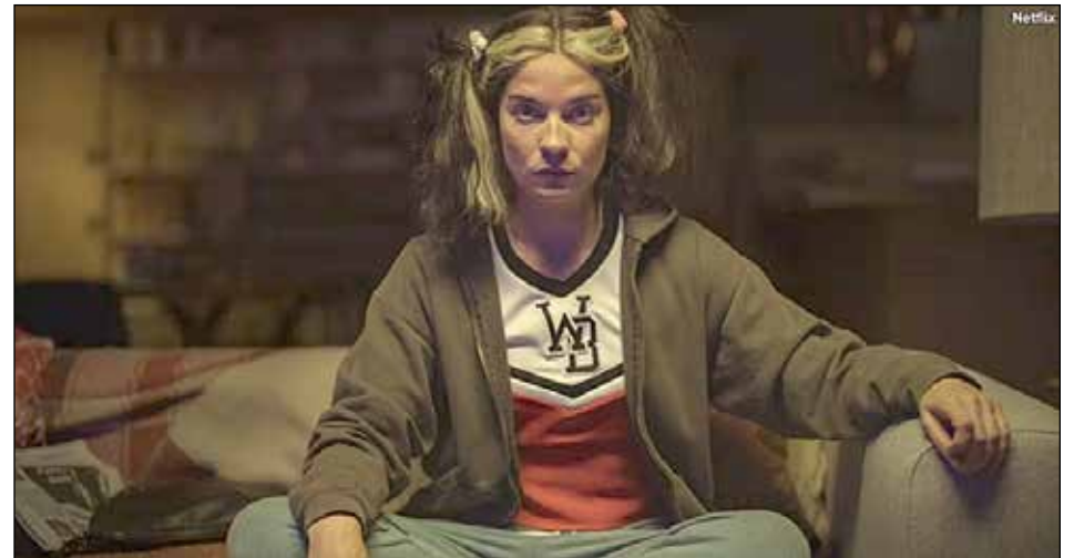
FRIGHTENINGLY GOOD: Annie Murphy (above) stars in "Joan is Awful" while Davis and Pia (Davis McCardle and Myha'la Herrold, below) find that digging into a Scottish village's dark secret may not work out so well...

Despite what you may think Brooker maintains that Black Mirror is not about the wickedness of Big Tech. Speaking to Esquire magazine recently, he said: "Humans are weak is the story, rather than technology is evil, because I love tech."