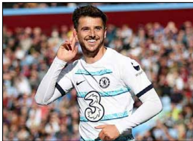
Mount had been with Chelsea since he was six

He has been capped 36 times by England, scoring