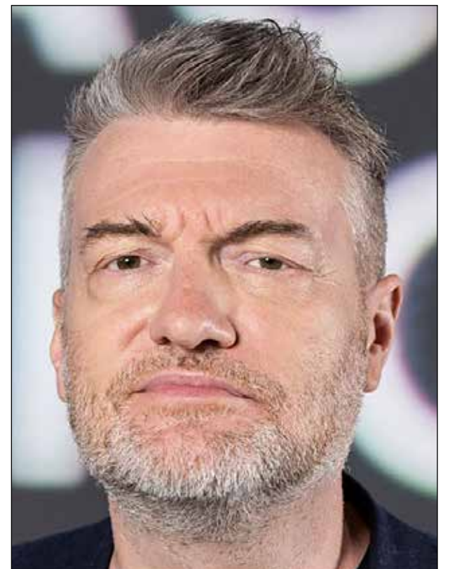
GREAT BRITISH TALENT: series creator and head showrunner Charlie Brooker

Of this season's throwback vibe, Brooker says: "It was a refresher.... there's generally some downers and there's some bitters; there's some bleak and bittersweet and happy endings." He's also very conscious of the time-suck that so much of today's linear television demands, forcing viewers to sink ten or more hours into something that may or may not pay off. How nice, then, that Black Mirror offers - he hopes - a little something for everyone?