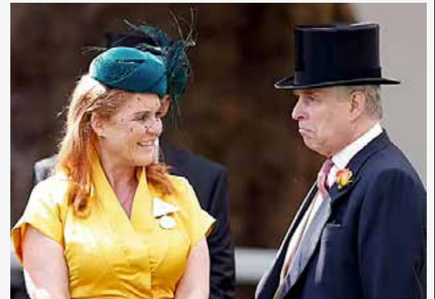
BEST OF FRIENDS? Sarah and Andrew still share a home, 27 years after their 1996 divorce

Andrew, 63, despite the couple divorcing in 1996 after 10 years of marriage.