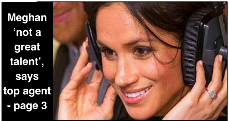
Meghan 'not a great talent', says top agent - page 3