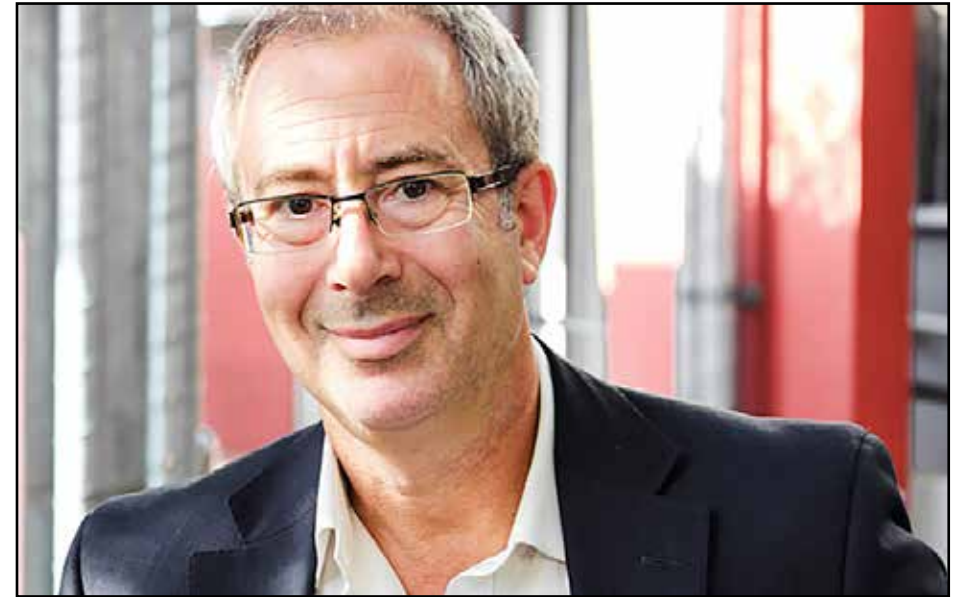
BEN ELTON: astonishing rant aimed at Rishi Sunak

The defendant was ordered to pay more than £600,000.