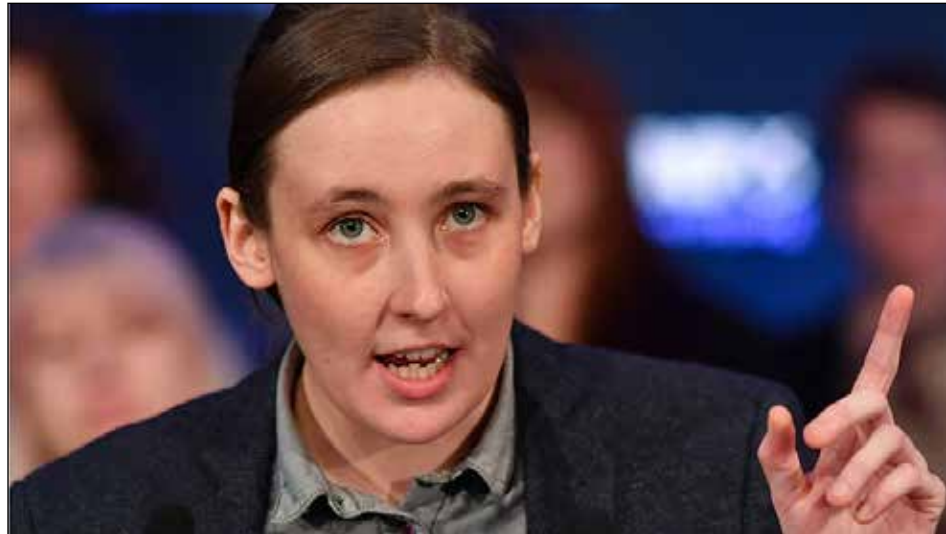
DISENCHANTED: Mhairi Black described parliament as "a poisonous place"

The SNP's deputy leader in Westminster, Mhairi Black, has announced she will stand down as an MP at the next election, as she is "tired" of the "toxic environment".