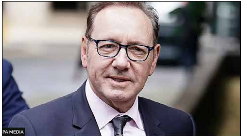
Kevin Spacey arrives at Southwark Court in London for the fourth day of his trial on Thursday

"I hope he does the right thing - if he apologises then maybe I won't want him to go to court," he told police.