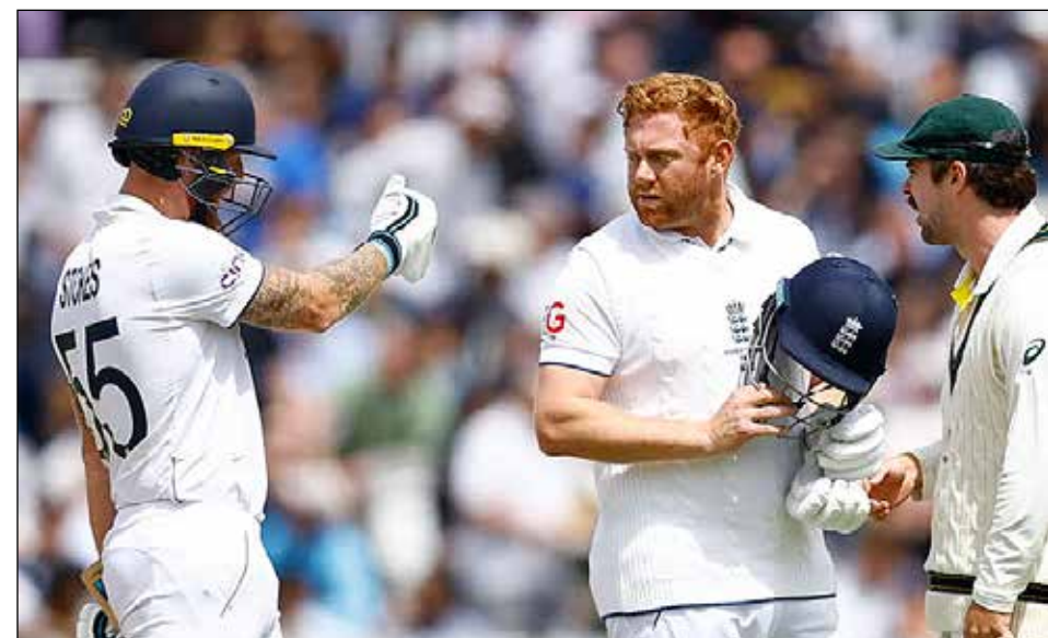
A VERY LONG TALE: Bairstow's bizarre dismissal in the Second Test has fuelled furious exchanges in the English and Australian media

Her friends too "have been amazing and have created memories which sustain me and give me strength".