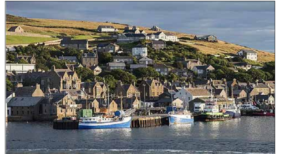
Orkney residents have long chafed over what they see as neglect from both Scotland and London...and see the Faroe Islands as a possible model

"We have been held down and we all know most of what I could say today in terms of discrimination against this community from governments. We all know how much less we get compared to other island groups."