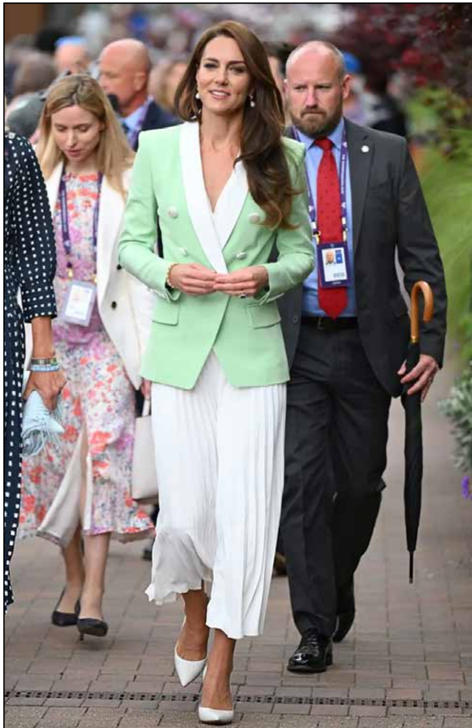
MINTED: Kate dazzled in her Balmain blazer (above). Elsewhere in crowd were former Prime Minister David Cameron and wife Samantha (below)

And the Swiss legend caused some amusement among the crowd as he broke royal protocol by touching Kate on the back and leaning in for a kiss - prompting the royal to move back