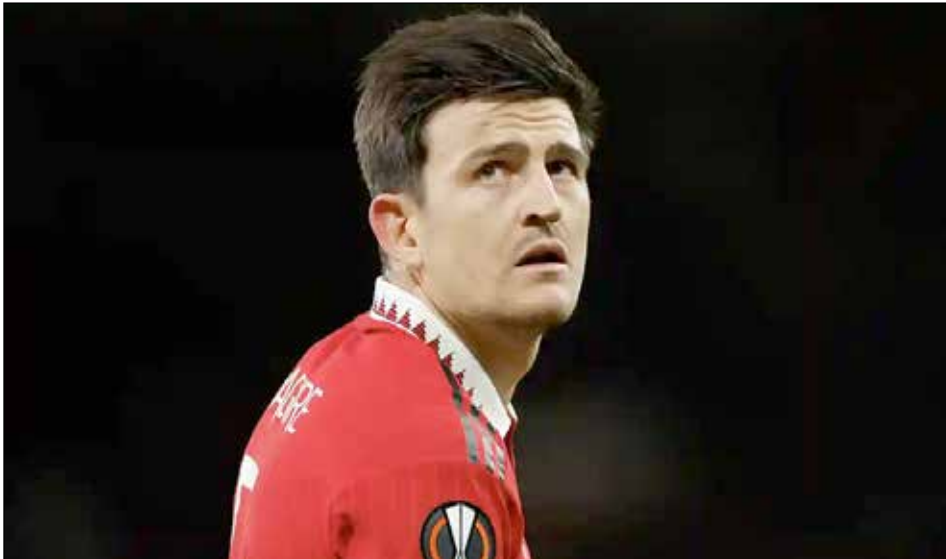
MAGUIRE: the England defender is no longer a first choice at Old Trafford