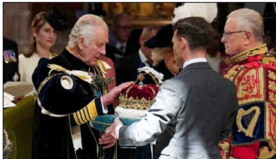
Charles received the Crown, the Sceptre and the Sword of State at St. Giles’ Cathedral

Elizabeth II invented the idea of a Scottish celebration on her first trip to Edinburgh after her Coronation in 1953. But the Honours of Scotland, the crown jewels, date back to the 16th century. After the Union in 1707 they were locked in a chest and only rediscovered by Sir Walter Scott in 1818.