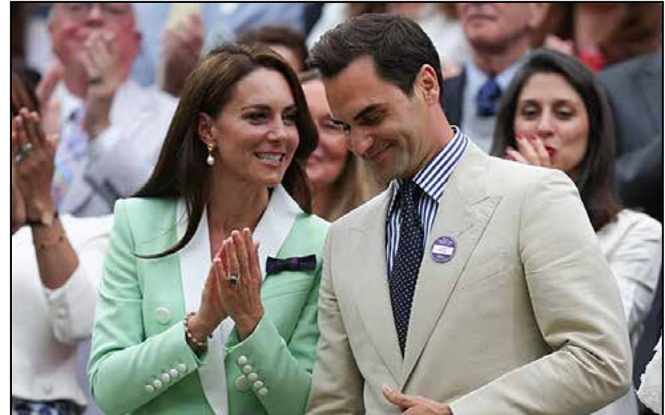
Best of friends...just don't kiss her: Kate and Roger Federer share a laugh