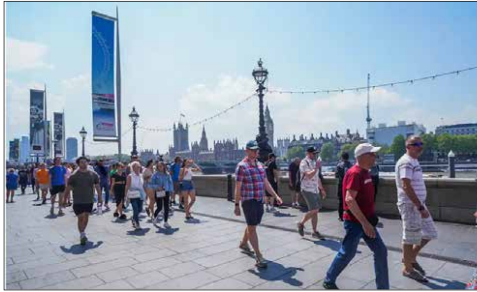
People walking on London's South Bank on a sweltering day in early June

"If July is like June, if August is like June, then we will get far more fish kills than we've ever seen. There is a knock-on effect. The fish are the visible bit because that's what people see floating on the surface but it is also [about] what is happening