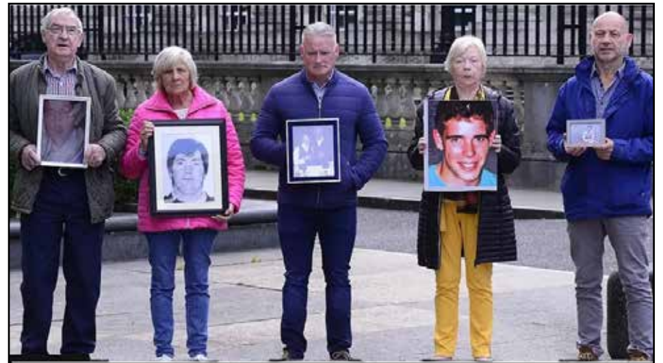
Relatives of the five men held photographs of them outside a court in Belfast this week after the announcement of the new inquests