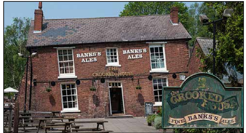
SOMETHING'S CROOKED HERE: Locals have vowed to get to the bottom of the mysterious fire at the famed Crooked House

Staffordshire Police said in a statement: "Our investigation into