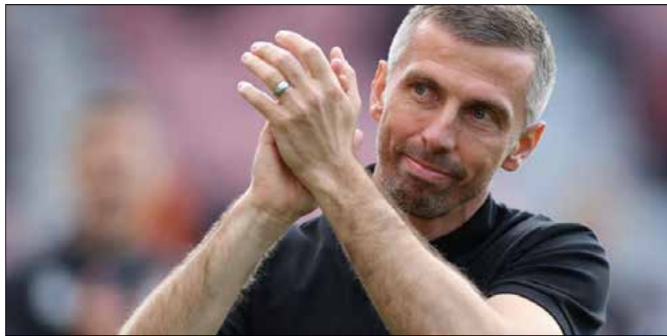
GOING PLACES: Gary O'Neil has been named the new Wolves head coach