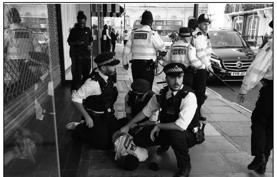
LOOTED AND BOOTED: Met Officers subdue a rioter near Oxford Street

But less than 24 hours later police were forced to