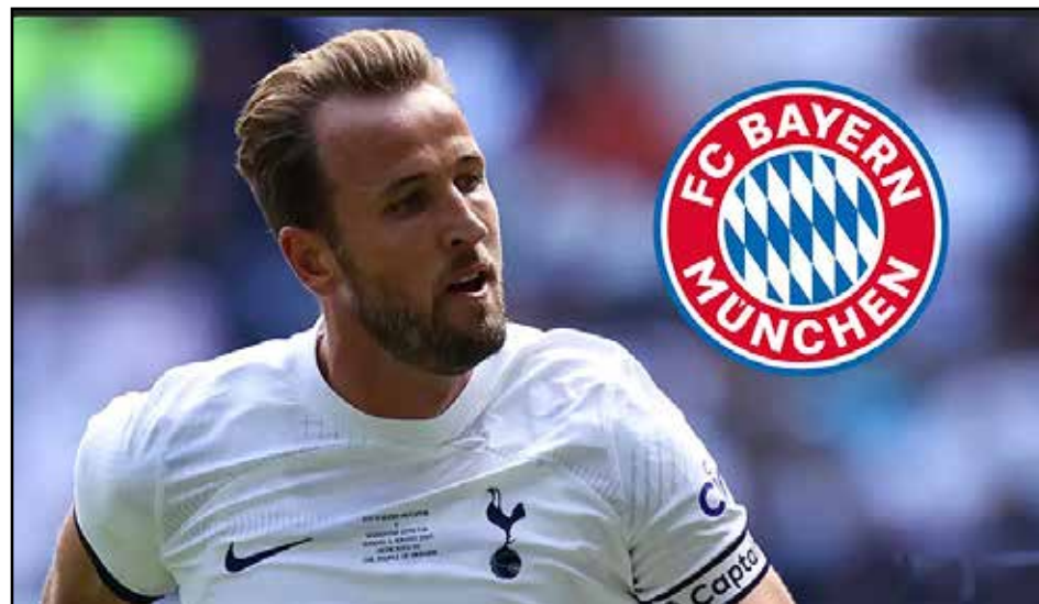
WANTED MAN: Kane has one year left on his contract

Tottenham chairman Daniel Levy has repelled interest in Kane numerous times over the years, including in 2021