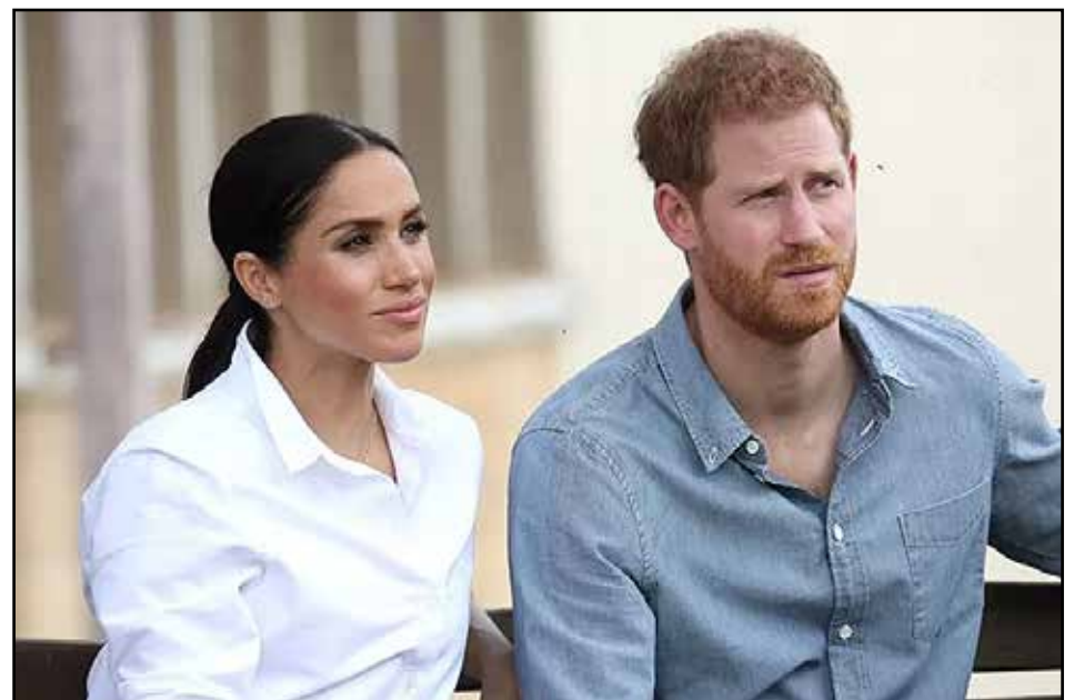
MAKE WHAT YOU KNOW? The Duke and Duchess are pinning their hopes on a steamy tale of death, sex, childhood trauma and mental health issues...

Its incendiary claims included an allegation that an irate William had physically attacked his younger brother during an explosive row. Despite the damage that it caused his father, Harry and the King are understood to have remained in close contact throughout the