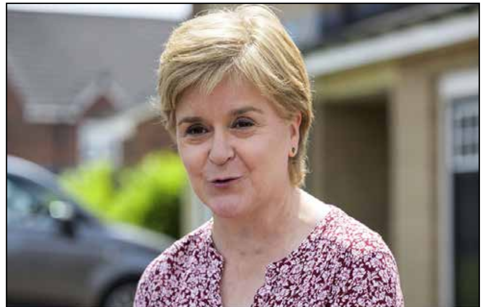
'arrogant and entitled'? the former First Minister's political foes think so...

Pressed on whether it would be illegal for the Home Office to remove accommodation, he told BBC Radio 4's Today programme: "That is something the courts would have to consider but I think it would be unlikely that it would be illegal ... I suspect it's unlikely to be unlawful."