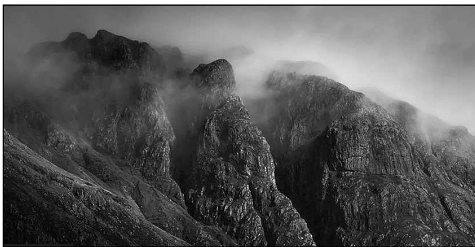
The ridge in Glen Coe is popular with climbers

"It's about closure for us and the truth and justice for Daddy."