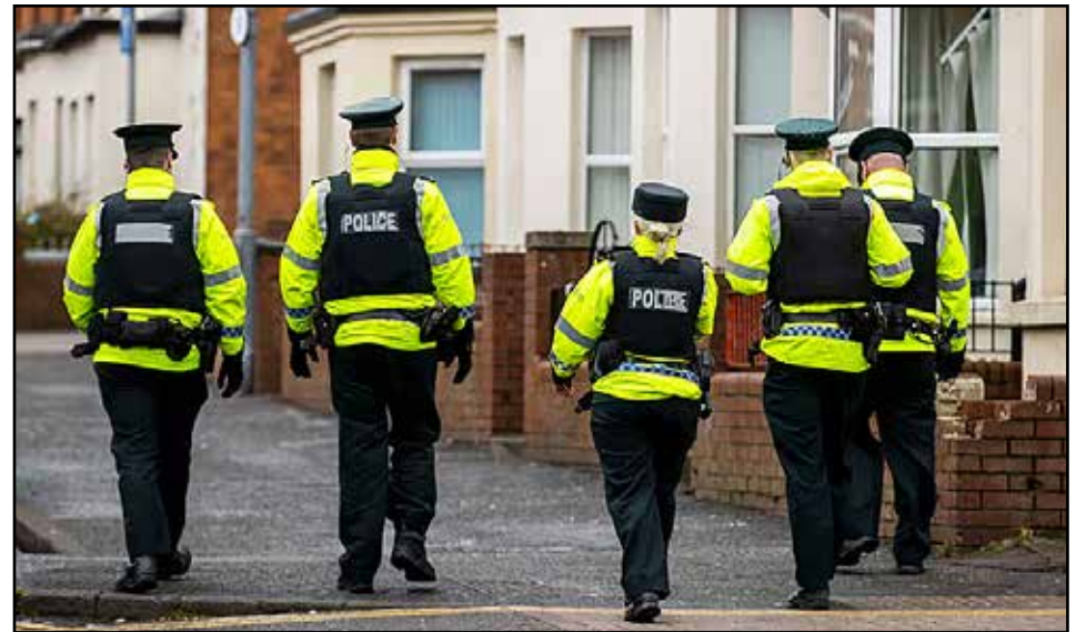
PSNI officers on patrol in Belfast. The PSNI's assistant chief constable has apologized to officers for the data breach

procedures must be addressed and addressed urgently. New safeguards are obviously required to prevent this from ever happening again."