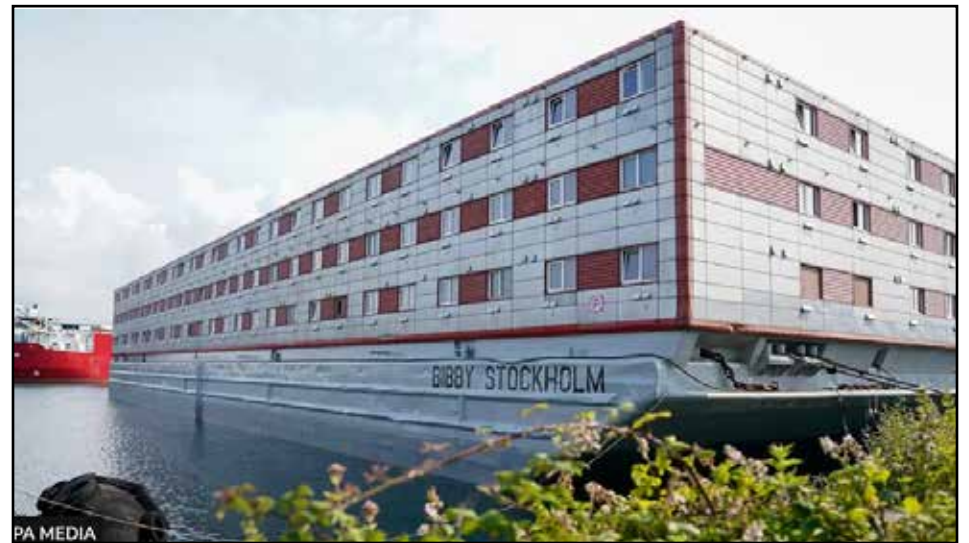
FLOATING THE IDEA: the Bibby Stockholm barge in Dorset

"It's becoming clear that the government