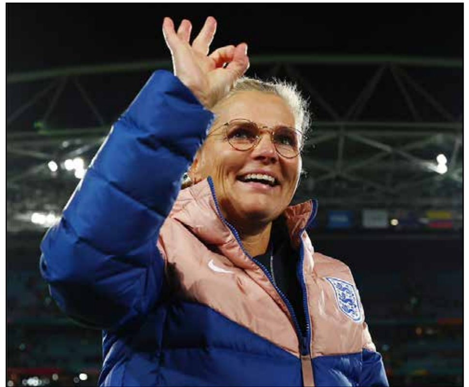
WIEGMAN: She's someone we'd like to have with us for a very long time."

Bullingham went on to say Wiegman "could do anything she wants in football" when pressed if she could potentially take over from men's boss Gareth Southgate.