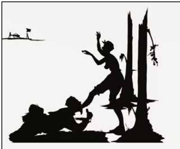
Artist Kara Walker, currently the subject of an exhibit at the Hammer Museum, draws inspiration from depictions of the antebellum South - testimonials of the formerly enslaved, historical novels, and minstrel shows