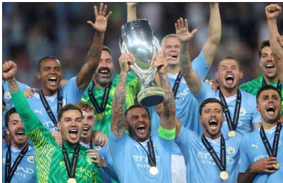
JUST SUPER: City needed penalties to get past a stubborn Sevilla team