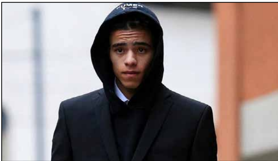
Mason Greenwood has not played for United since his arrest in January

It is thought United's direction of travel was for Greenwood to return in some form, but the fierceness of debate around his future, among other things, has made them pause.