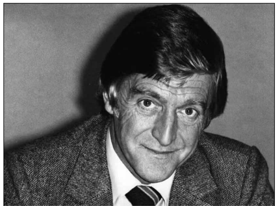
Michael Parkinson in 1980

not to undertake further forensic scientific testing following the discovery of another man's DNA in a "crime specific" location on the victim's vest top.