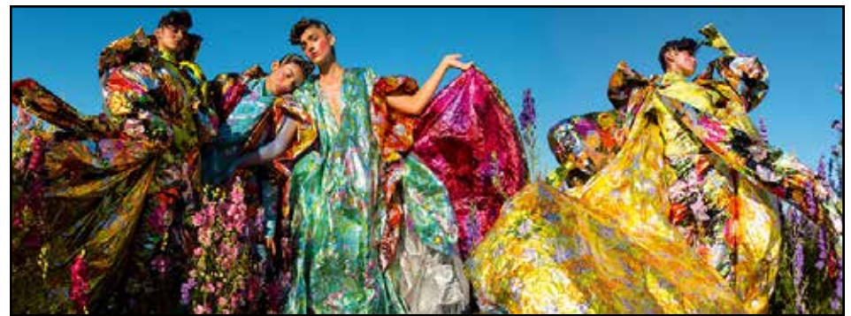
A still from the "Tim Walker: Wonderful Things" exhibit, ending this weekend at the Getty Center and (below) a classic piece of Keith Haring's work, at The Broad

MOCA's locations in both downtown LA and Santa Monica are excellent for contemporary artwork and conveniently located, depending on your Eastside/Westside location. But I particularly love The Broad museum in downtown - Eli and Edi Broad's personal collection of modern art is eye candy personified, from Warhol