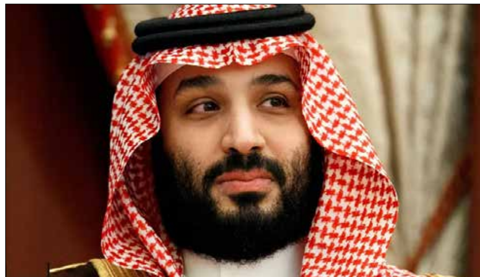
"It beggars belief that Rishi Sunak is rolling out the carpet for Mohammed bin Salman," said Labour's foreign affairs spokeswoman

Saudi Arabia has also spent billions of pounds through its Public Investment Fund on international sports deals, including a takeover of Premier League club Newcastle United and the negotiation of a dominant