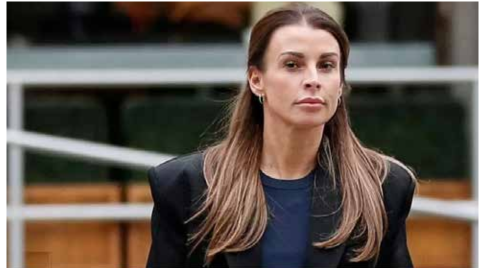
Coleen Rooney won her High Court case last year

The July 2022 trial came after Rooney conducted