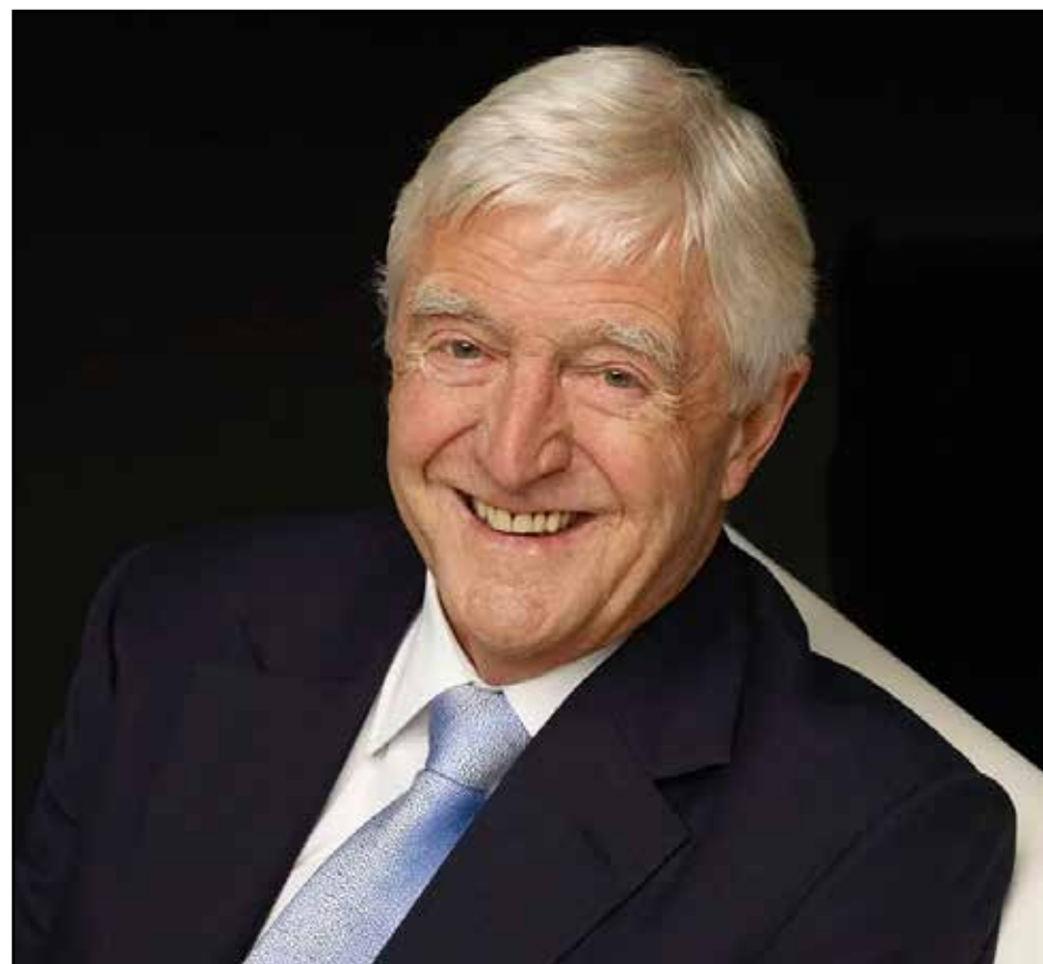
“The genius of Parky was that unlike most people he was always 100% himself.”

Former cricket umpire Dickie Bird, a friend since childhood, told the PA news agency: “His friendship meant more to me than anything else.