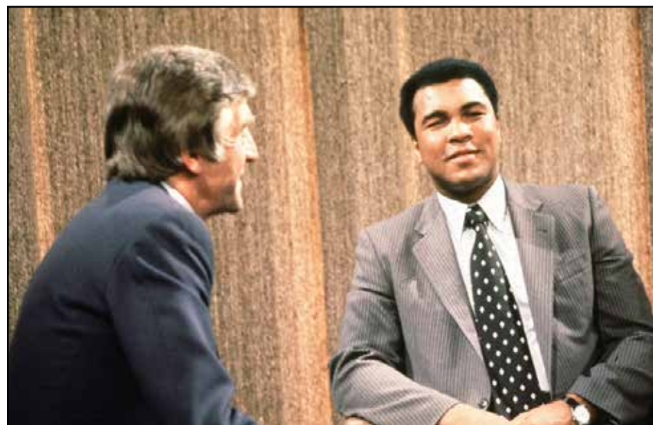
TV GOLD: Parkinson with his favorite guest, Muhammad Ali

If I wanted any advice, I would ring Parky up. He helped me in so many, many ways.”