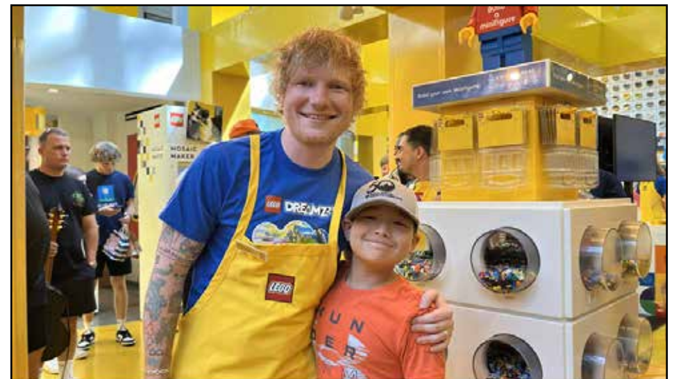
SHEER DELIGHT: the hitmaker surprises a young fan at the Minnesota store

hitmaker’s official title for the day at the Mall of America in Minnesota was “brick specialist”.