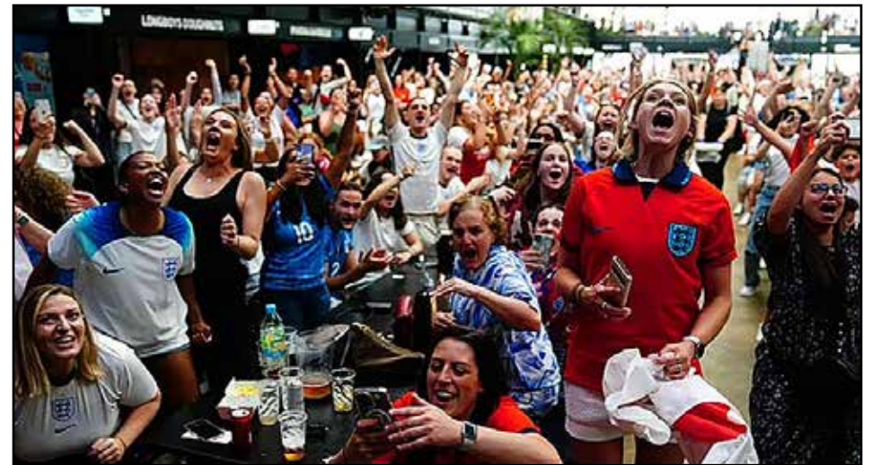
INTO THE FINAL: delirious fans celebrate England’s 3-1 victory on Wednesday