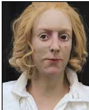
By 18th century standards Charlie was a looker...

for his good looks and has captivated a new generation of audiences through the TV show Outlander.