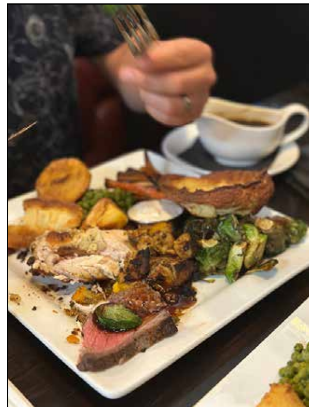
The Real McCoy: the Sunday roast at BikeShed is worth the trip to downtown

Admittedly, I had reservations about its location in the art district of downtown LA, but I must say, you needn't venture elsewhere. BikeShed delivers an authentic British experience in a uniquely repurposed setting, making it a must-