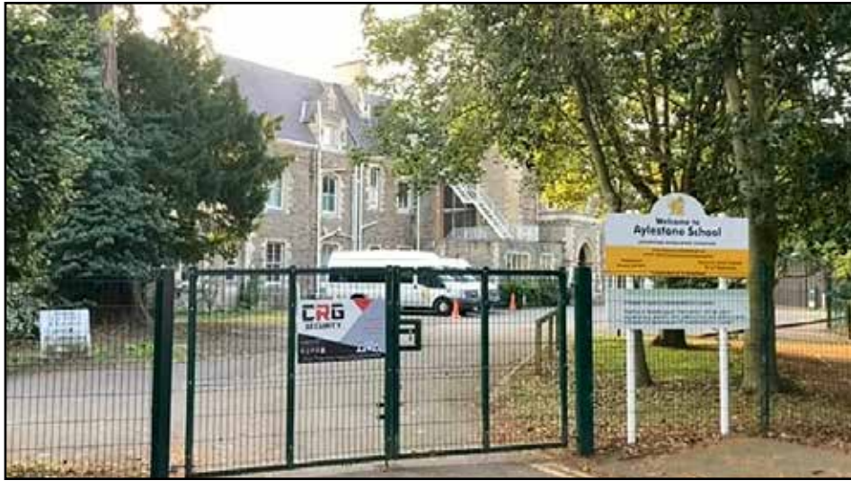
As a child, the serial killer attended Aylestone School where she was described as a 'normal happy smiling child'