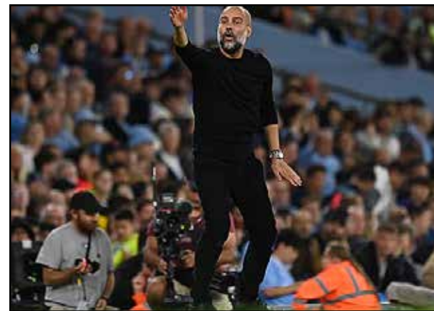
BACK AGAIN? very soon, allegedly

In a statement the club said: "Pep Guardiola has today undergone a routine operation on a back problem. The Manchester City boss has been suffering with severe back pain for some time lately, and flew out to Barcelona