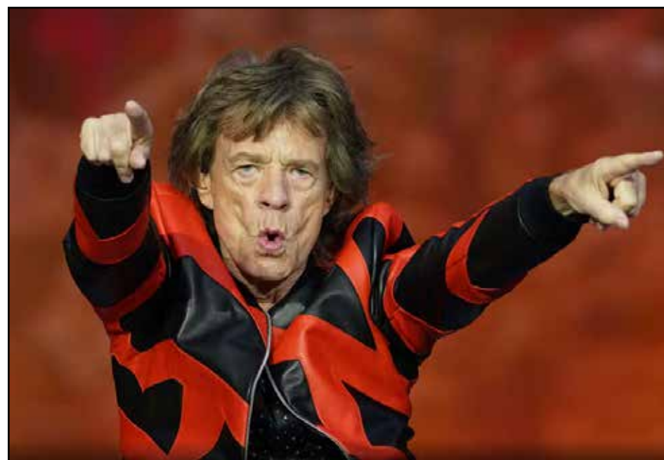
ROCK OF AGES: Mick Jagger turned 80 last month

References to at least three of the band's best-known hits are included in the text of the advert: (I Can't Get No) Satisfaction, Gimme Shelter and