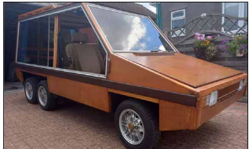
BRITISH INGENUITY? Fewer than 400 Hustler kit cars, designed in the 1970s, have been built, and most were made using fibreglass

"A wooden car could almost be something dreamt up by Elon Musk - a sustainable way to build cars, an eco-friendly alternative to the mass-production car plants of today. It was remarkably way ahead of its time. Who knows, in 30 years we may all be driving wooden cars."