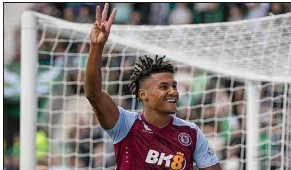
OLÉ OLLIE: Watkins bagged a hat trick in his Europa League Conference debut