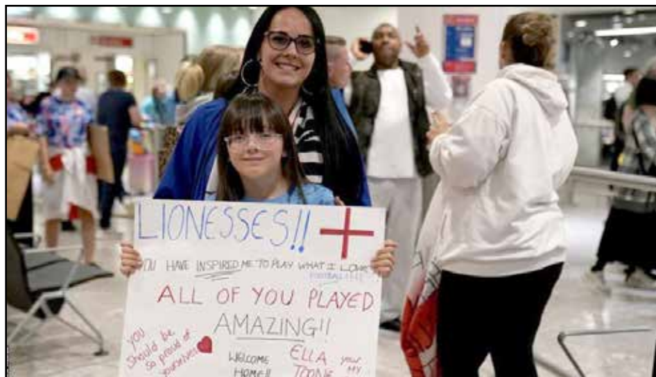
PROUD OF YOU: fans waiting at Heathrow's terminal to greet the team