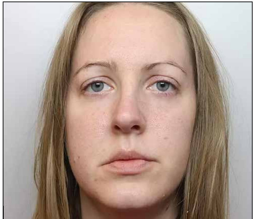
BEYOND BELIEF: Lucy Letby was found guilty of murdering seven babies and the attempted murder of six others

The trial lasted for more than 10 months and is believed to be the longest murder trial in the UK.