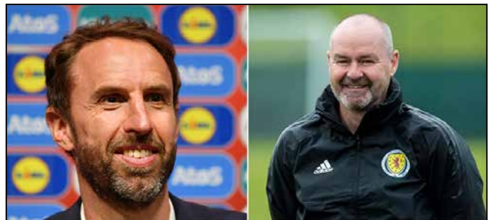
England's Gareth Southgate and Scotland's Steve Clarke have guided their countries to impressive starts in qualifying for next year's tournament

Northern Ireland are struggling. Just three points so far from four Group H games means a six-point gap between themselves and the