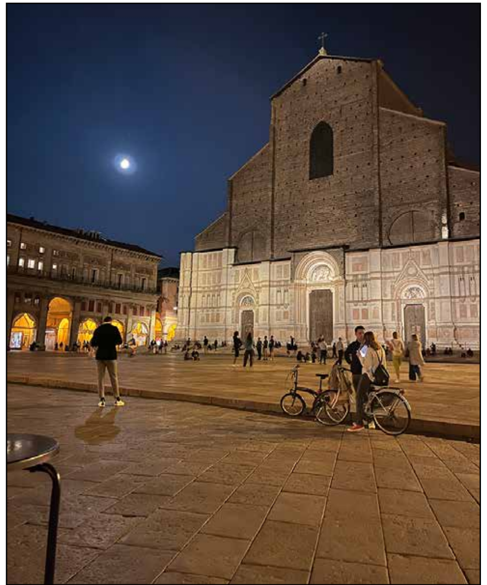
The city's iconic Piazza Maggiore is an ideal spot to enjoy a post-dinner digestif

In medieval and renaissance times Bologna was known as 'the city of towers' due to the large number of the structures built by the local elite. They served the dual purposes of defence and an ostentatious show of wealth and power for the competing local families. Today many of these