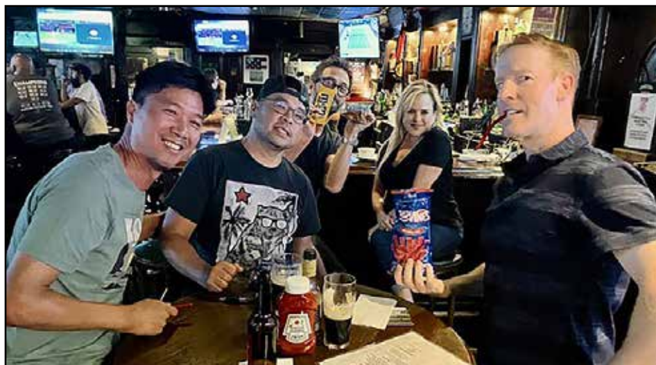
Pretend We're Famous earned a runners-up spot at this week's Pub Quiz