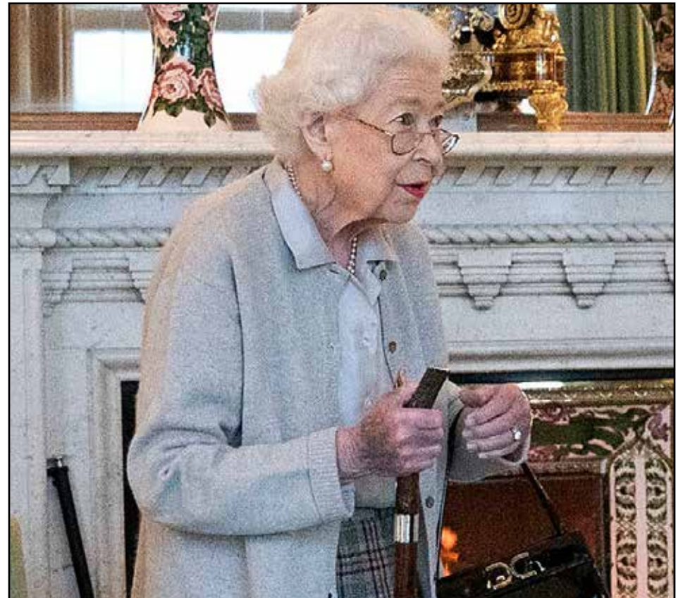
"She was in a very peaceful, private place. She was at peace."