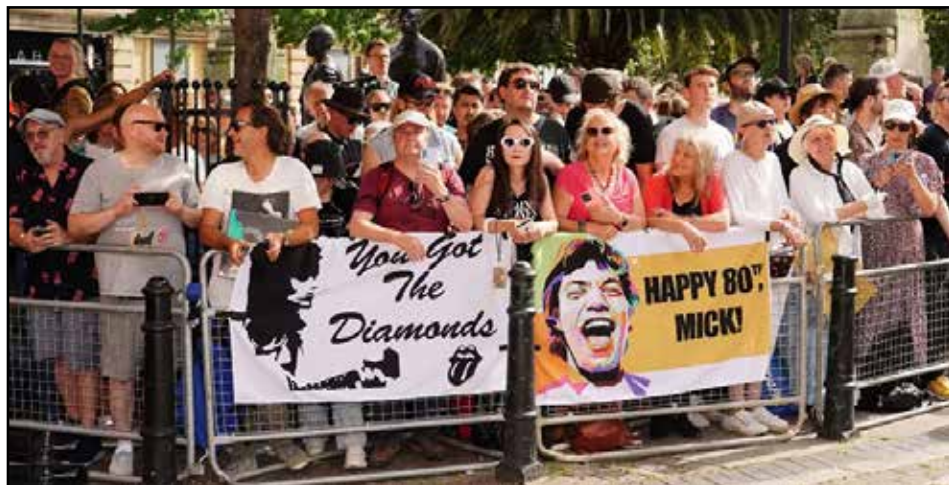
START THEM UP: fans to gathered in Hackney to see the rock legends

in a blaze." For what could realistically be the Stones' final album, that's a solid manifesto.