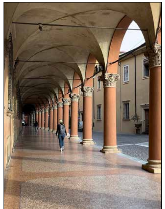
MADE IN THE SHADE: the city's porticoes are a delight all year round - but especially in high summer

amenities skillfully out the midday heat, and fused onto the original lush oversized furnishings. We found it comfortable and surprisingly quiet, given the riot of humanity outdoor draperies to keep CONT:/