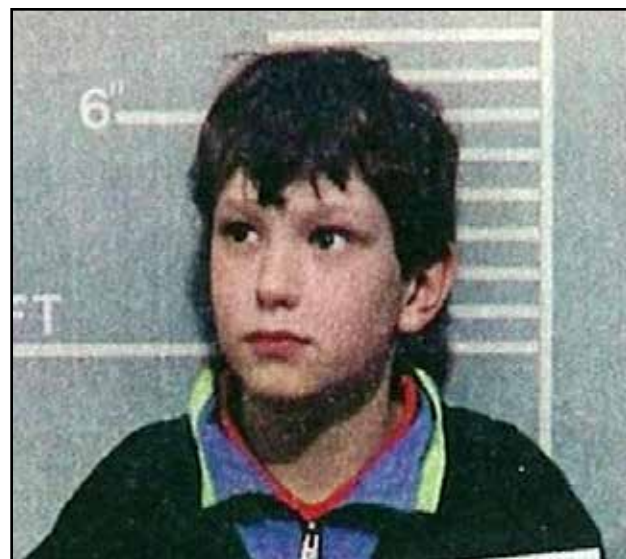
Venables: last refused parole in 2020

images of children – the first time in 2010.