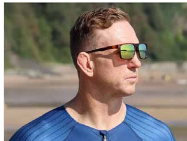
POPHAM: diagnosed with early onset dementia

World Rugby guidelines limit contact training to 15 minutes per week,