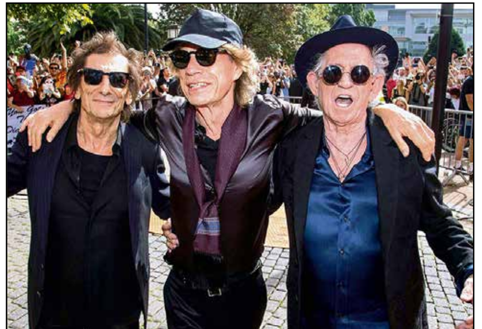
ROCK OF AGES: Ronnie Wood, Sir Mick Jagger and Keith Richards announced the album on Wednesday at an event in Hackney.

Outside, pressed against the barriers, fans came from just as far afield - waving banners and clutching albums in the hope Sir Mick's brought a Sharpie.