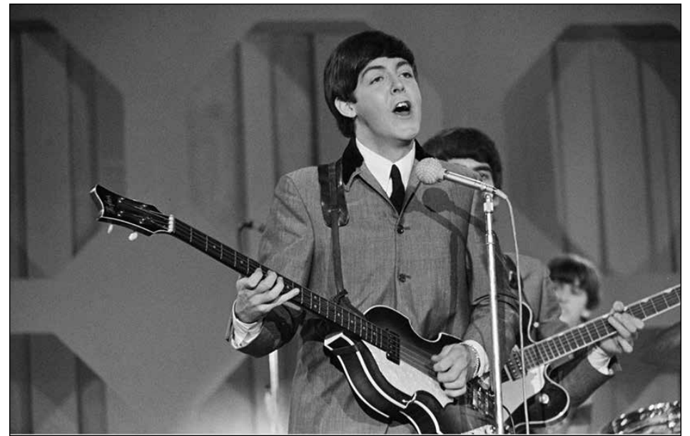
TOMORROW I'LL MISS YOU: The Beatles perform at the Deauville Hotel, Miami Beach, for the Ed Sullivan Show in 1964, with Paul playing the Hofner bass

guitar from 1961 to 1963, playing live and recording some of the band's biggest hits in Hamburg and at Liverpool's Cavern club before being put to one side.