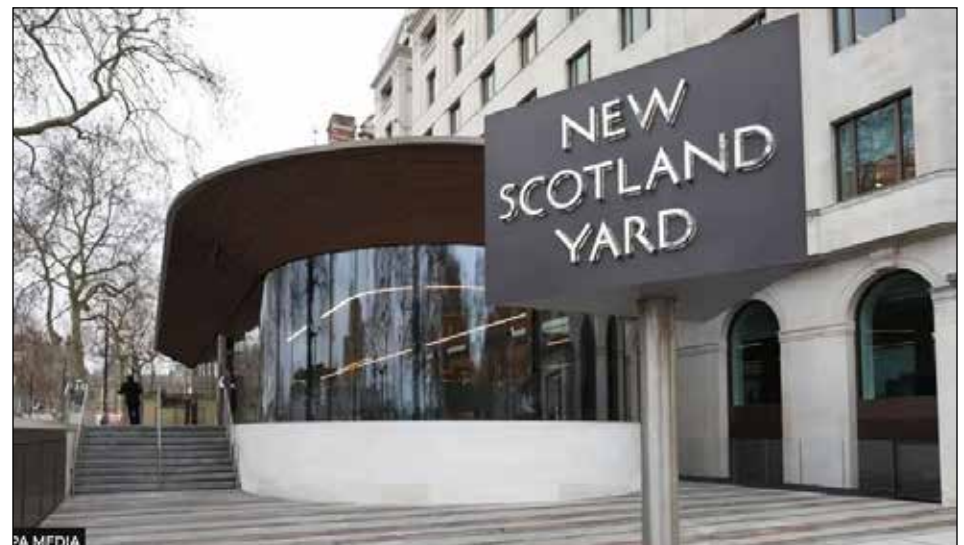
A referral has been made to the Independent Office For Police Conduct in the case

"The arrest of a serving police officer on suspicion of such serious offences is extremely concerning and I recognise will cause considerable