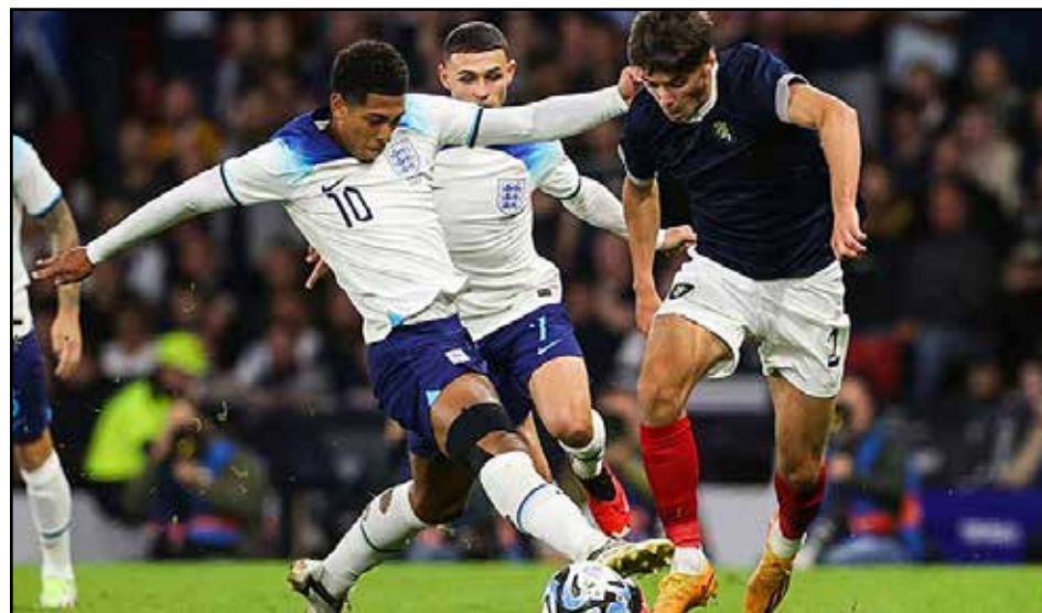
HEY JUDE: Bellingham made it better for England Tuesday night

Top of their European Championship qualifying group with five wins from five and facing an England team held by Ukraine on Saturday, head coach Steve Clarke spoke pre-match about the desire to