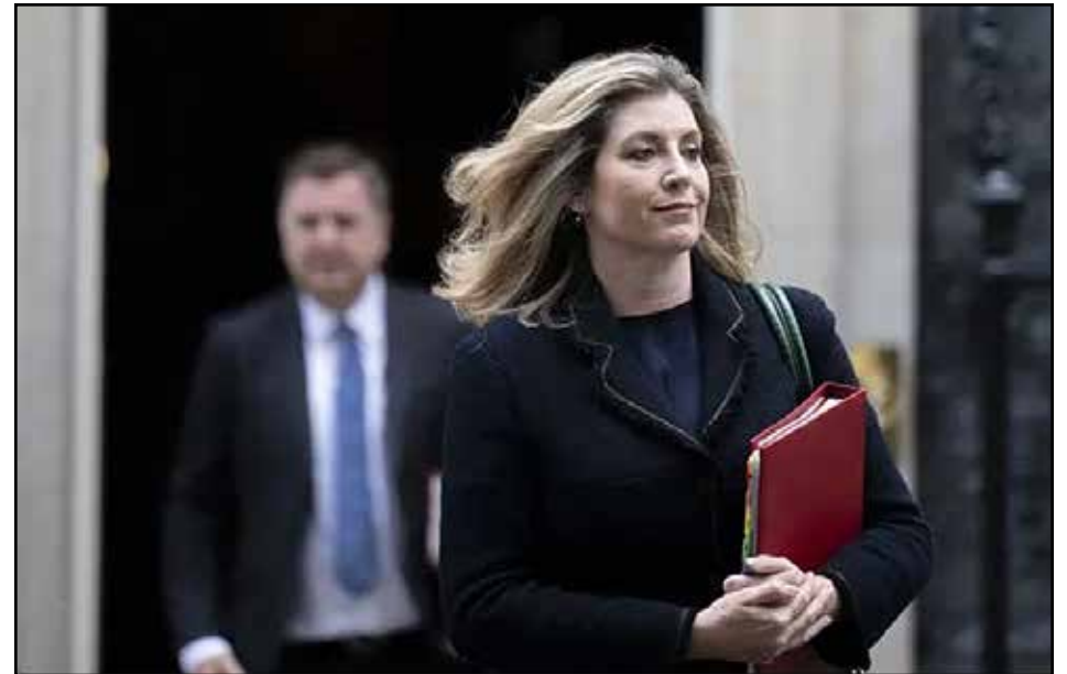
Penny Mordaunt has gained a reputation for her unparliamentary language

"They are a party of goal-hangers and the