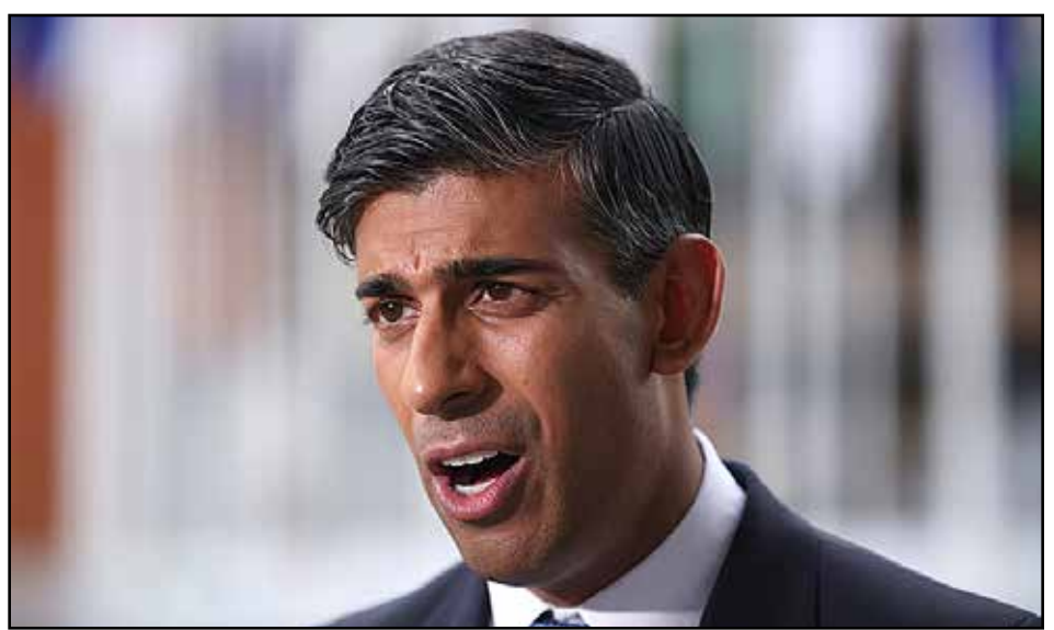
Sunak insisted he had been "emphatic" with Chinese Premier Li Qiang recently that undermining British democracy "will never be tolerated."

Tory MP and former Cabinet minister Iain Duncan Smith, one of nine British citizens sanctioned by China in 2021, suggested there is an essential confusion over