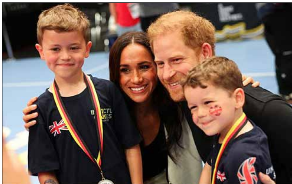
The Sussexes with two child competitors at the Games in Germany