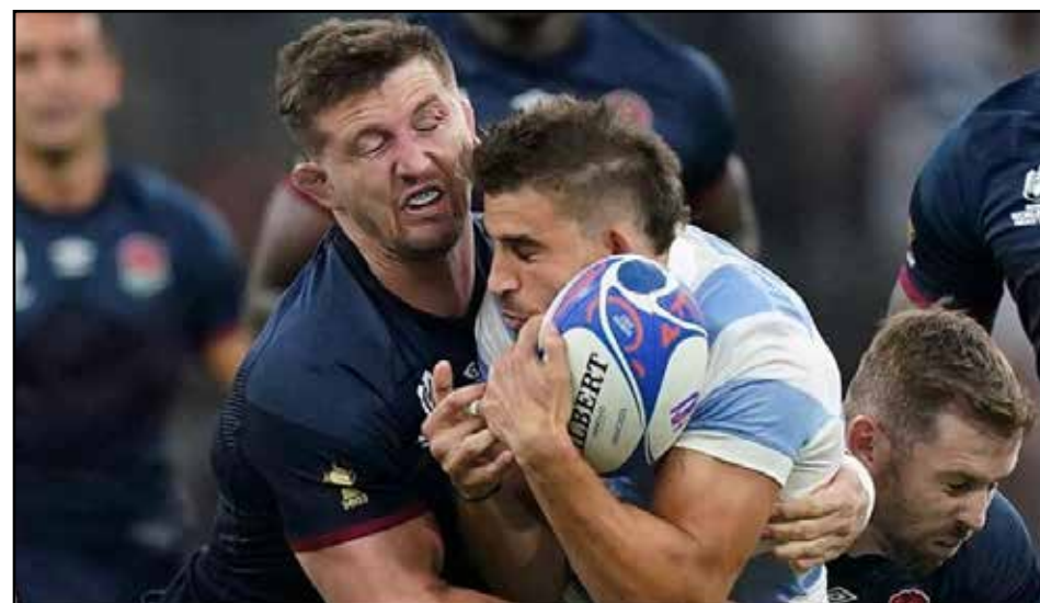
BRUISING ENCOUNTER: despite being a man down for most of the match, England overpowered Argentina in Marseille