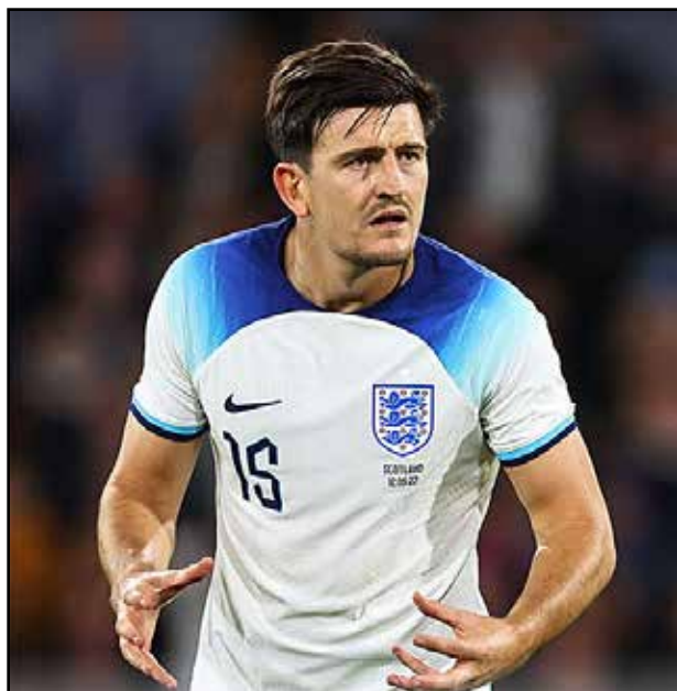
EASY TARGET: Harry Maguire scored an own goal

amount of responsibility and everything that comes with it—a lot of bad as well as good. It was a hostile environment at Hampden and they piled pressure on me. I would not say I am 'used to it' but I can deal with it."