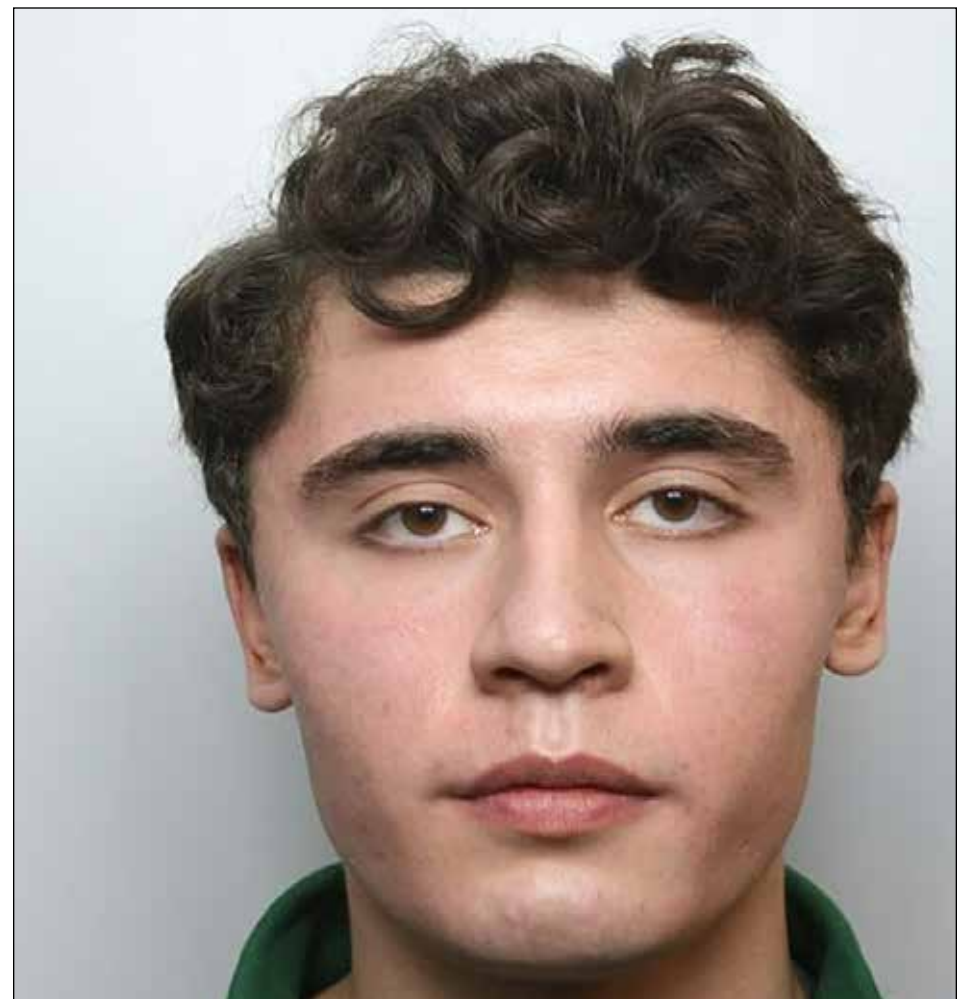
Daniel Khalife: daring escape from Wandsworth Prison

T-shirt and dark shorts, handcuffed sitting on a dusty path alongside the water at Greenford, West London, just 12 miles from Wandsworth Prison.