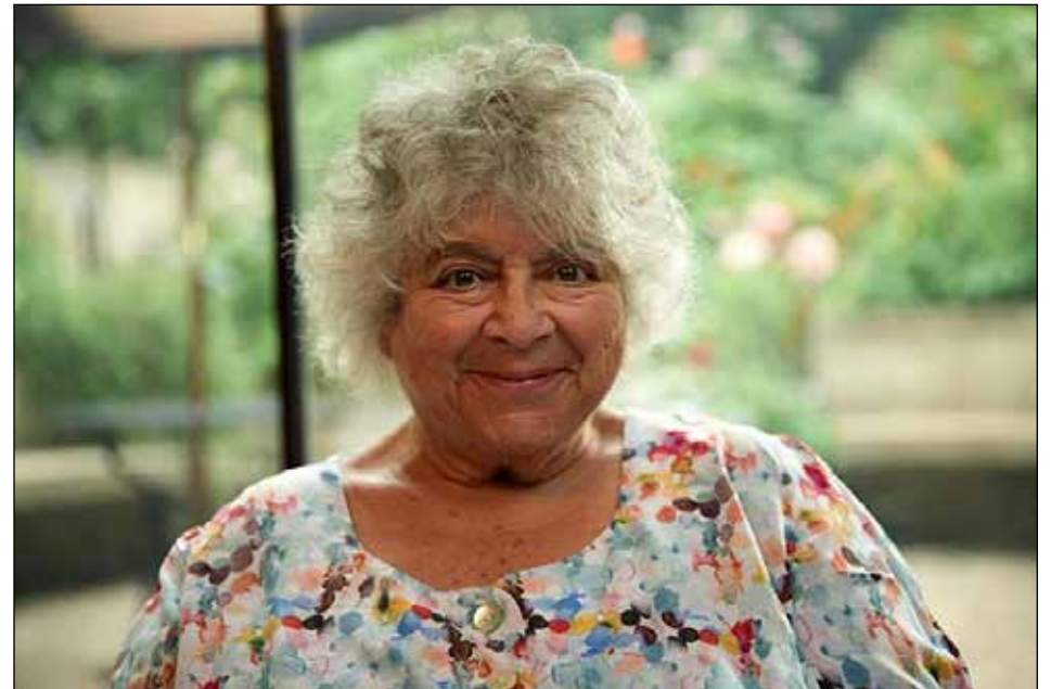
'VIOLENCE AND VANDALISM': the veteran actress gave callers to ITV's popular This Morning show unusual suggestions for their problems.

Miriam defended herself, explaining that she only mouthed the world and didn't