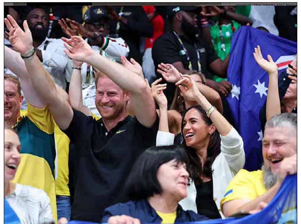
CAUGHT UP IN THE WAVE: Harry and Meghan get into the Invictus spirit

Last week, electric vehicle production also began at the Stellantis factory in Ellesmere Port, Cheshire, after a £100million investment. Vans will also be made at the Cheshire site.