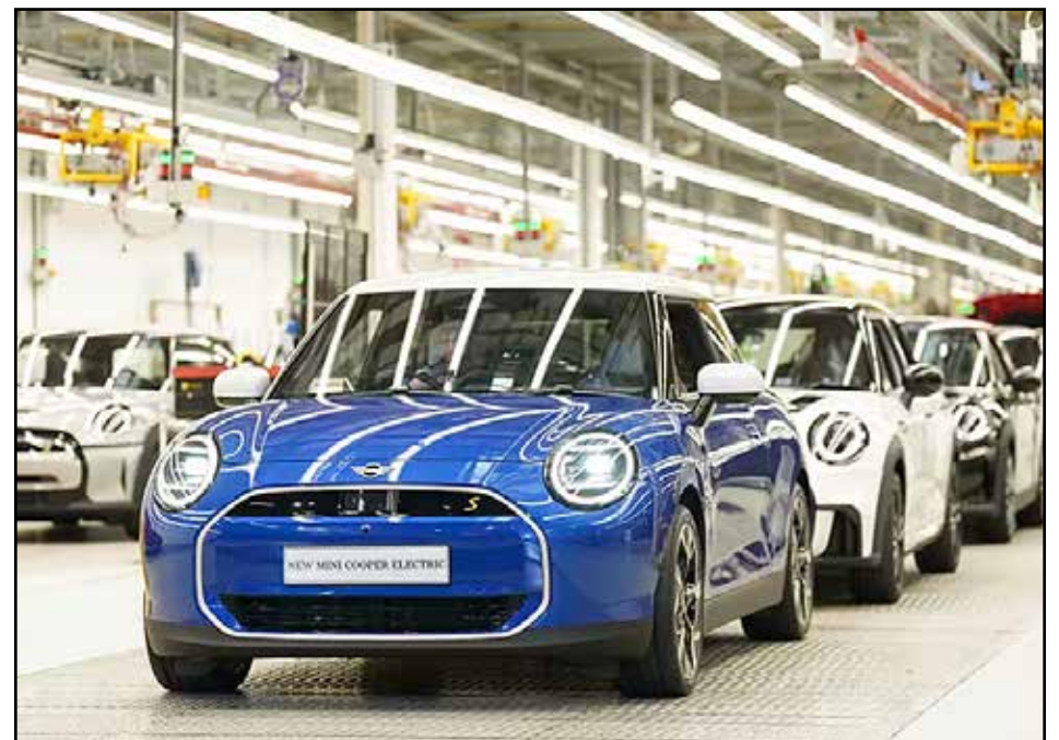
KEEP ROLLING: the investment will secure 4,000 jobs in Oxford and Swindon

She said: "We are proud to be able to support BMW Group's investment, which will secure high-quality jobs,