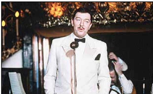
THE ROLE THAT MADE HIM: Gambon in Dennis Potter's classic TV drama, The Singing Detective

in Brecht's The Life of Galileo at the National Theatre in 1980, and as the restaurateur returning to visit a former lover in David Hare's Skylight, which earned him a Tony award nomination on Broadway in the mid-90s.