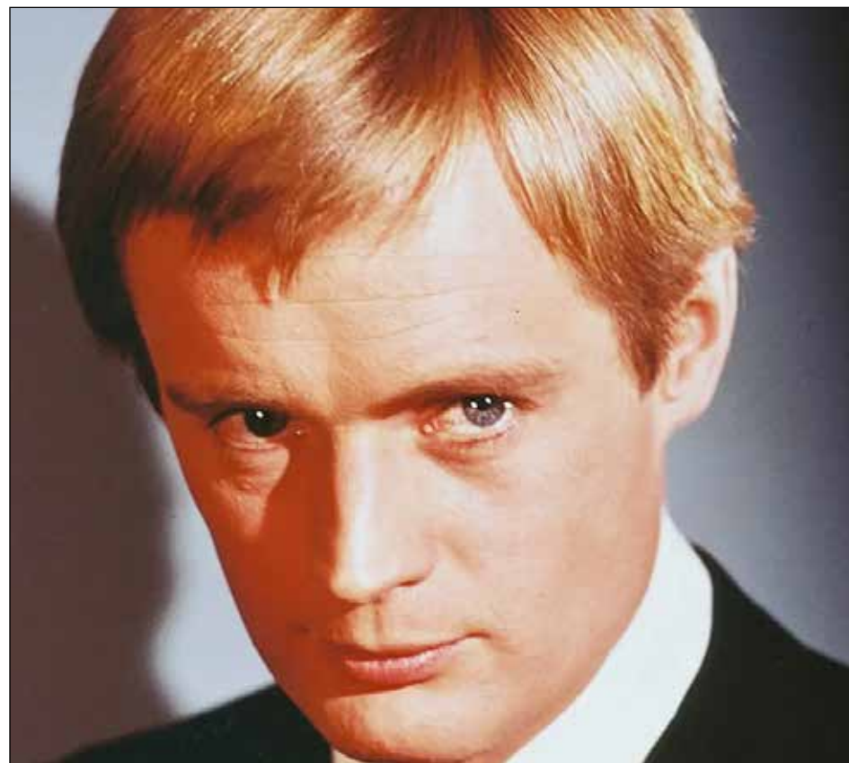
McCallum enjoyed worldwide fame as Ilya Kuriakin

McCallum was seldom off television screens over the next three decades, making the occasional sortie into films. He also did some theatre in New York, where he and his wife had settled, notably Julius Caesar in a Central Park production (2000), playing the title role as "a senile old man, suffering from ideas of grandeur" according to the actor, and in 2003, McCallum began playing Dr Donald Mallard, chief medical examiner, in the TV series NCIS , following the cases of the fictional agents