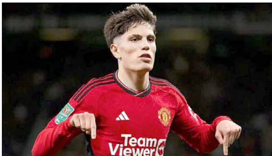
Alejandro Garnacho opened the scoring at Old Trafford Tuesday night

The only downside for Newcastle, with Paris St-Germain to come on Wednesday in the Champions League after Saturday's league visit of Burnley, was Isak departing the game on the hour with an injury.