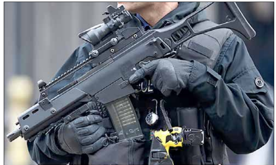
Only about one in 10 of London's 30,000 policemen carry a gun

Earlier on Monday, the Met said senior officers were having "ongoing discussions" to support staff to fully understand