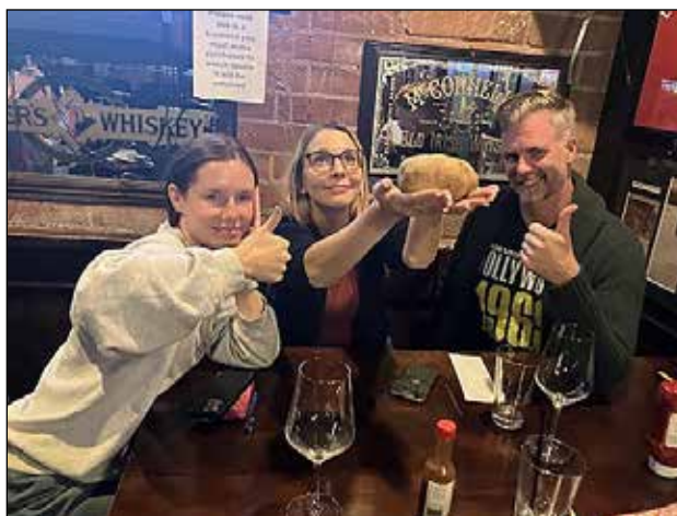
WELL TRAINED: HS Poo celebrate their second place potato