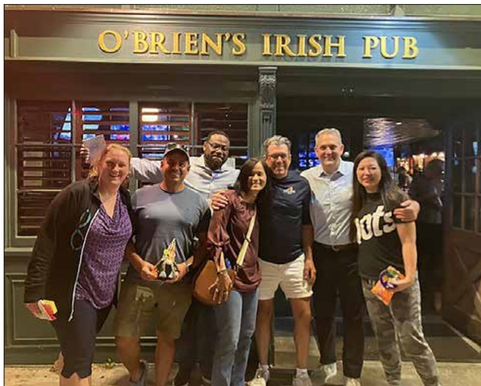
SCRUM-TIOUS WINNERS: The Rogue Ruggers milk their victory