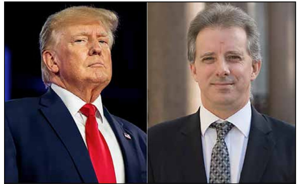
SEQUEL: a two day hearing on Trump's suit against Steele is set for October

Trump has been criminally indicted four times, including in a