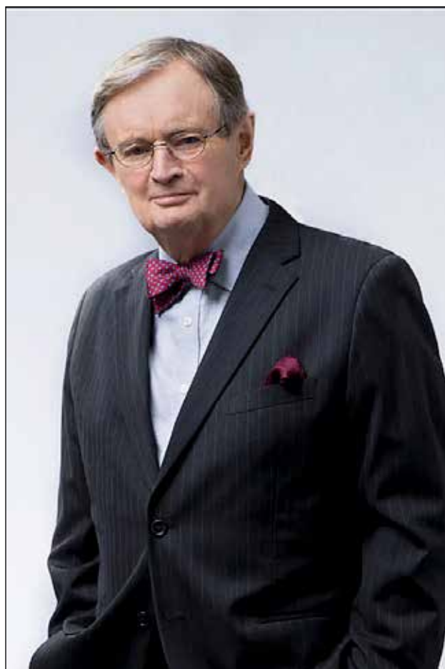
STABLE EMPLOYMENT: McCallum played Dr "Ducky" Mallard on NCIS for twenty seasons