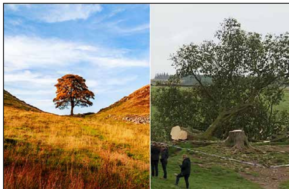
SHOCK, SADNESS AND ANGER: the famous Northumberland tree in its glory, and (right) the sad sight following its felling this week

"Sycamore Gap was voted English tree of the year in 2016 in the Woodland Trust's awards and is much-loved by people from across the world. Northumberland