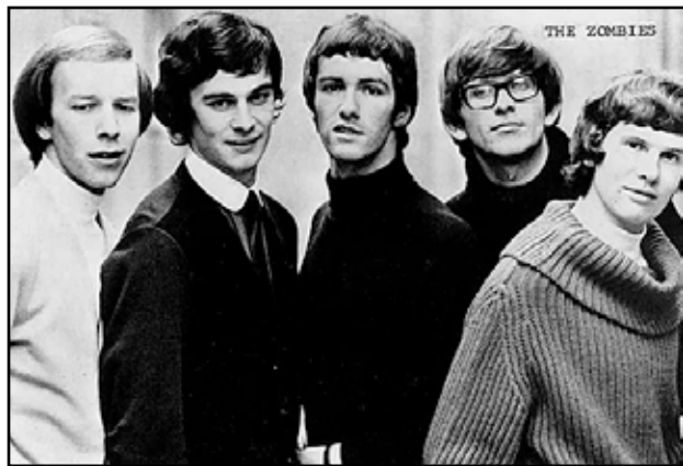
AS THEY WERE: The Zombies in their heyday

For more information go to thezombiesmusic.com/tour