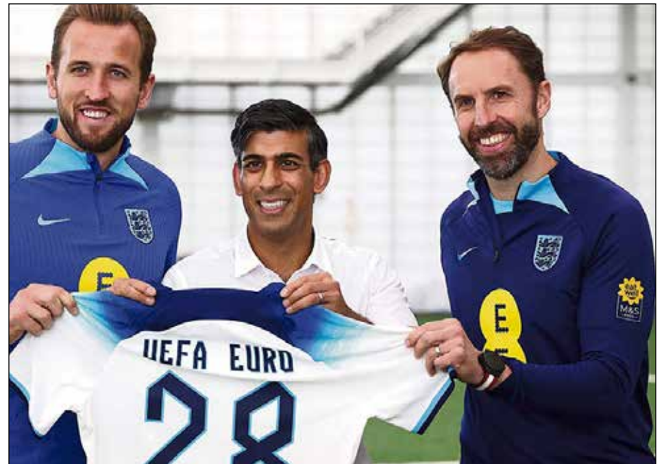
Harry Kane, Rishi Sunak and Gareth Southgate were among those celebrating the success of the UK and Ireland bid to host the Euro 2028 tournament

Savoring UEFA's decision, which was a certainty ever since Turkey withdrew from bidding for the event earlier this month, Ms Frazer said: "Few countries in the world can rival the UK's track record of hosting major sporting occasions and