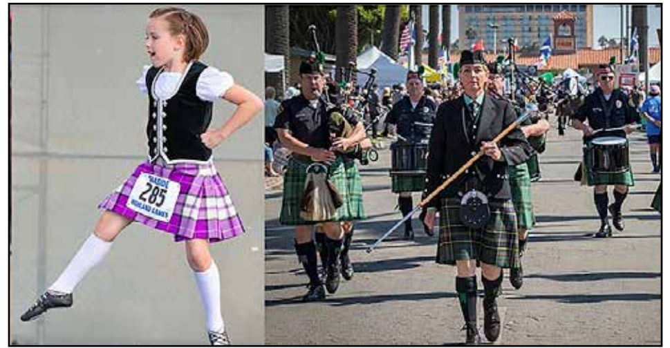
Highland Dancing and Pipes & Drums are just part of the fun to be had....

Highland Games in Ventura, (Oct 14 & 15) and their New Members Reception at the Tam O'Shanter (Oct 28) in Los Feliz. The Saint Andrews society has long been known as the premier source of Scottish culture in all of Southern California, so for those contemplating joining next week's Highland Games are the perfect opportunity to meet and enjoy others who share