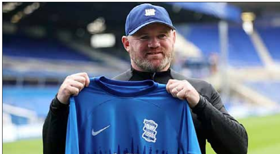
Rooney has agreed a deal with Birmingham City until 2027

Confusion reigned and the debate about that whole process will linger unless and until Scotland have booked their place in Germany.