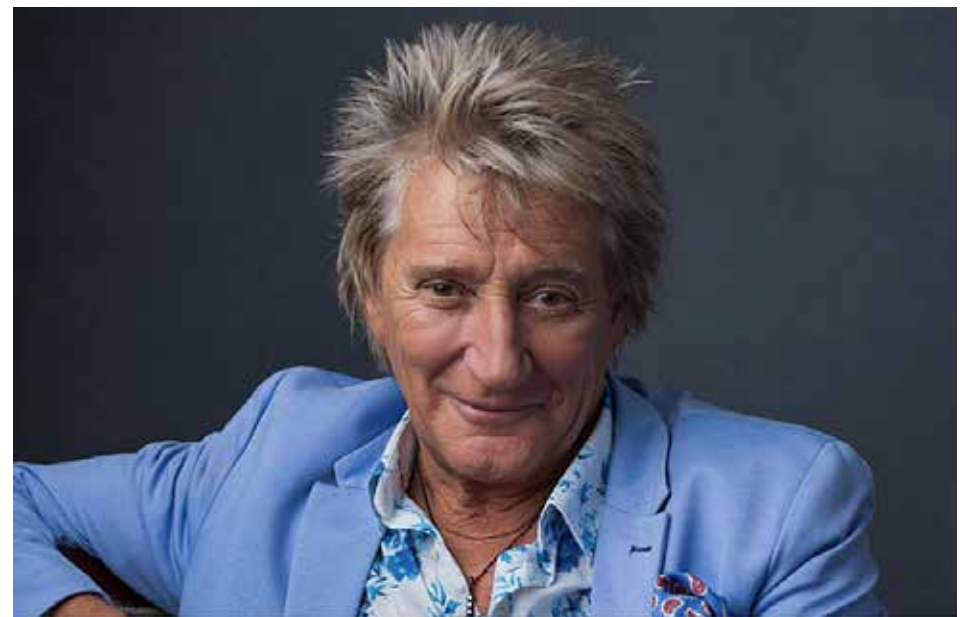
STEWART: “I’m grateful that I have a choice whether or not to perform in Saudi Arabia.”

A source close to the rocker said that he had used his “moral compass in making the decision”.