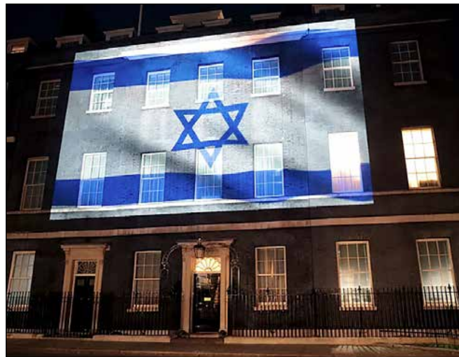
UNITY: the Israeli flag projected onto 10 Downing Street on Monday night

He also visited the Jerusalem grave of his grandmother, Princess Alice, who offered