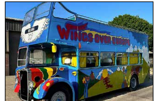
Fare price?: the bus is expected to fetch $300,000