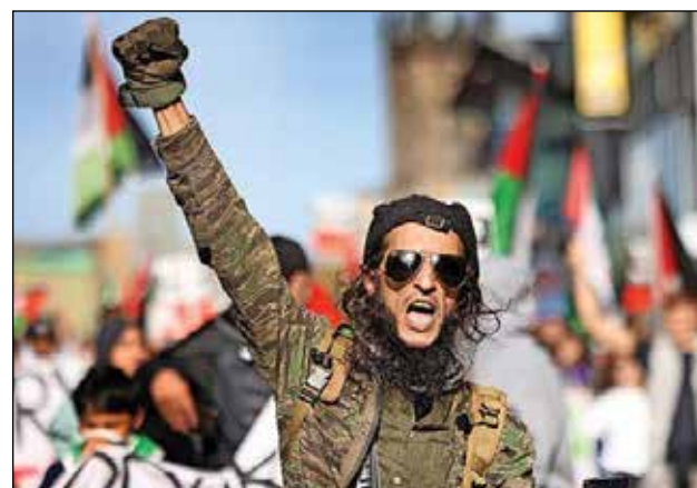
SIGN OF THE TIMES: a demonstrator in Manchester

The letter, signed by a dozen Cabinet ministers, said: “We welcome the UK’s strong condemnation of Hamas’s barbaric attack and pledge to protect the UK’s vibrant Jewish community.”