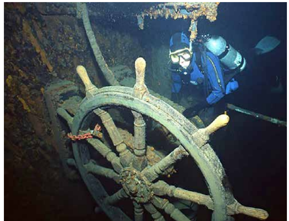
Easy to plunder: the UK coastline is home to an estimated 37,000 shipwrecks

Forensic markers will be applied to some of