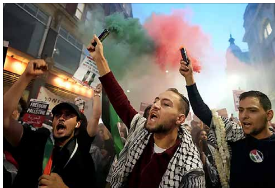
Flares and cheers: pro-Palestinian demonstrators in West London on Saturday

No10 projected an image of the Israeli flag on Downing Street, saying Rishi Sunak had spoken to Israeli premier Benjamin Netanyahu. “He reaffirmed that the UK will stand with Israel unequivocally against these acts of terror.” The PM had offered any