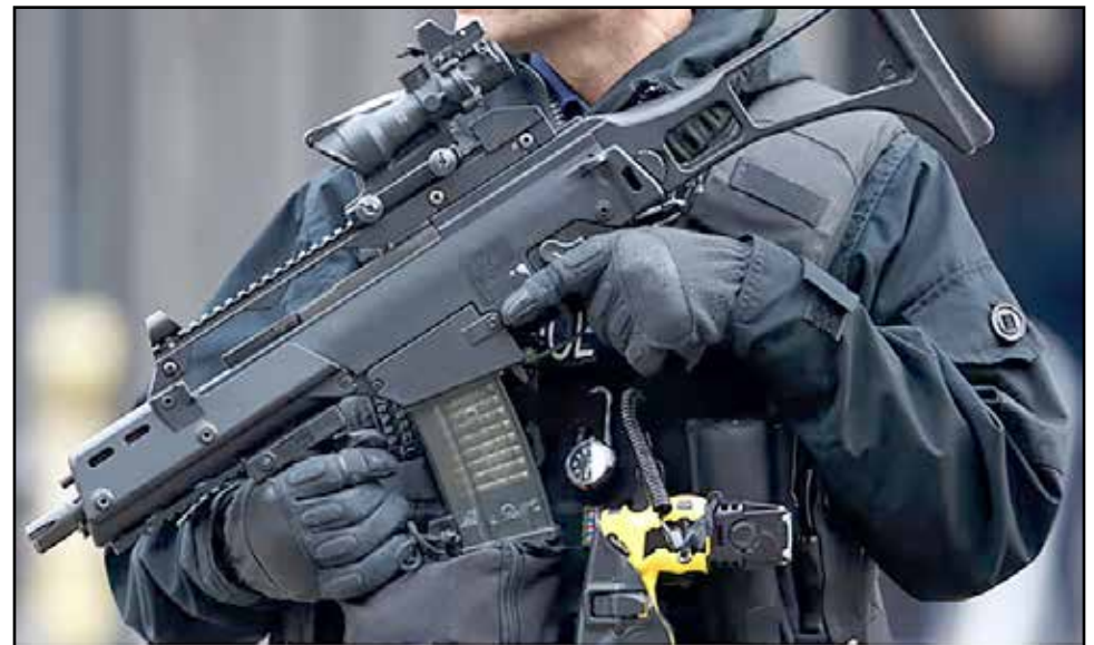
FEELING THE HEAT: Hundreds of cops downed weapons last month

It emerged last week that armed officers who chose not to carry guns said that they had been “bullied, intimidated and given career ultimatums”.