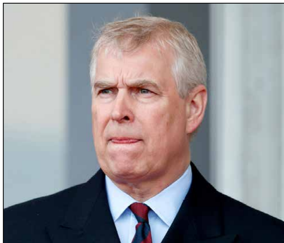
Relations thawing? Charles has extended his brother’s stay at Windsor’s Royal Lodge

Andrew was offered Frogmore Cottage, which had been renovated by the Duke and Duchess of Sussex. But the Prince rejected this and refused to leave Royal Lodge, which he shares with ex-wife Sarah Ferguson despite them divorcing