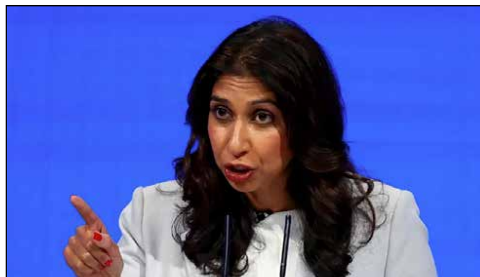
THROWING RED MEAT TO THE BASE: Suella Braverman was addressing the Conservative Party Conference in Manchester this week

She drew cheers for announcing the government would soon