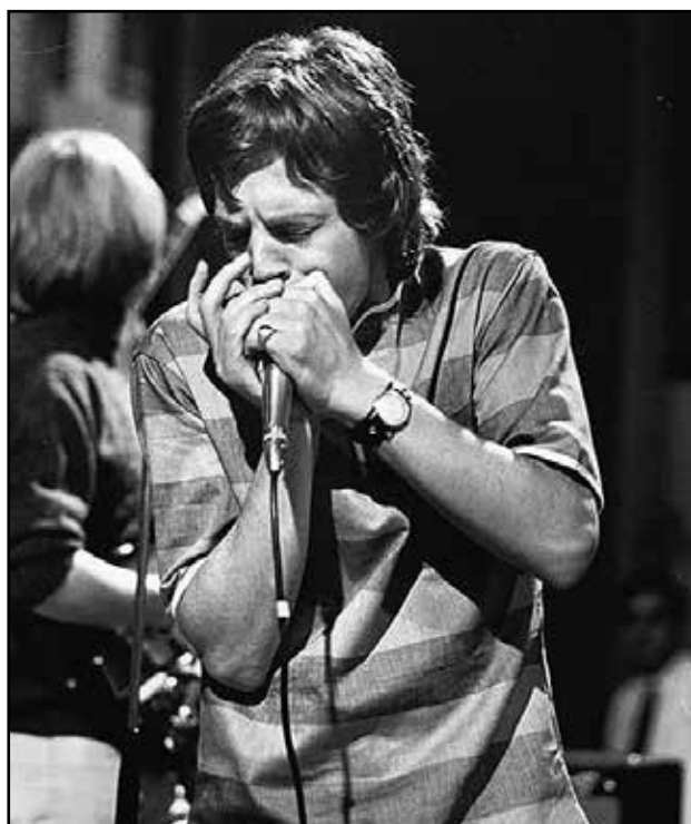
NOT FADE AWAY: 1960s Mick blowing up a storm

More than 123,000 followers have already viewed the new promo. One writes: “I’m 70, been listening as long as