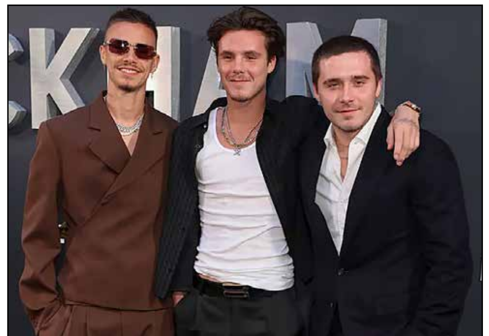
LIKELY LADS: brothers Romeo, Cruz and Brooklyn on the red carpet

HOST AN INTERNATIONAL STUDENT Earn Up To $1,0275 per month GLOBAL STUDENT SERVICES, USA, INC gssusa2020@protonmail.com 310-612-7663