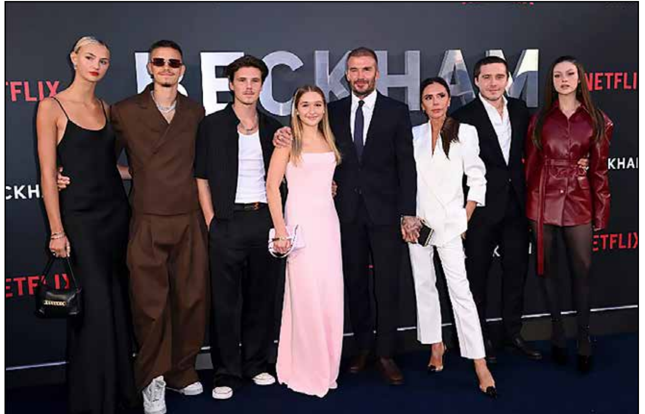
Victoria and David arrive at the event (above left) and (above) Mia Regan, Romeo, Cruz, Harper, David, Victoria, Brooklyn and Nicola Peltz Beckham