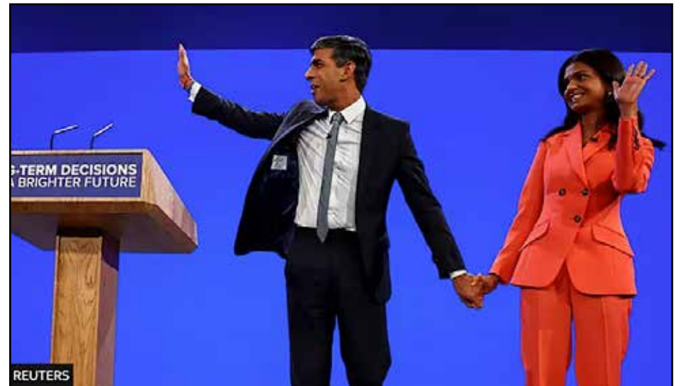
HE GIVETH AND HE TAKETH AWAY: Rishi Sunak, pictured with his wife Akshata Narayana Murty, was attempting to relaunch his Premiership at the Tory Party Conference this week. He trails Labour by double digits in the polls

the Conservative MP for Shipley, said: "Everybody knew that HS2 had become an embarrassing white elephant and that the never-ending sums dedicated to it could be much better spent on transport infrastructure projects across the North, but no political leader would dare say it. Rishi Sunak is the Prime Minister who was prepared to say these things and then deal with them.