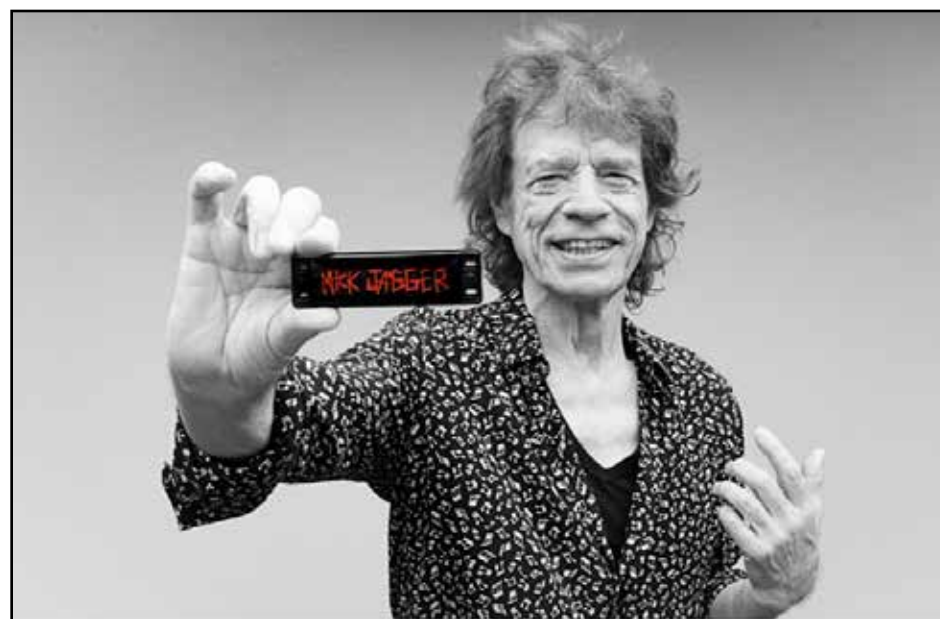
Mick Jagger’s website describes the harmonica (below) as ‘meticulously designed’ which ‘faithfully replicates the exact specifications used by Mick Jagger throughout his iconic career.’