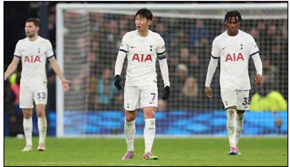
Tottenham are the first side in Premier League history to score the first goal in five successive matches without winning any of them

Tottenham made a brilliant start to the Premier League season, winning eight of their