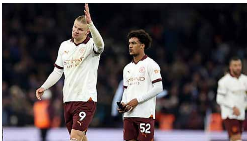
Manchester City were the latest team to fall to Unai Emery's high-flying team

ASTON VILLA carved out a magnificent victory over Manchester City in midweek to move above the defending Premier League champions, and moments before the final whistle, a roar swept around the club's famous old stadium. It was the sound of something special stirring under manager Unai Emery.