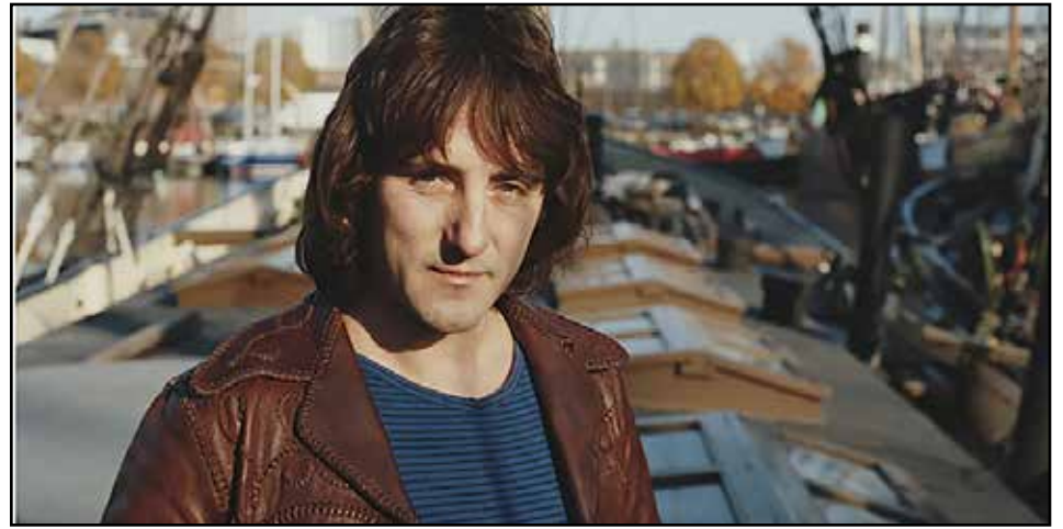
Denny Laine: "a great talent with a fine sense of humour.."

In a statement posted to social media, McCartney remembered his late bandmate, noting a mutual respect between the Beatles and the Moody Blues. "We had drifted apart but in recent years managed to reestablish our friendship and share memories of our times together," he wrote. "Denny was a great talent with a fine sense of humour and was always ready to help other people."