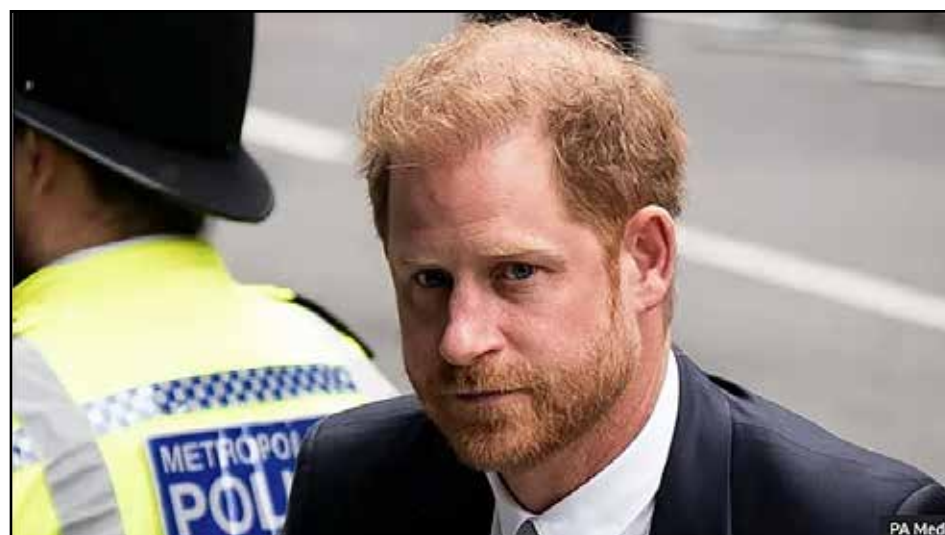
Prince Harry is challenging the fairness of how decisions over his security were made

There was "no good reason for singling out the claimant [Prince Harry] this way," said his legal team.