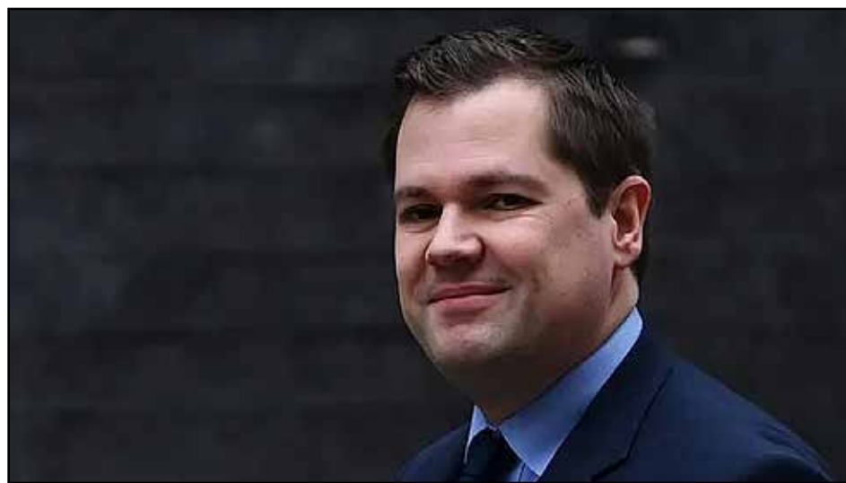
Robert Jenrick described the government's emergency Rwanda legislation as "a triumph of hope over experience".

home secretary Yvette Cooper said: "It is a sign of the total chaos in the Tory party and the complete collapse of Rishi Sunak's leadership that even while he is sitting in the Commons for the announcement of his new Rwanda plan, his own immigration minister is resigning because he doesn't think it will work."