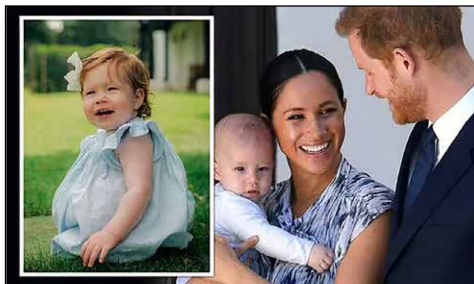
Harry and his family at home in California