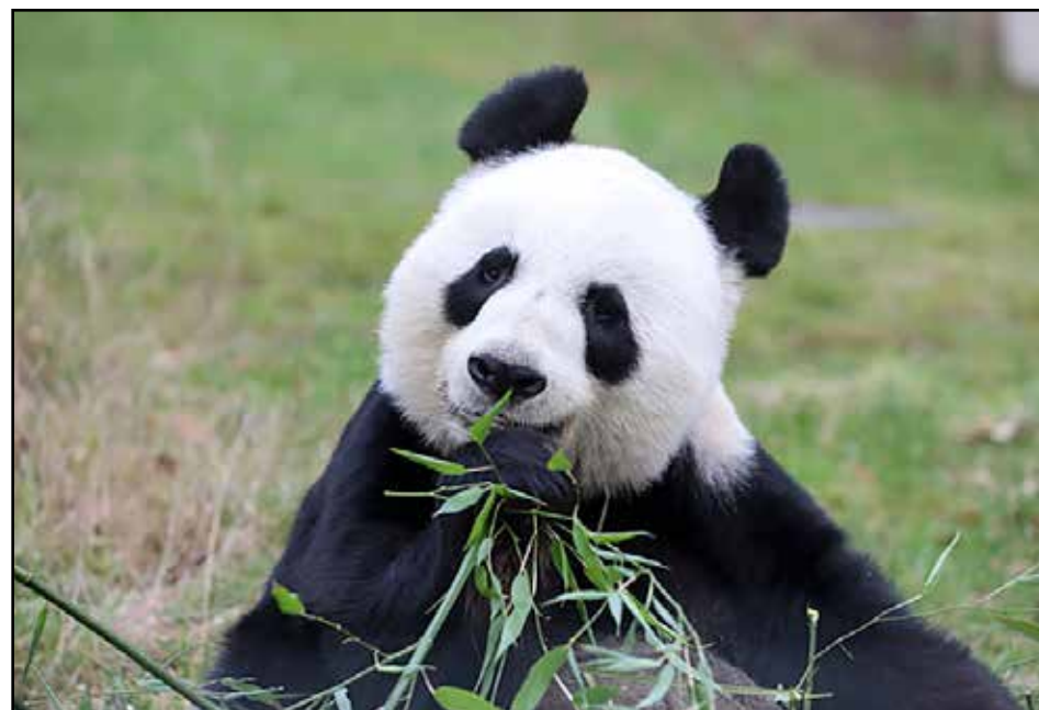
Sadly, the giant pandas just couldn't make the romance happen

The zoo and veterinary surgeons from China made eight attempts at artificial insemination between the pair.