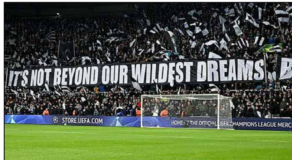
THE SPIRIT WAS WILLING...but the flesh was weak Wednesday night

The Italians looked a shadow of the team who