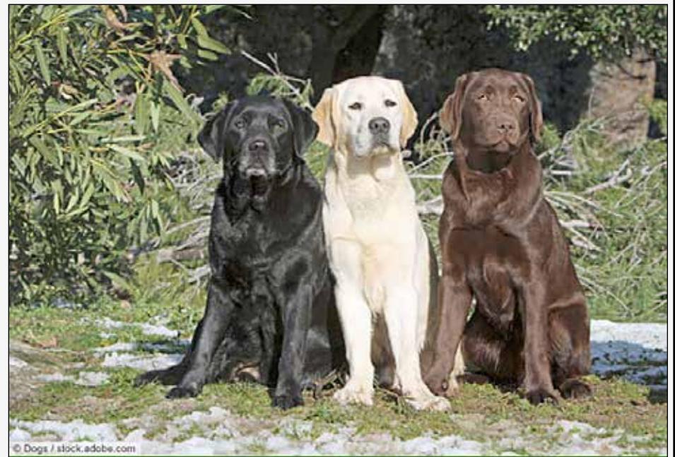
No matter the color, Labrador Retrievers are elegant, classic dogs

Most popular for female dogs was Poppy, followed by Bella and Luna, with Alfie, Charlie and Milo topping the table for males. Willow, Lola, Buddy and Barney were in the top