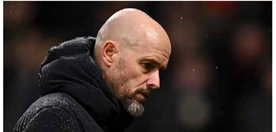
A MAN, HAUNTED: things are going from bad to worse for Erik ten Hag

Stam said: "He has got to be worried and thinking about what's going to happen now because you can ban players. But it's also about man management of course and how to work with and handle players. There was the [Cristiano] Ronaldo thing, the [Jadon] Sancho thing, Raphael Varane probably – I don't know