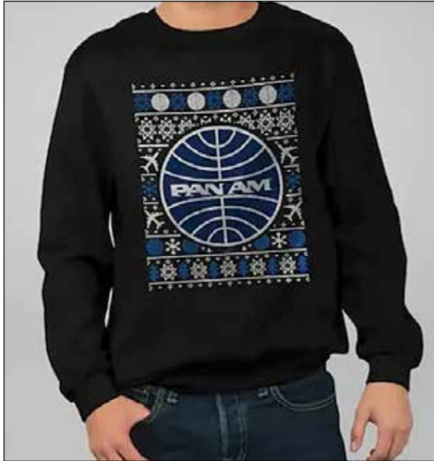
HASTILY WITHDRAWN: the offending sweater