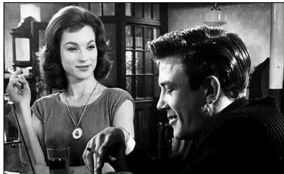
RADIANT BEAUTY: Shirley Anne Field as Doreen and Albert Finney as Arthur Seaton in Saturday Night and Sunday Morning , 1960

Born in Forest Gate, East London, on June 27,