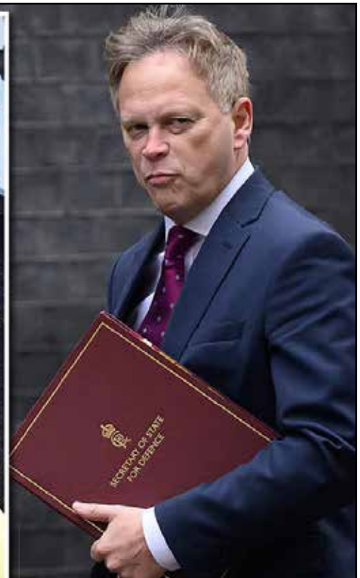
LUVVIE vs TORY: Gary Lineker and Grant Shapps are at loggerheads

committee that Lineker was not in breach of guidelines by signing a letter calling for the Government to scrap the Rwanda scheme. But he did not think the row “was very helpful, either for Gary Lineker or the BBC”.