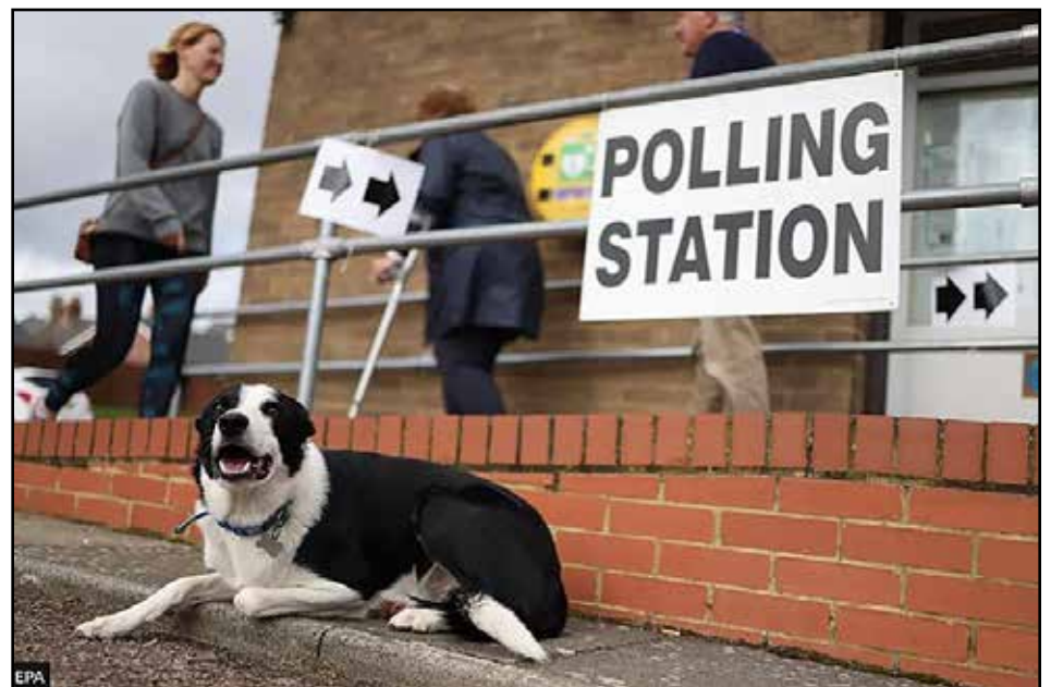
NO NEED TO WAIT: now you can register and vote online in UK elections

During debate of the Election Act in Parliament in 2022, Labour objected to the change, with shadow minister Alex Norris arguing that "wealthy