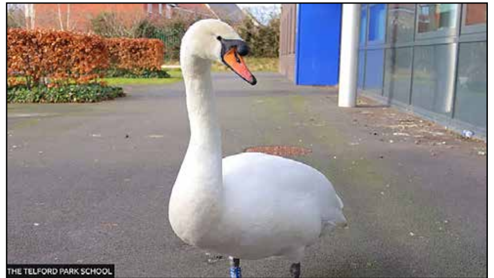
Sally has visited The Telford Park School every day for more than a year.... using a zebra crossing to get there.

Sally by the locals, is well-known in the Stirchley suburb, where the school is located, and where it is seen waddling from the Mad Brooke pool to the school gates, before returning to home after spending the day outside the building.