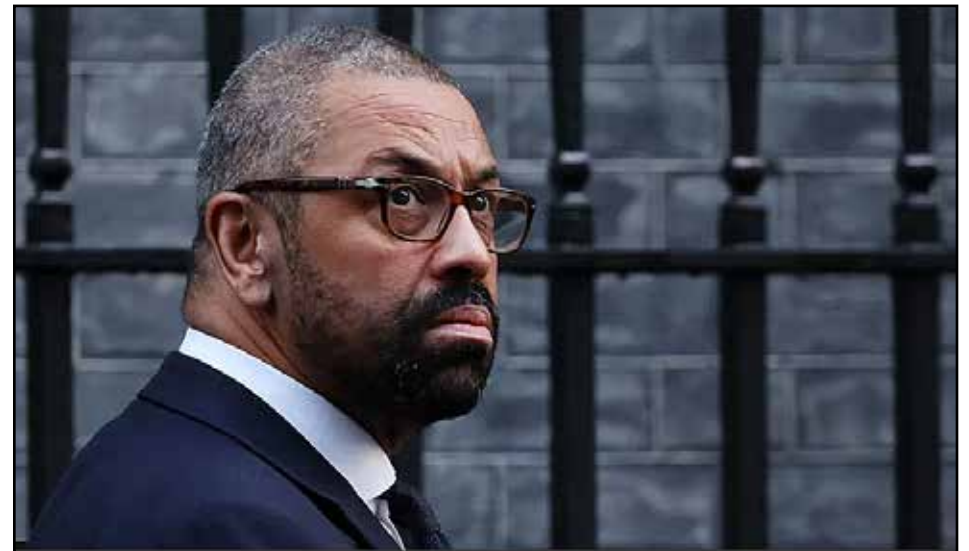
James Cleverly said Hizb ut-Tahrir "actively promotes and encourages terrorism"

that since the 7 October attacks, Hizb ut-Tahrir has described Hamas fighters as "heroes" on its central website - and such praise amounts to promoting and encouraging terrorism.