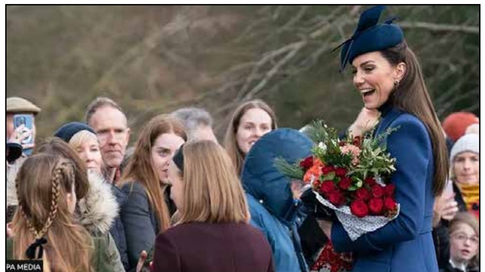
Kate and Charles BOTH hospitalized - page 3

donors who have not easier to contribute". more details can be lived in the UK for For local readers found at gov.uk/decades will find it wishing to register, register-to-vote.