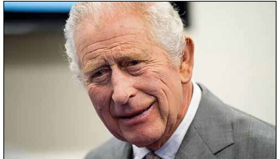
The Palace said the King was keen to share his diagnosis with the public to encourage other men who may be experiencing symptoms to get checked.

Around one in three men over the age of 50 will have some symptoms of an enlarged prostate, which is a gland that sits just below the bladder.