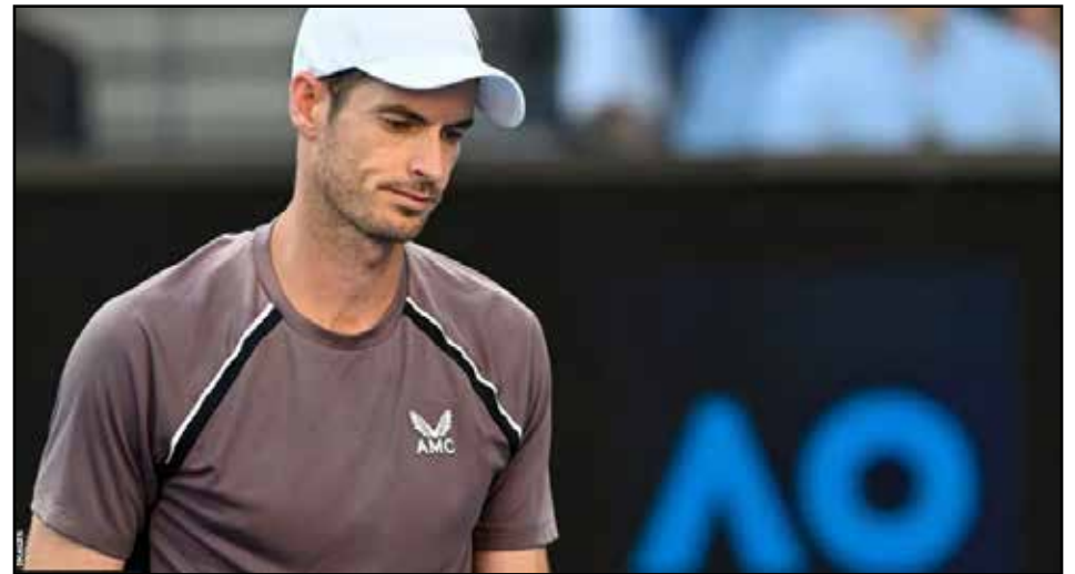
IS THIS THE END? Andy Murray's body language following his first round defeat in the Australian Open would certainly suggest so...

"When you're one point away from the end, you're like, 'I can't believe this is over so quickly, and like this'.