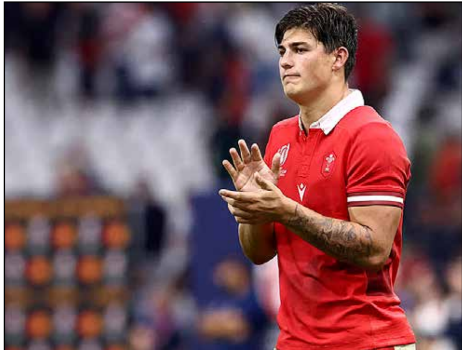
LONG SHOT: Louis Rees-Zammit has his heart set on an NFL career

"There is never a dull moment in Welsh rugby, and this was thrown at us an hour or so ago. Louis had an approach on Sunday, things moved very quickly and the paperwork was all agreed to allow Gloucester to release him. He was outstanding for us at the World Cup. He rang me at about 12.30pm to thank me for