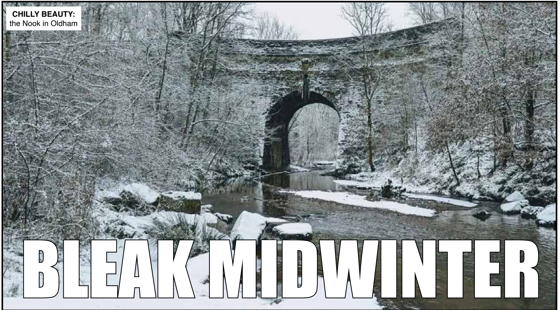
CHILLY BEAUTY: the Nook in Oldham