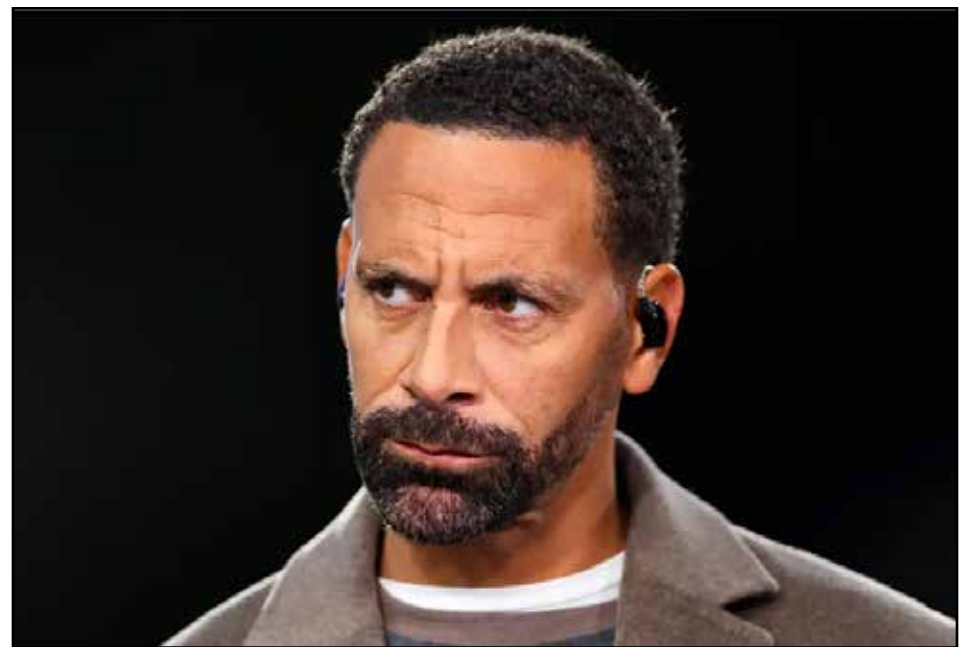
Rio Ferdinand says the problem at United is "...the framework of the club, the structure behind the scenes."

Ferdinand believes Ten Hag remains the right man to manage United