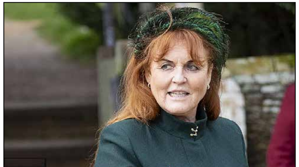
FERGIE: two cancer diagnoses within the past six months

reinvention, she made guest appearances as a presenter on ITV's This Morning, in a working life that has also seen her become a successful author.