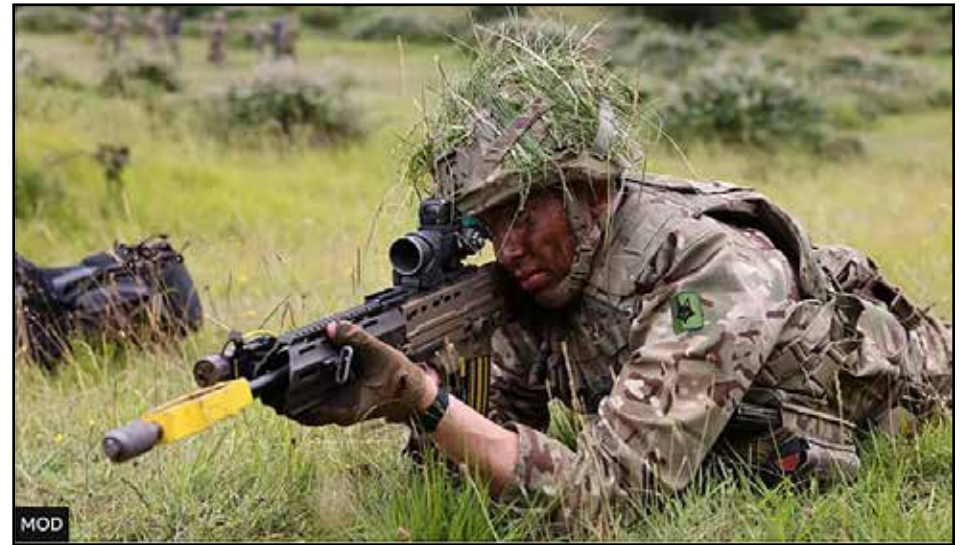
The British Army has shrunk to just 73,000 in recent years