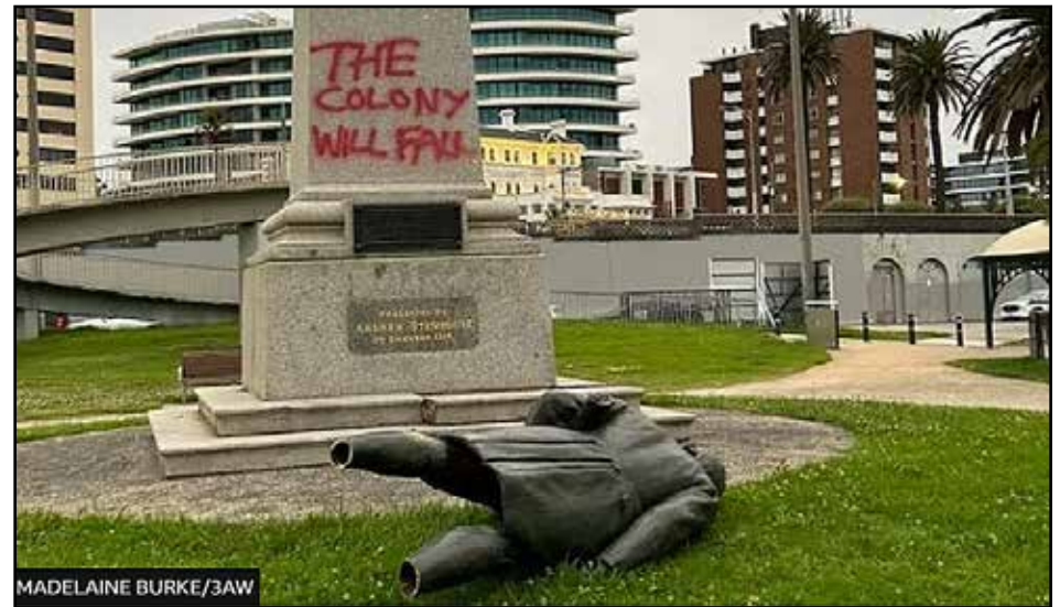
The 1914 monument has a history of being vandalized around January 26

Victorian Premier Jacinta Allan said the vandalism of both monuments had "no place in our community".