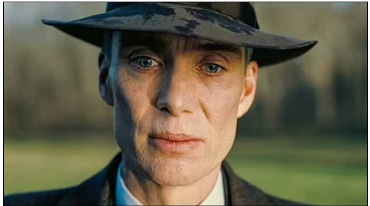
IT'S DA BOMB: Cillian Murphy (above) is nominated for Best Actor, while Emily Blunt (below) is also in the running for Best Support Actress for her role as Kitty Oppenheimer

actress Emily has been nominated for Oppenheimer as the title character's wife, Katherine 'Kitty' Oppenheimer, in Best Supporting Actress.