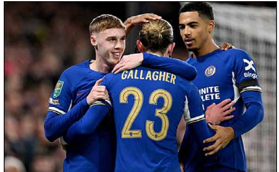
DYNAMIC DUO: Cole Palmer and Conor Gallagher both shined For Chelsea