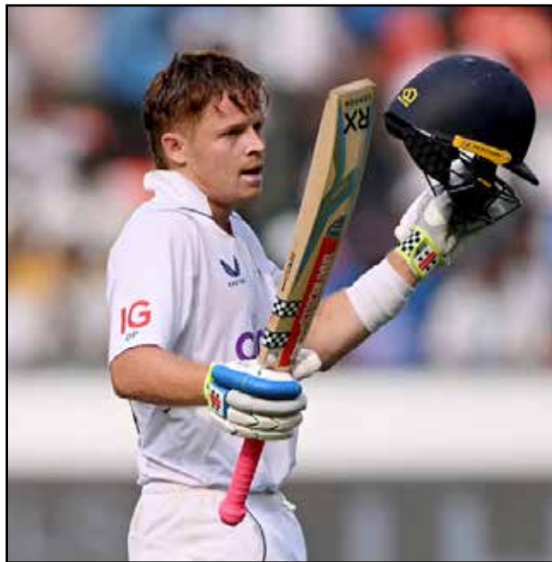
OLLIE POPE: match-winning 196 in Hyderabad

Pope was unbeaten on 148 overnight and added another 48 before he was last man out. He perished in fitting style, attempting to reach a deserved double century with an over-the-shoulder ramp, only