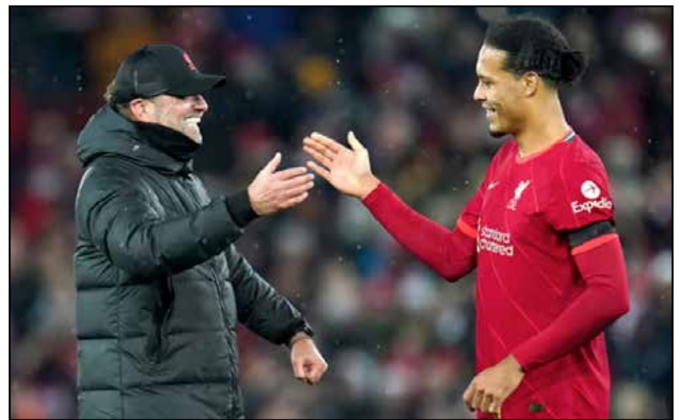
TIGHT BOND: Klopp and Van Dijk share a strong mutual respect