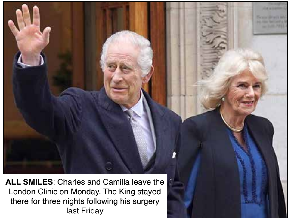
ALL SMILES: Charles and Camilla leave the London Clinic on Monday. The King stayed there for three nights following his surgery last Friday

hospital donor Sir Gerald Ronson asked after the King's health.