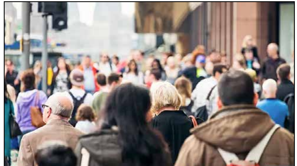
CROWDED ISLAND: the UK's population is expected to reach 74m by 2036

minimum salary required for those arriving on skilled worker visas will rise from £26,200 to £38,700 on 4 April.