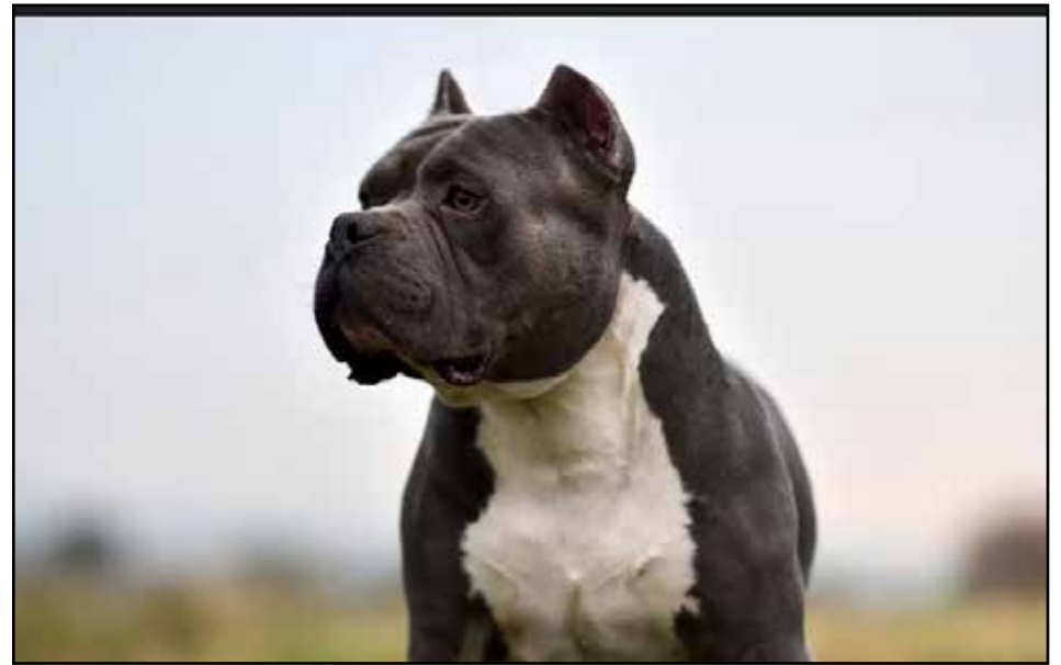
NO MESSING AROUND: the XL Bully is believed to be responsible for at least 20 deaths by mauling in the UK in the past three years