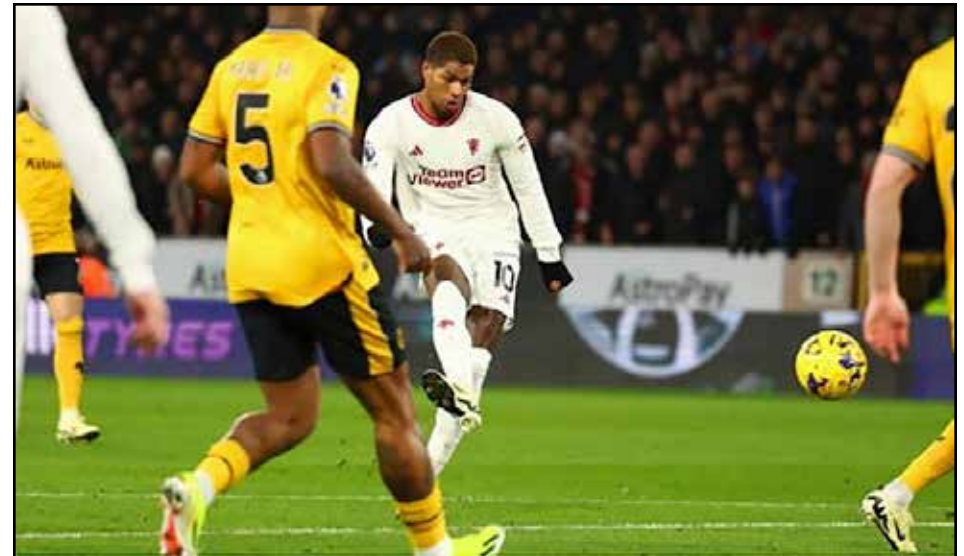
Marcus Rashford opened the scoring for United against Wolves

Erik ten Hag's side move back into the top seven after ending a run of four away league matches without winning and are now eight points