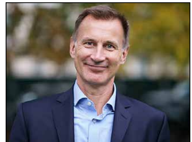
SUNNY OUTLOOK: Chancellor Jeremy Hunt

"It is too early to know whether further reductions in tax will be affordable in the Budget, but we continue to believe that smart tax reductions