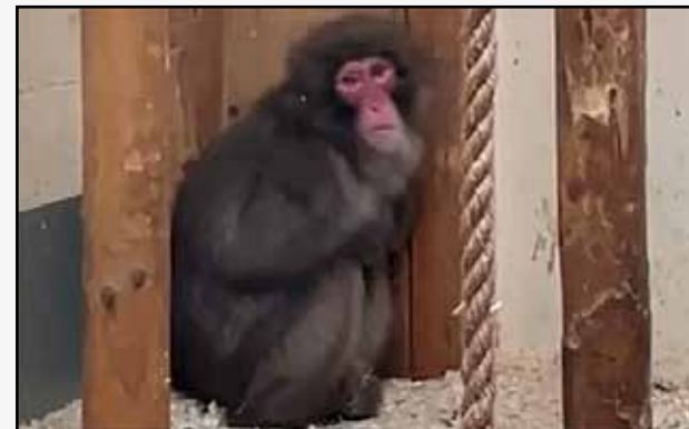
CHEEKY MONKEY: Honshu went walkabout

A drone team observed the animal until he was shot with a tranquiliser dart and taken back to