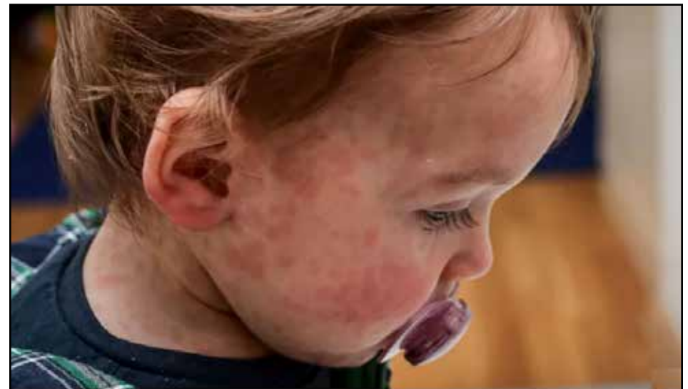
INFECTION HOTSPOT: New figures show 75% of all new measles cases in the past three months have been in the West Midlands

A national incident has been declared by the authorities signalling the