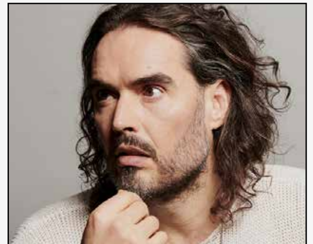
BRAND: "I reject the allegations in the strongest possible terms."

He has been questioned by the Metropolitan Police