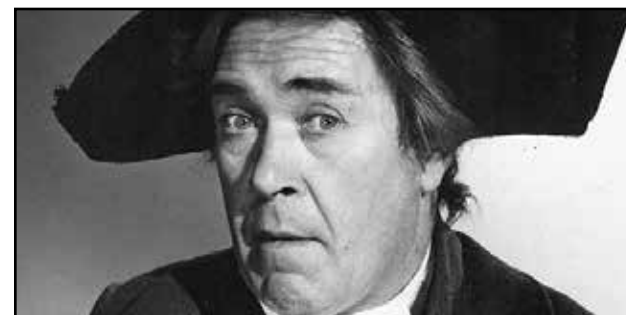
Peter Butterworth played Citizen Bidet in Carry On, Don't Lose Your Head

In the Wooden Horse escape, in which a tunnel was dug underneath a vaulting horse, he was one of the organizing committee. When the story was adapted in 1950 for the big screen, he auditioned for a role but was turned down for not looking sufficiently like a prisoner.