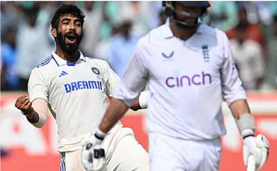
India's man-of-the-match Jasprit Bumrah celebrates the wicket of Ben Stokes

Stokes had been slow out of the blocks for a gettable single, and a direct hit from Shreyas Iyer at midwicket left Stokes an inch short of the line when a dive might