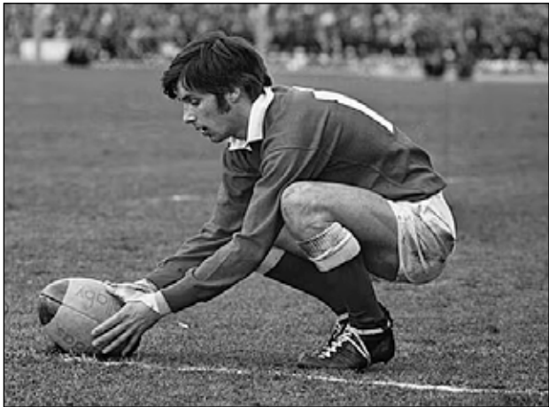
WELSH WIZARD: the great man in action