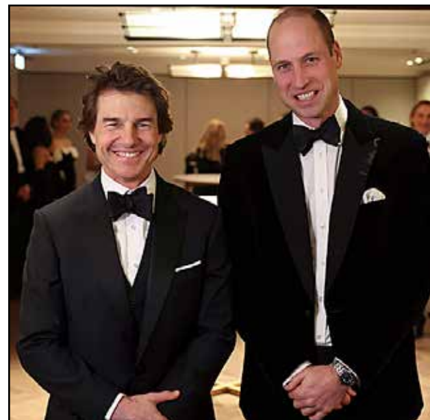
Tom Cruise and Prince William at the London Air Ambulance Charity Gala in London on Wednesday

In 2022 William and Kate attended the UK premiere of Cruise's Top Gun: Maverick film, with the Prince wearing a pair of themed Crockett and Jones velvet slip-on shoes.