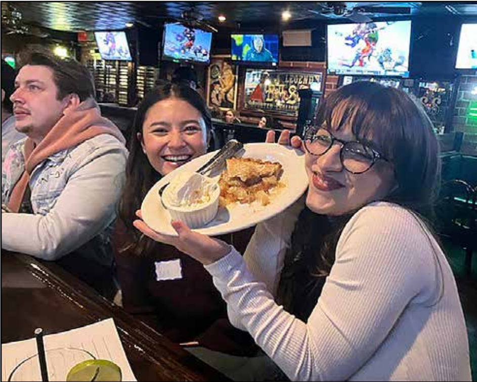
WHO ATE ALL THE APPLE PIE? these contestants devoured the action at O'Brien's in Santa Monica on Tuesday