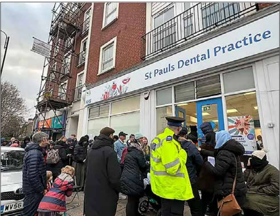
Police were called to keep order as hundreds queued hoping to sign up at the newly-opened dentist’s office in Bristol’s this week

has described as unfit for purpose.” News of the reopening rapidly spread, with hundreds of people seen queuing along the street in a bid to sign up as it reopened nearly nine months on. The practice saw long lines trail down Ashley Court, the road where the dentist is located, and around the block. By Monday evening though, the rolls were full and those in line were advised they would be able to sign up... prompting loud moans of dismay and anger from those in line – some of whom had been waiting for over six hours.