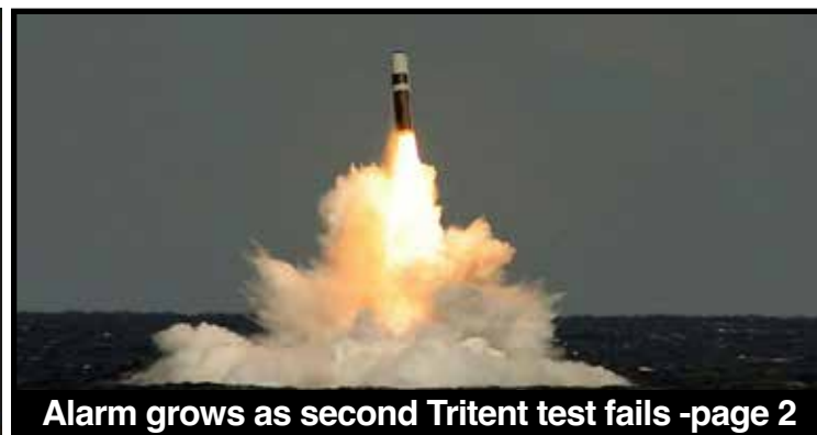
Alarm grows as second Triton test fails -page 2