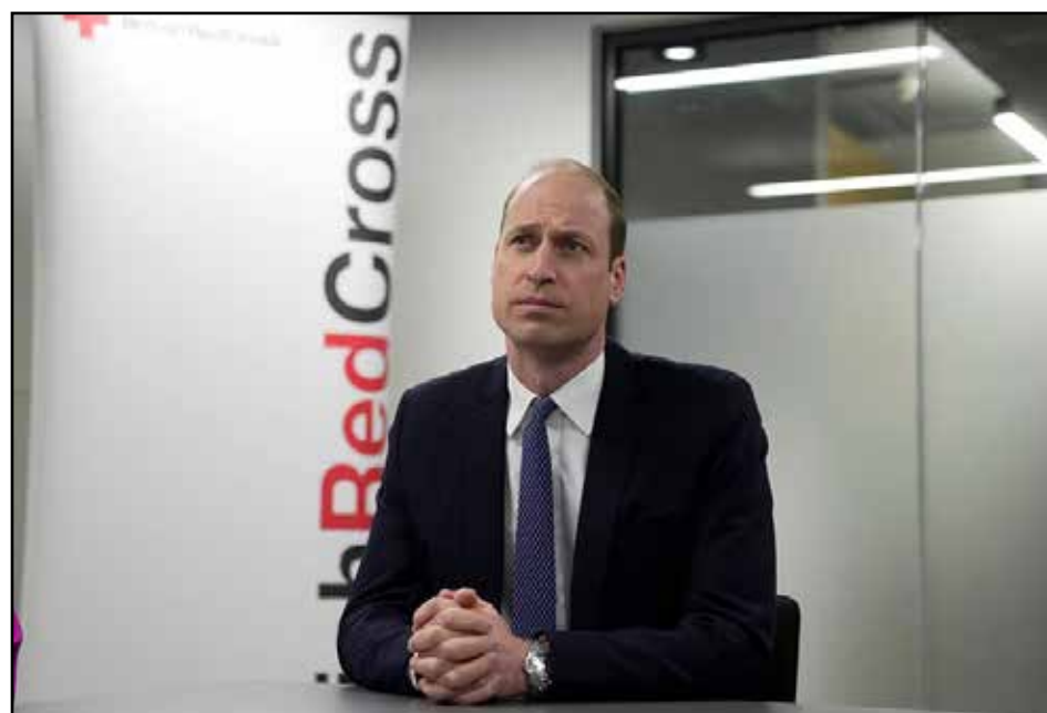
PRINCE WILLIAM: "I, like so many others, want to see an end to the fighting as soon as possible,"

With his father King Charles currently absent from official public duties as he undergoes treatment