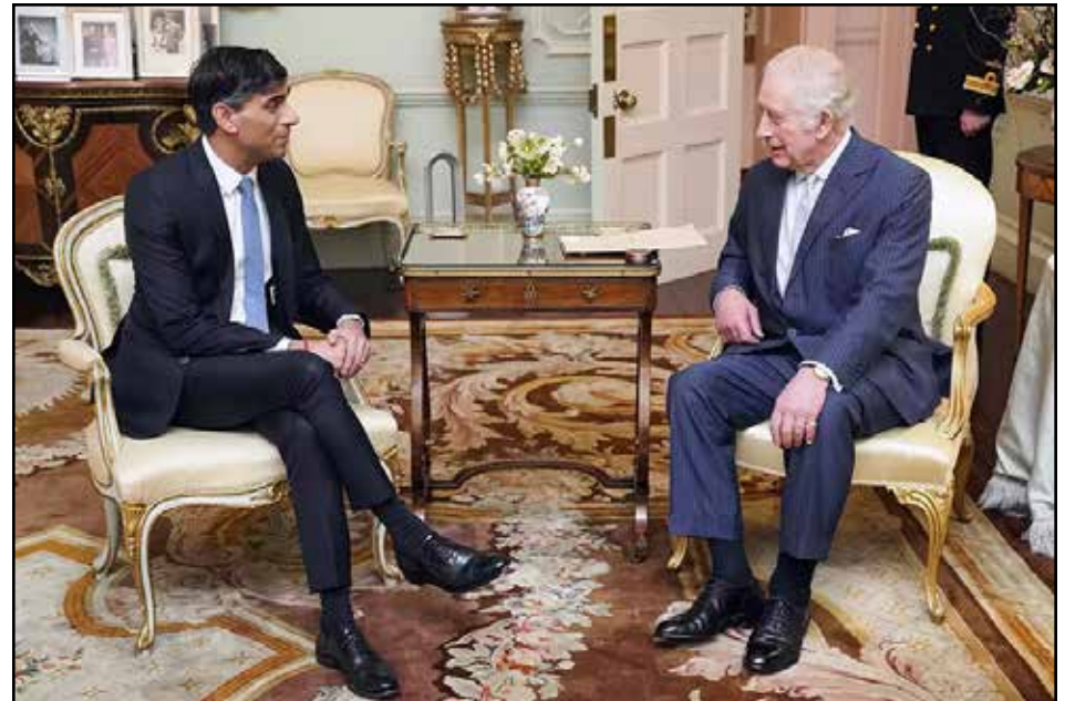
The PM told Charles: “We’re all behind you. The country is all behind you.”

At each gathering which usually takes place monthly, the Council, which is held in private, obtains the King’s formal approval to orders which have already been