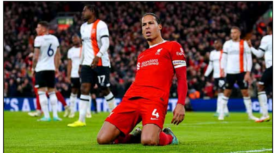
Virgil van Dijk was in magisterial form for Liverpool at Anfield on Wednesday night

With nine senior players unavailable due to injury, including goalkeeper Alisson, Mohamed Salah, Trent Alexander-Arnold, Darwin Nunez and Dominik Szoboszlai,