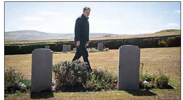
NOT FORGOTTEN: Lord Cameron included a tour of the San Carlos cemetery during his brief visit to the Falkland Islands this week

He then headed to Paraguay and to Brazil on Wednesday for a meeting with G20 counterparts.