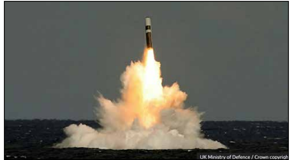
This picture shows an unarmed missile being fired from HMS Vigilant in 2012, the last successful test

"On this occasion, an anomaly did occur, but it was event specific and there are no implications for the reliability of the wider Trident missile