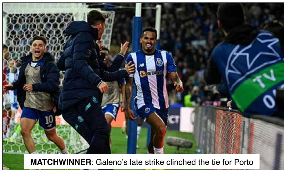
MATCHWINNER: Galeno's late strike clinched the tie for Porto

Whatever he said to his players clearly had the desired impact as they came out of the blocks with intent and got the job done in style to extend their unbeaten home league run to 25 games.