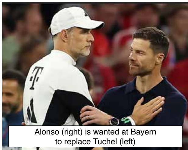
Alonso (right) is wanted at Bayern to replace Tuchel (left)

LIVERPOOL'S hopes of landing Xabi Alonso became a lot more complicated this week after Bayern Munich made him their top target to replace Thomas Tuchel. Former Chelsea manager Tuchel will leave Bayern in the summer, after three successive defeats severely dented their hopes of a 12th successive Bundesliga crown, and left them facing a potential Champions