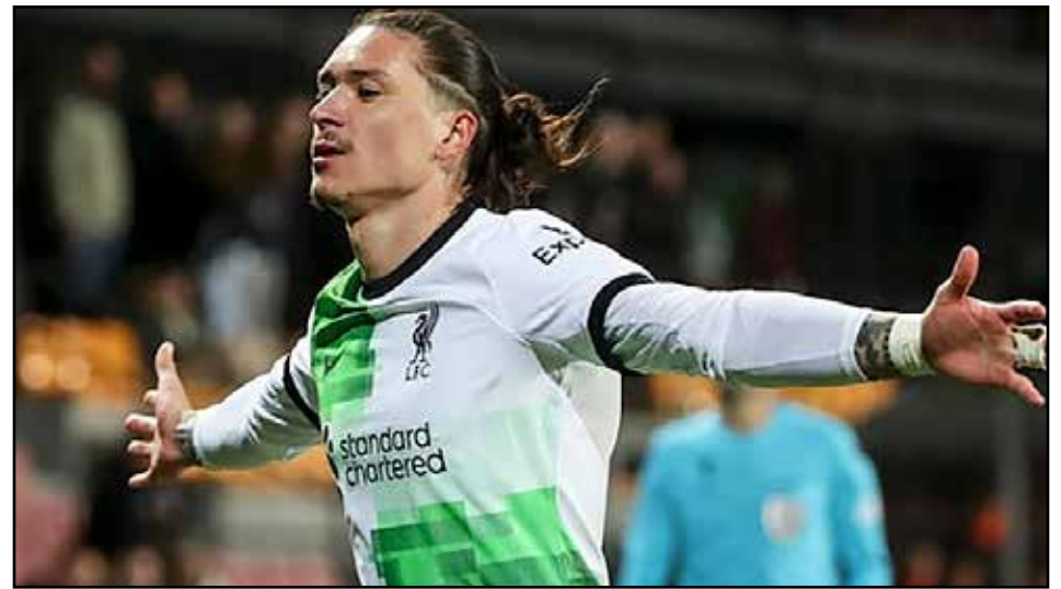
Darwin Nunez's first goal Thursday was the 1000th of Jurgen Klopp's tenure

It remains to be seen whether Klopp was being cautious with both players before a domestic