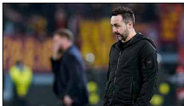
Roberto de Zerbi has now lost three successive games in all competitions for the first time as Brighton boss

into the game, hitting the post through Simon Adingra's deflected cross while Danny Welbeck forced an instinctive save from Roma keeper Mile Svilar.