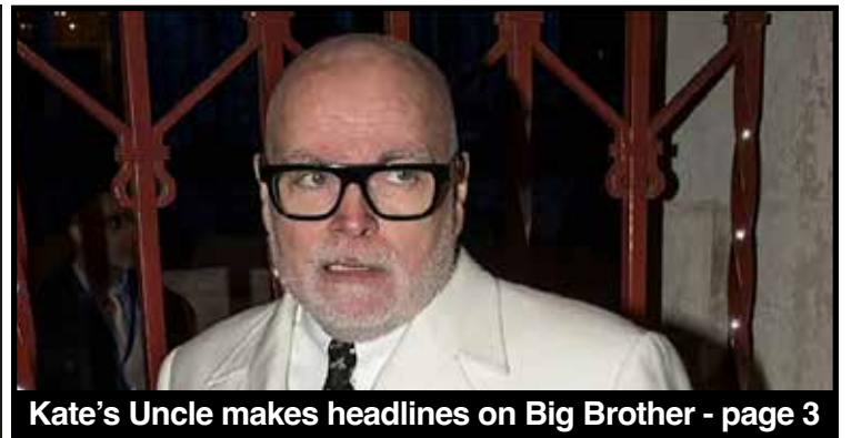
Kate's Uncle makes headlines on Big Brother - page 3