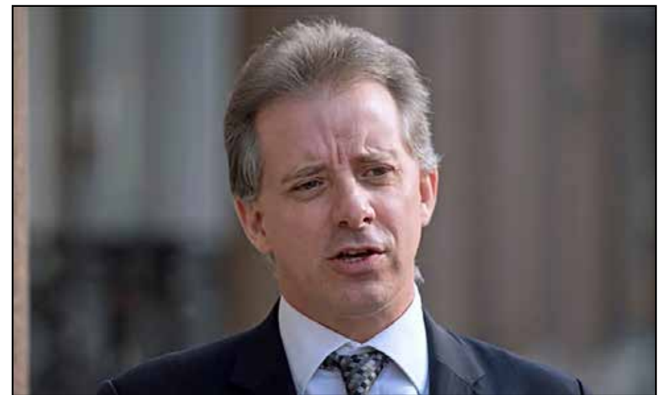
Christopher Steele speaking to the media in 2017