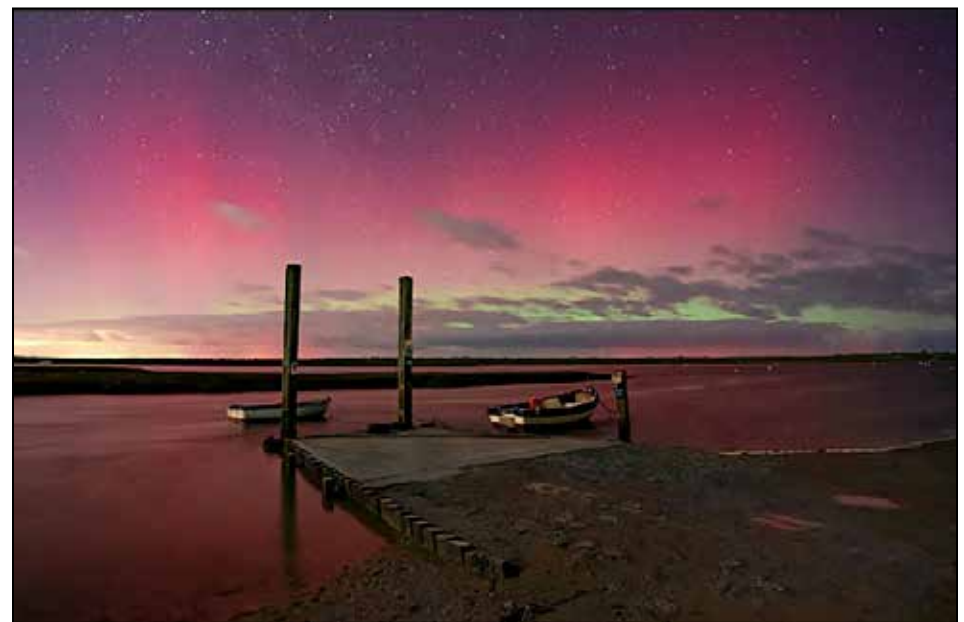
Pink hues photographed over Brancaster Staithe in Norfolk