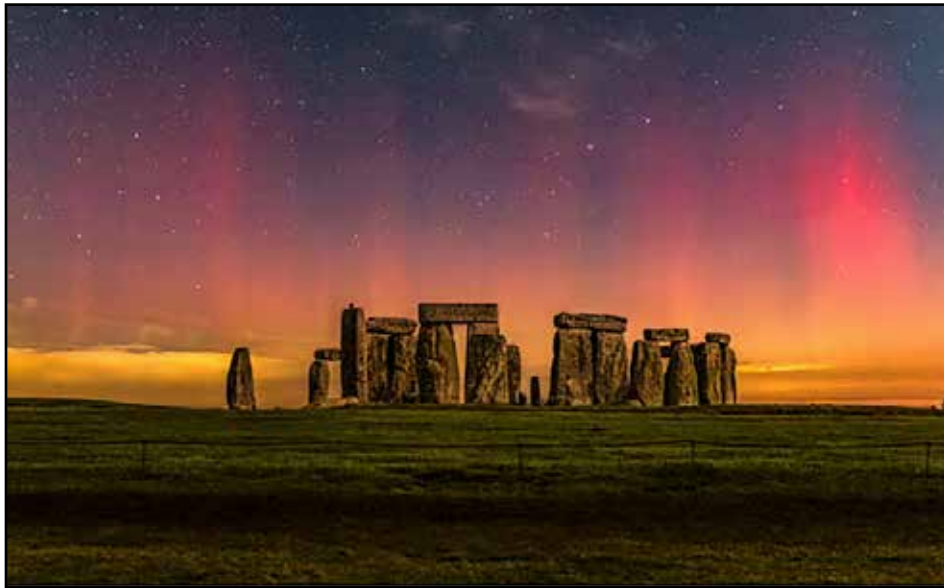
ILLUMINATING STONEHENGE: Residents across the UK got a rare glimpse of the breathtaking Northern Lights on Sunday and Monday with stargazers and photographers eager to catch the phenomenon. (Below): Beach huts on Southwold beach, Suffolk, make a striking contrast to the pinks and purples of the lights