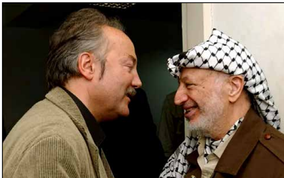
Like minded: George Galloway with Yasser Arafat in Ramallah in 2002