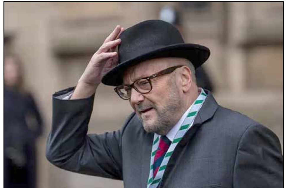
GALLOWAY: a stridently pro-Palestinian stance won him the Rochdale by-election

the side of the political establishment, not least since 2003 when then-UK Labour Prime Minister Tony Blair expelled him from the party due to his uncompromising opposition to the Iraq War.