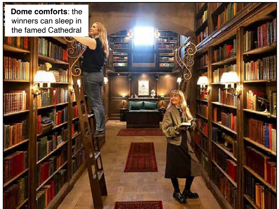
Dome comforts: the winners can sleep in the famed Cathedral

The book collection was almost completely destroyed in the Great Fire of London in 1666 but