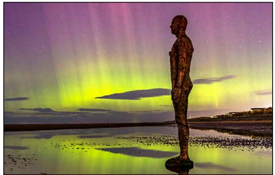
The aurora borealis created spectacular backdrops across multiple horizons, including the Antony Gormley statue on Crosby beach north of Liverpool

Red is solar particles meeting oxygen at very high altitudes.