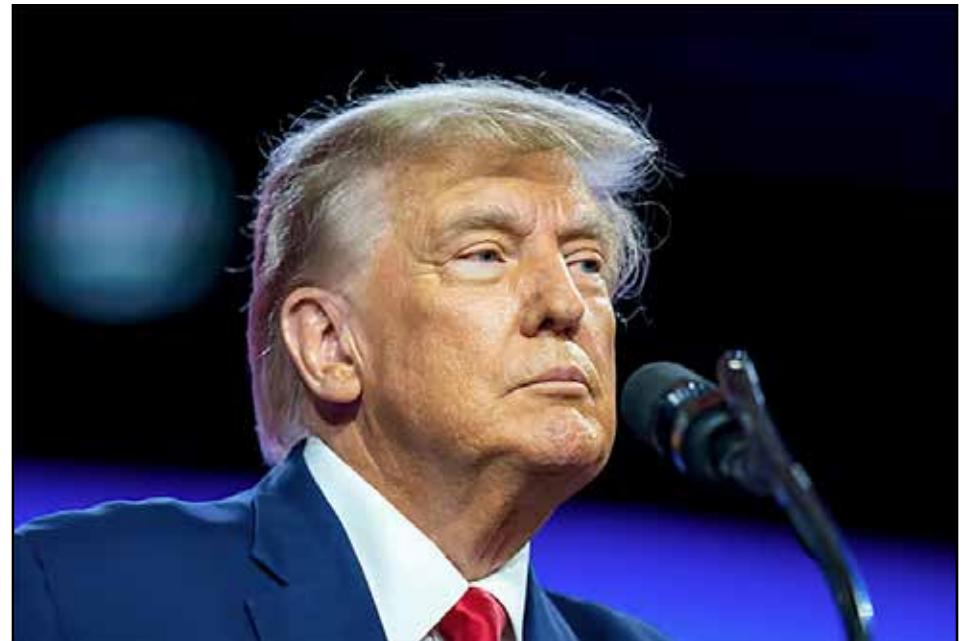
Trump sued Orbis, claiming the company had broken UK data-protection laws

Orbis had said the lawsuit should be thrown out because the report had never been meant to be made public and was published by BuzzFeed without the permission of Steele or Orbis. It also said the claim had been filed too