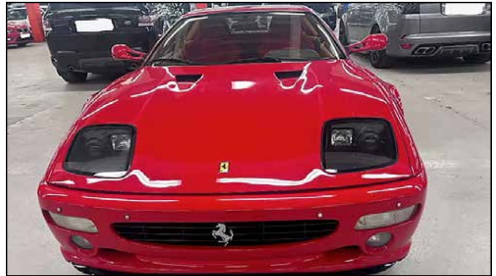
STYLISH REDHEAD: the Testarossa was shipped to Japan shortly after it was stolen, but found its way back to Britain recently, where it was offered for sale

Berger famously tried to stop the car being stolen, first by standing