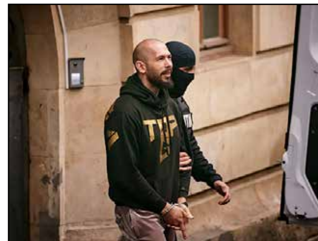
Andrew Tate: a 'Top G'...in his own mind

In a separate case, the Tates are charged with rape, human trafficking and forming a criminal