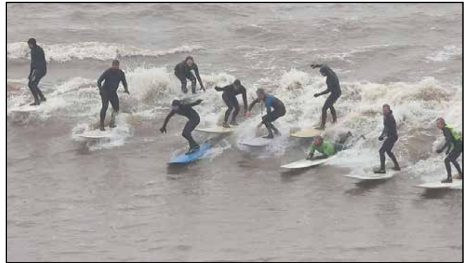
THE SEVERN RIVER: "It's muddy, it's dirty, it's not glamorous."

The first man known to have surfed the bore was Jack Churchill - a World War II veteran famous for carrying a Scottish broadsword into battle, and being the only