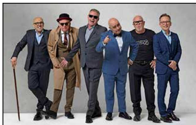
GEEZER MADNESS: the lads 'aint young no more..