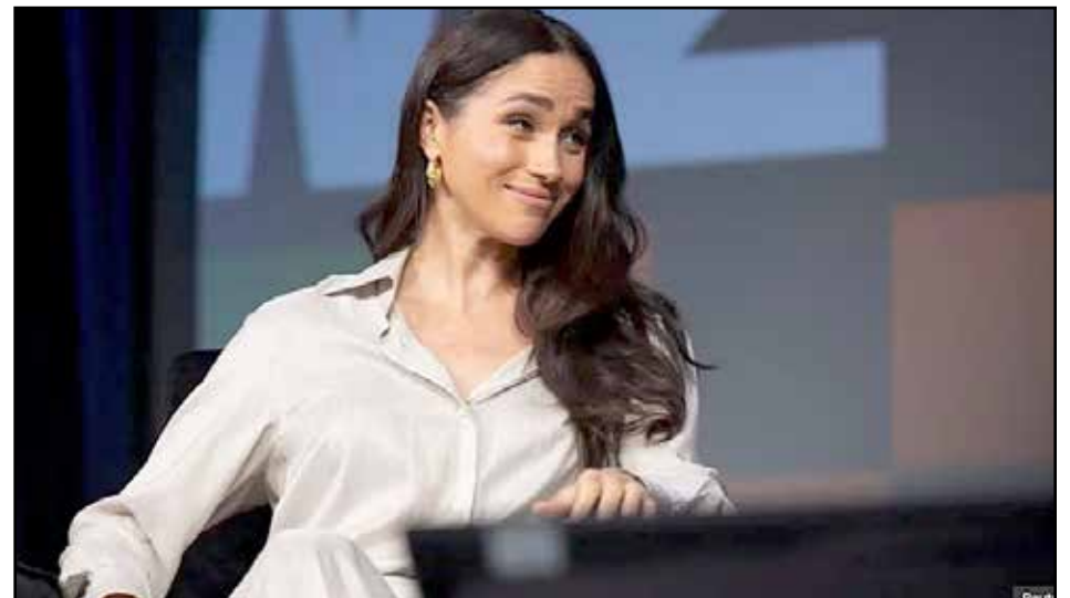
Meghan's American Riviera Orchard was announced on Instagram this week

The website includes the brand logo and a prompt to sign up for a