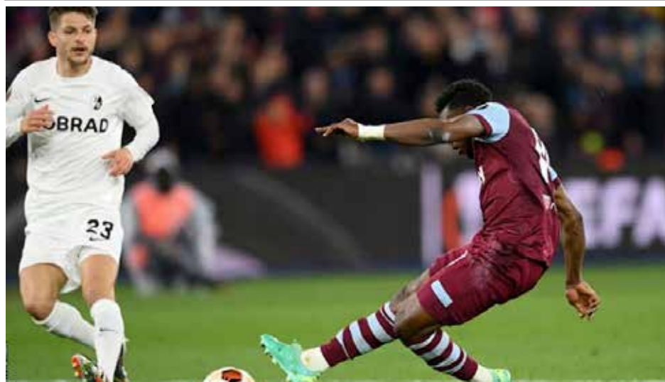
KUDOS TO HIM: Mohammed Kudus scored twice as West Ham thumped Freiburg

blasted in a third goal, with the ball going in off the underside of the crossbar. Diaby slotted in a fourth nine minutes from time to confirm their progress.