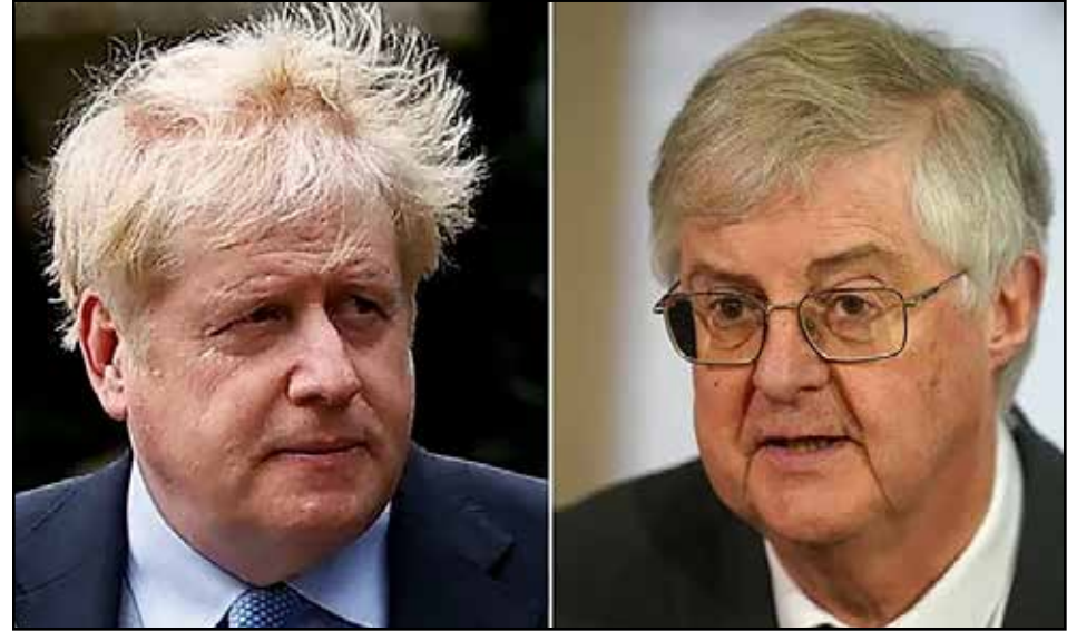
POSTMORTEM: Mr Johnson was “not taking it (Covid) seriously”, Mark Drakeford (right) told the public inquiry in Cardiff this week

Mr Drakeford said the then prime minister had assured the devolved administrations he would “do his very best” – but then delivered a TV address where he incorrectly gave the