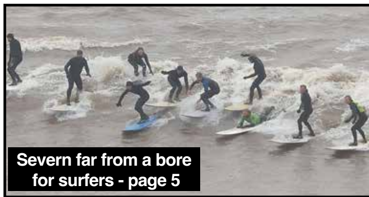
Severn far from a bore for surfers - page 5