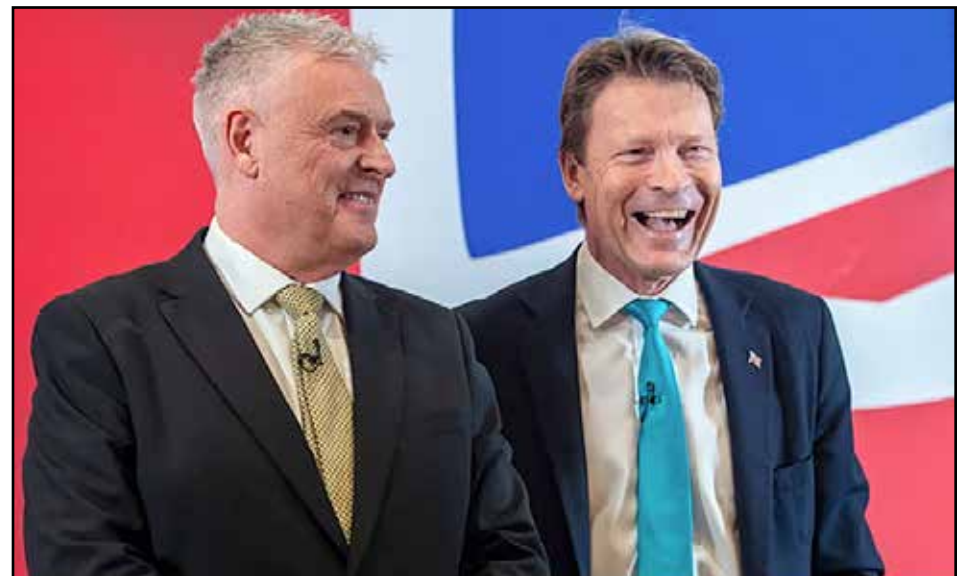
"I want my country back": Reform leader Richard Tice (right) with his new and only MP, Lee Anderson at a press conference in London on Monday

The New Conservatives grouping of MPs, led by Danny Kruger and Miriam Cates, said that while they criticised Anderson's move for