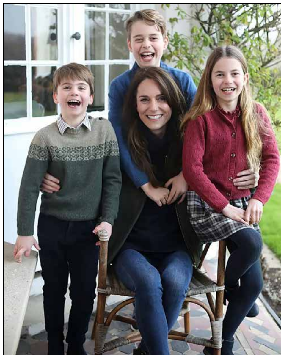
FINGERS CROSSED? the Mother's Day image taken by the Princess of Wales which ignited a firestorm of controversy - and reignited gossip about a possible affair

And American TV star Stephen Colbert brought another embarrassing issue into the mainstream