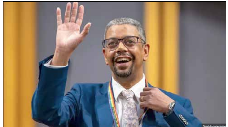
GETHING: "it is very easy not to care about identity when your own has never once been questioned or held you back."

"As first minister, I will bring together