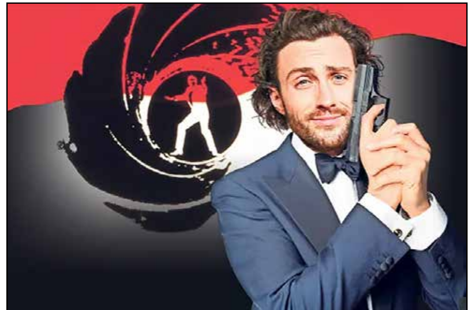
Aaron has appeared in several major Hollywood films, including Nocturnal Animals, Nowhere Boy and Avengers: Age of Ultron

A source said: "He is extremely interested in doing something very different with the franchise."