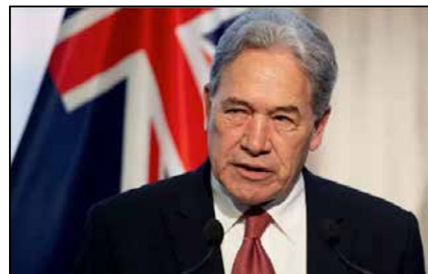
Upsetting the anarchists: Winston Peters

Though the band released several singles, Mr Peters took aim at Tubthumping being Chumbawamba's biggest