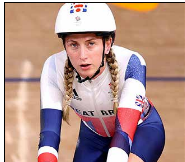
"The sacrifices of leaving the children and your family at home is really a big decision to make."