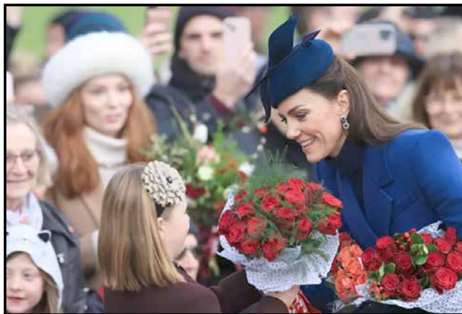
Princess Kate the last time she was seen in public, greeting the crowd after attending a Christmas morning service at Sandringham Church on December 25, 2023, in Sandringham, Norfolk.

Kensington Palace has declined to confirm or deny the reports and