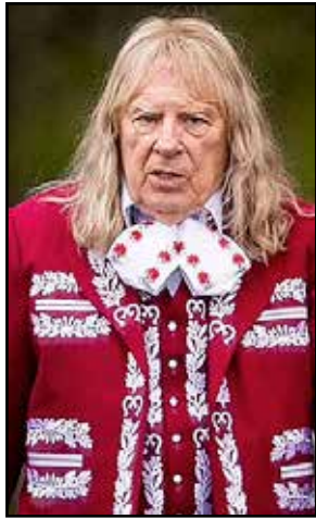
ROCK OF AGES: Michael McKean in Spinal Tap 2