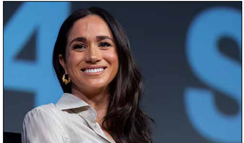
Harry's lawyer told the court NGN knew a private investigator had unlawfully obtained the Duchess of Sussex's mobile and social security numbers

Four others, who previously pleaded guilty, received sentences ranging from 27 months in jail to a 16-month suspended sentence.