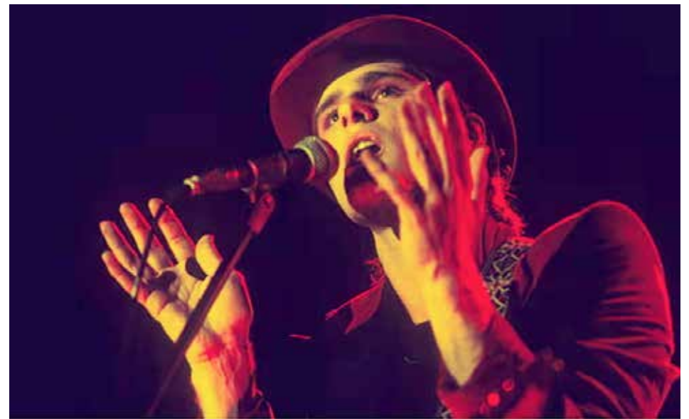
At his peak: Steve Harley performing in 1975

Harley was born in south-east London in 1951 and spent almost four years in hospital as a child after contracting polio. At the age of 17, he joined the Daily Express as a trainee accountant before working as a journalist