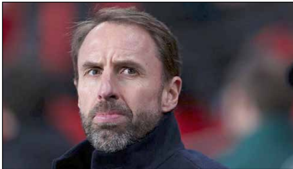
BIGGER=BETTER: the England manager would welcome a squad size increase

years. He's one of the main reasons we went to the World Cup and the Euros before that. Everyone will support him and will remember what he's done for Wales, not just a penalty miss."