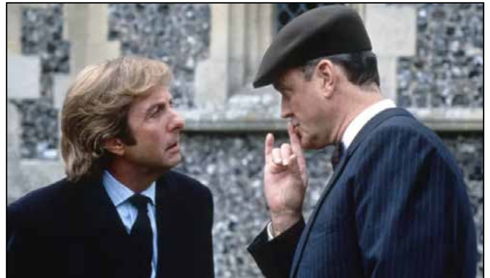
'We always loathed and despised each other' Idle and Cleese in Splitting Heirs (1993)

surprised by his downturn in fortunes, writing: "We own everything we ever made in Python." When asked if a Netflix documentary could help, he wrote: "F*** Netflix and f*** documentaries."