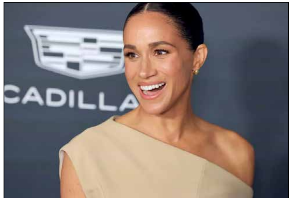
MEGHAN: 'proud' to announce a new deal with Lemonada Media

He also questioned the launch timing, less than a week after Harry rushed