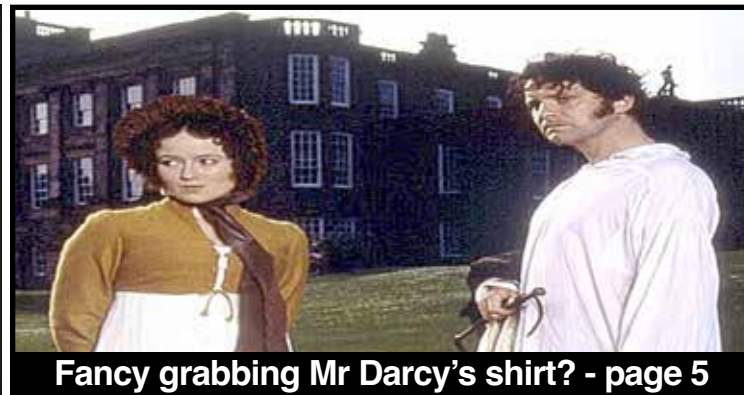
Fancy grabbing Mr Darcy's shirt? - page 5

California's British Accent™ - Since 1984