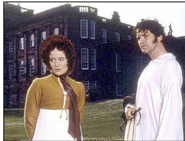
WHITE HOT: Jennife Ehle as Elizabeth Bennet and Colin Firth as Mr Darcy in the 1995's Pride and Prejudice