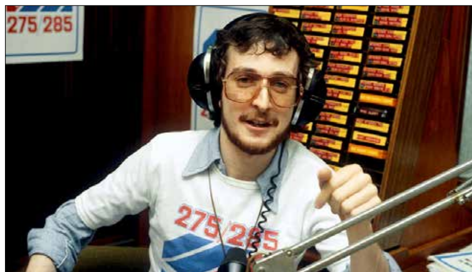
PEAK OF HIS POWERS: Steve Wright on Radio One in 1981

In 2022 Wright quit his popular mid-afternoon Radio 2 show live on air, claiming he was forced out by BBC bosses after 24