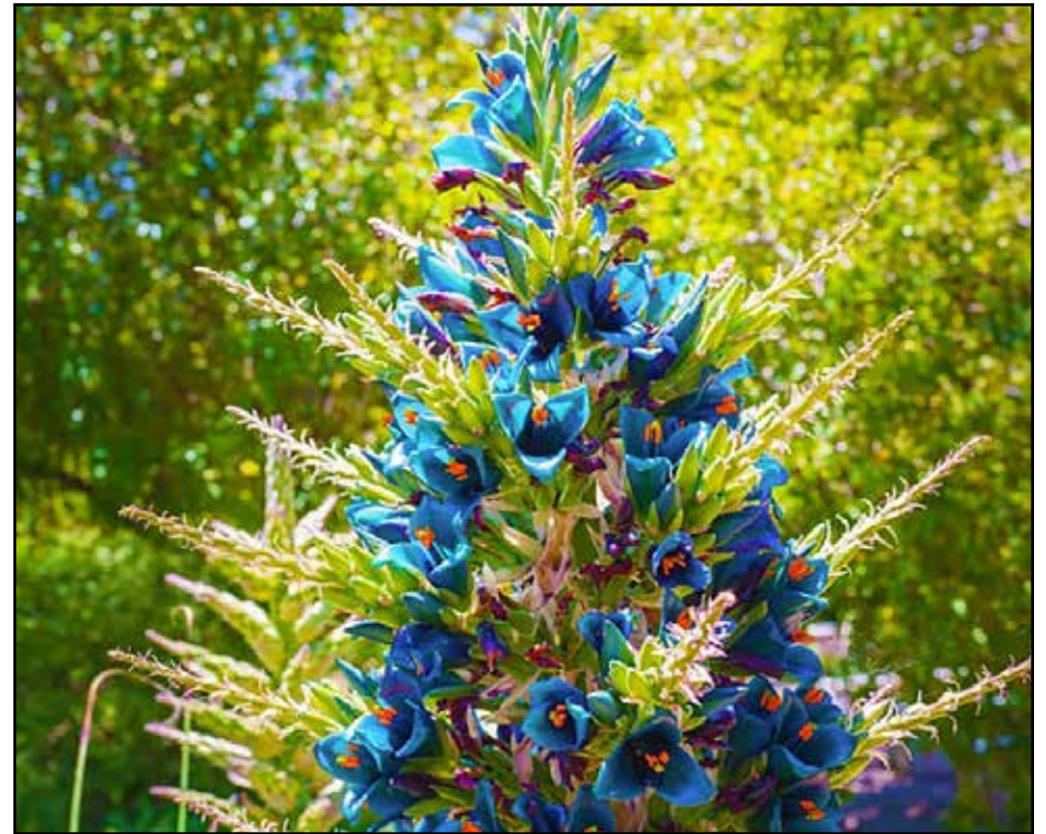
BIRMINGHAM STAR: The Puya Alpestris in all its glory this week

Part of the bromeliad family, which includes more familiar plants like pineapples and Spanish moss, Puya alpestris is particularly notable for its unique and vibrant characteristics. It is characterized by its rosettes of silver-green leaves that are long,