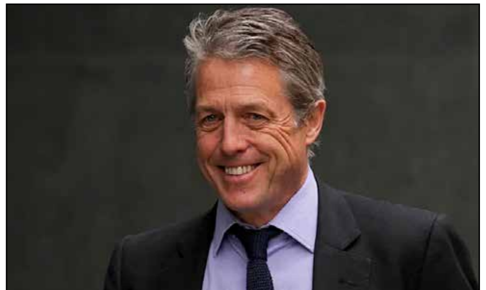
FILTHY LUCRE? The actor said the money he would receive from News Group Newspapers in the settlement from had a "stink" about it,

The actor, alongside the Duke of Sussex, was suing NGN for alleged widespread unlawful information