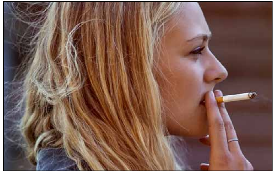
Targeting the sale, not the smoking: People born in or after 2009 will never be able to legally buy cigarettes, leading to an effective ban

Ms Truss, who led the charge in the Commons against the proposals, said MPs should not "protect adults from themselves", and argued the ban is "emblematic of a technocratic establishment". The former PM slammed