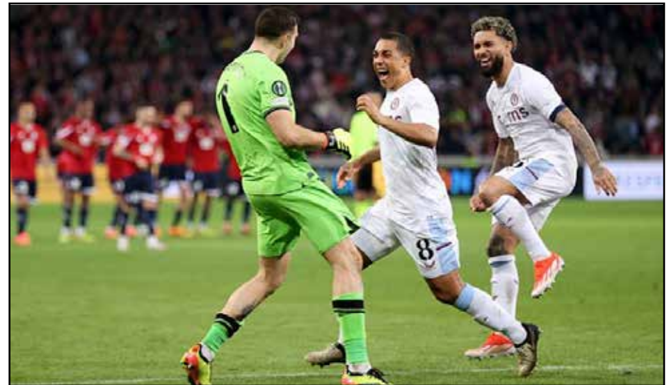
EMI WONDER: Martinez celebrates with his teammates following his shootout saves

But Matty Cash's 87th-minute deflected strike - after goalkeeper Lucas Chevalier had dropped a cross - made it 3-3 on aggregate and forced extra time which did not produce any further goals leaving the tie to be