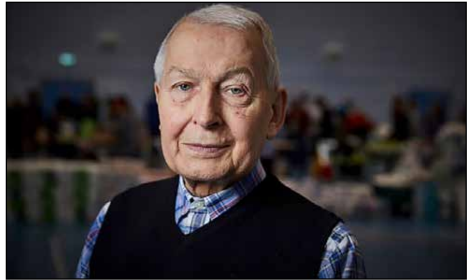
Field was first elected as the Labour MP for Birkenhead in Merseyside in 1979

“It abruptly ends the pro-independence majority government which the public voted for, and which members of both parties supported,” she said.