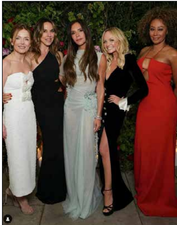
Geri Halliwell, Melanie Chisholm, Victoria Beckham, Emma Bunton and Melanie Brown were back in the limelight in London on Saturday night

Victoria shared a series of photos on Instagram of her family, including her husband and the couple's four children - Brooklyn, Romeo, Cruz and Harper.