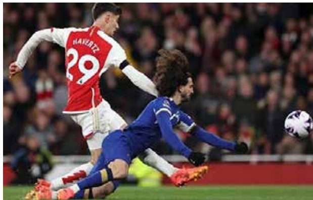
Kai Havertz tormented his former club on Tuesday

Leandro Trossard settled any early nerves when he beat Chelsea keeper Djordje Petrovic at his near post and while