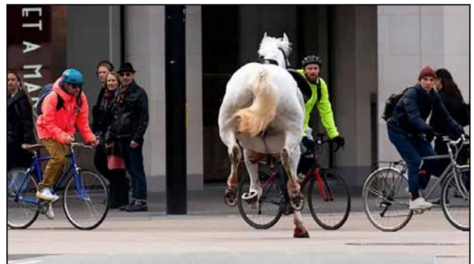
The four horses caused injuries to several people and a double decker bus after being spooked by construction activity in the Belgravia neighborhood

"The ensuing shock caused all horses to bolt and unseated some riders."