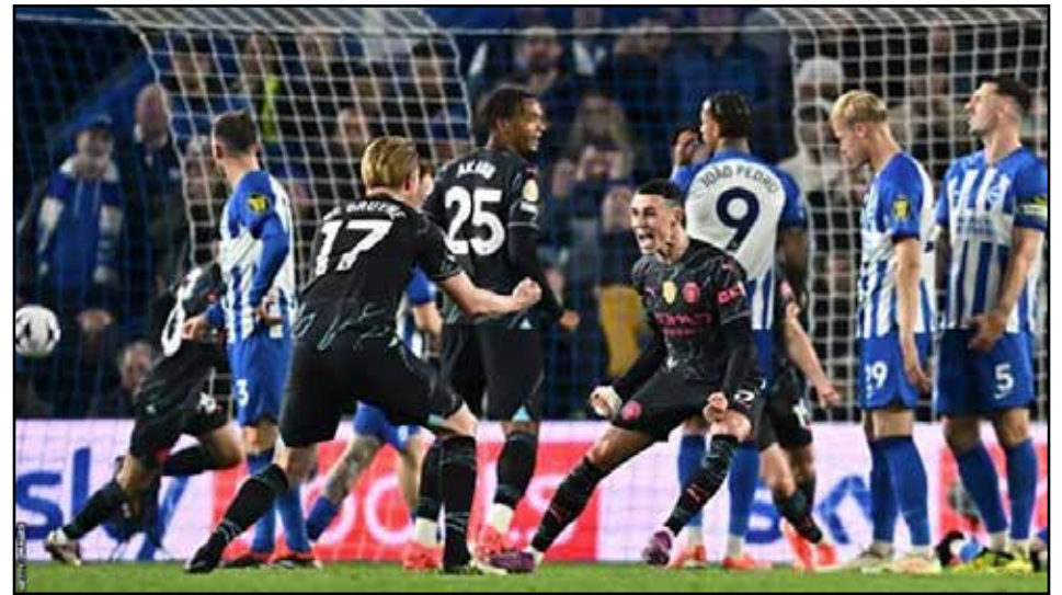
TWO EASY: Phil Foden continued his rich vein of form as he became the tenth City player to score at least 50 goals in the Premier League

Manchester City are at it again, reaching peak form just when it matters to turn up the pressure on pace-setters Arsenal as the title race reaches the final few fences.