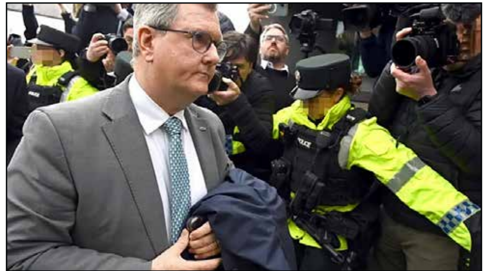
SIR JEFFREY DONALDSON: The offences he is charged with are alleged to have occurred between 1985 and 2006

Both stood up when the charges against them