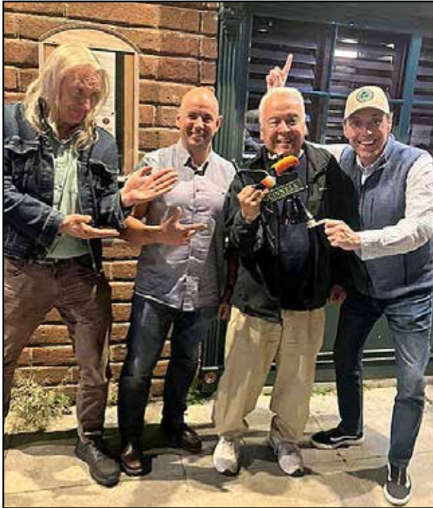
WINNERS: Team You Can't Acquit