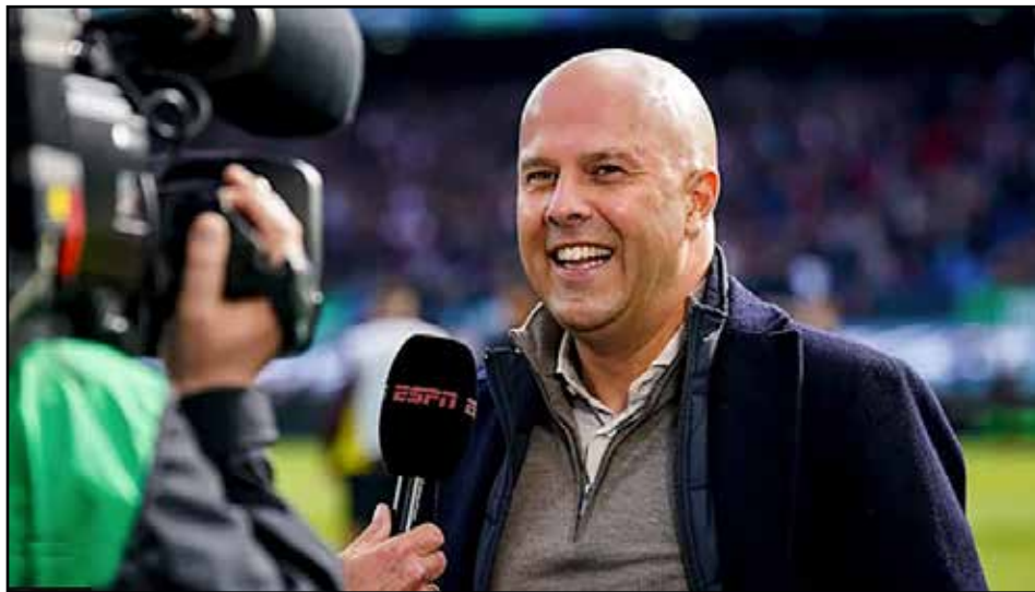
Arne Slot: 'confident' Liverpool and Feyenoord will reach an agreement

Arne Slot has said he hopes to take over from Jurgen Klopp as Liverpool manager at the end of the season.