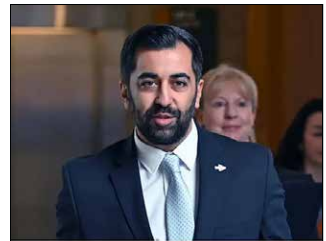
Mr Yousaf has been in power for less than a year

the first minister had managed to annoy every opposition party in