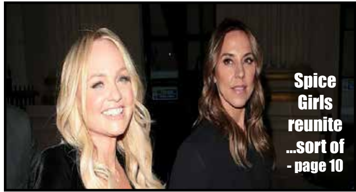
Spice Girls reunite ...sort of - page 10

California's British Accent™ - Since 1984