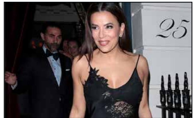
ALL ABOUT EVA: actress and producer Eva Longoria added some LA glitz to the party

Power" mantra - a brand that made them a global of female empowerment pop culture phenomenon.