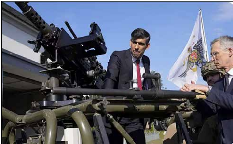
Sunak said the extra money would put the country’s defence industry “on a war footing”.

Now the Conservatives have set a specific date, but with no guarantee that they will still be in power.