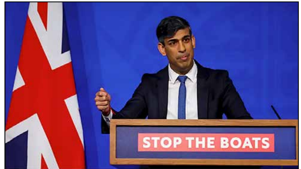
TAKING A FLIER: The PM claims the first flights will leave in 10-12 weeks

Mr Sunak did not confirm how many people would be on board, but said there would be "multiple flights a month through the summer and beyond".