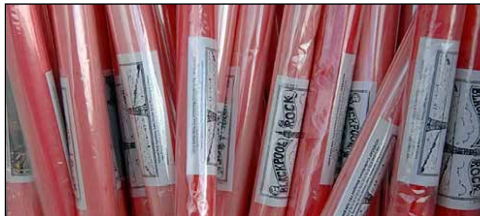
Manufacturers say Blackpool rock should get protected status